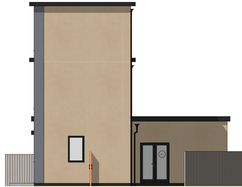
Proposed Side Elevation 1:100