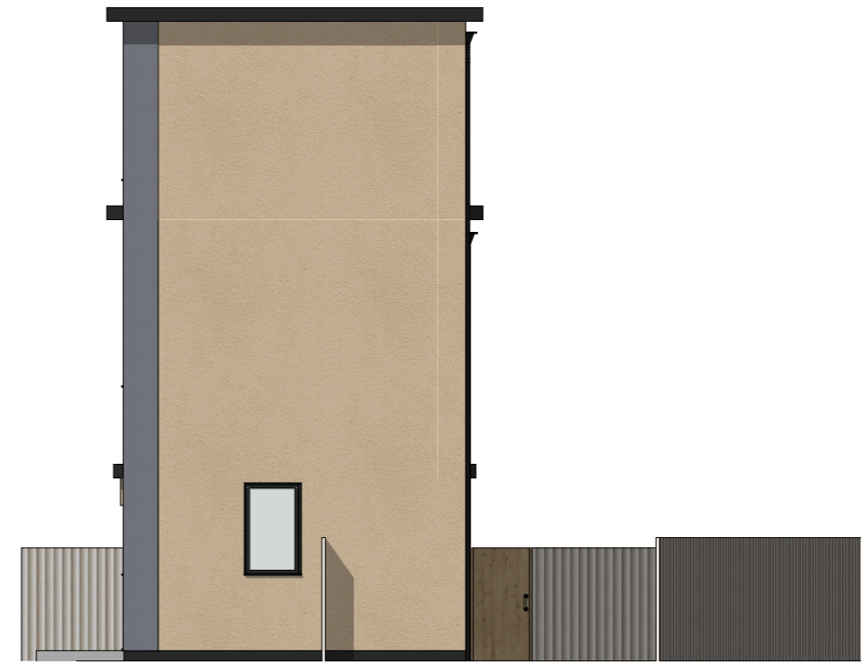
Existing Side Elevation 1:100