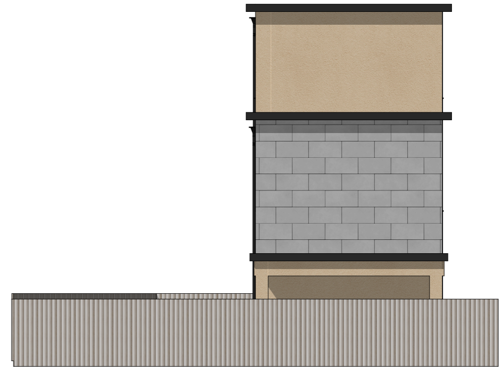
Existing Side Elevation 1:100

Dimensions to be checked on site by builder.