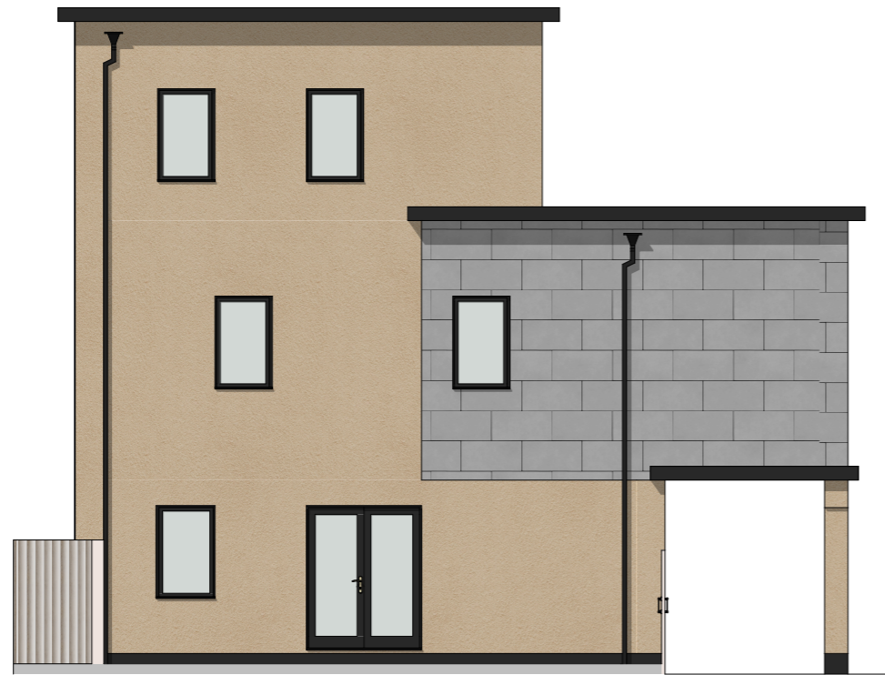
Existing Rear Elevation 1:100