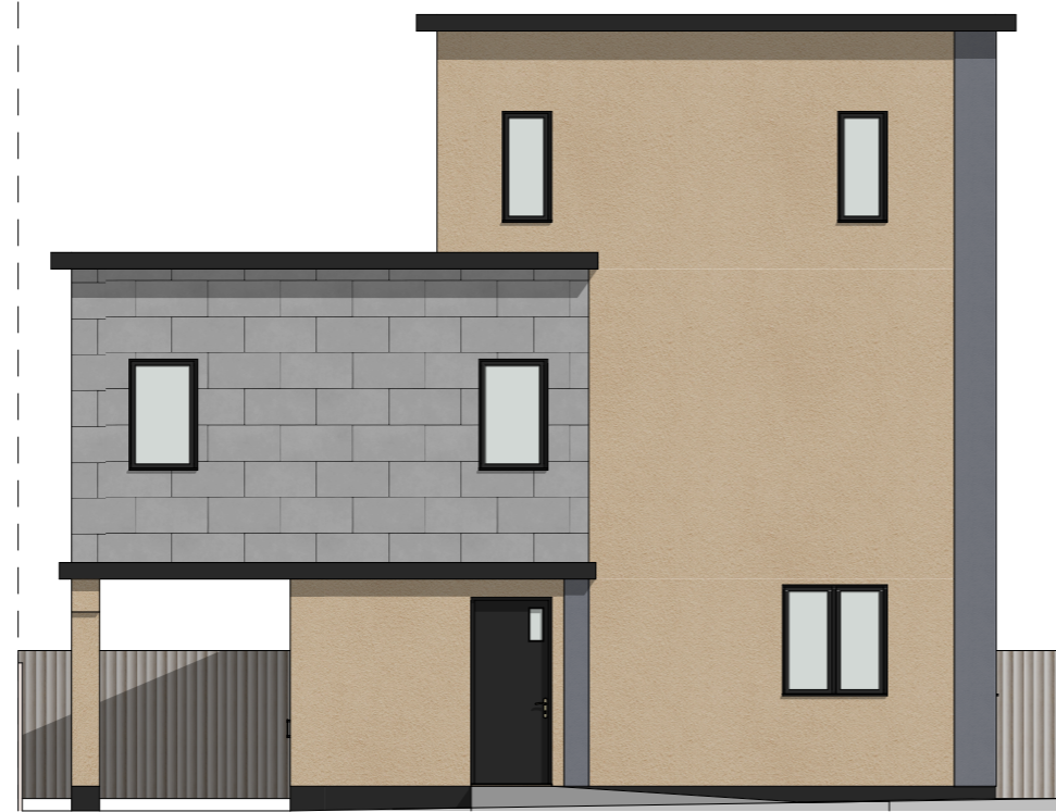
Existing Front Elevation 1:100