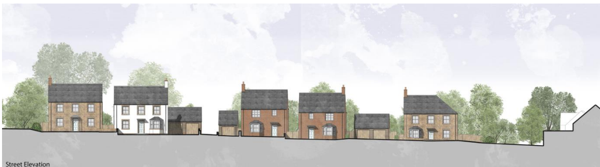
Figure 3 – Street Scene of Appeal Proposal

The Appellant does not provide an image of the rear street view of the scheme only a front street view – see Figure 3.