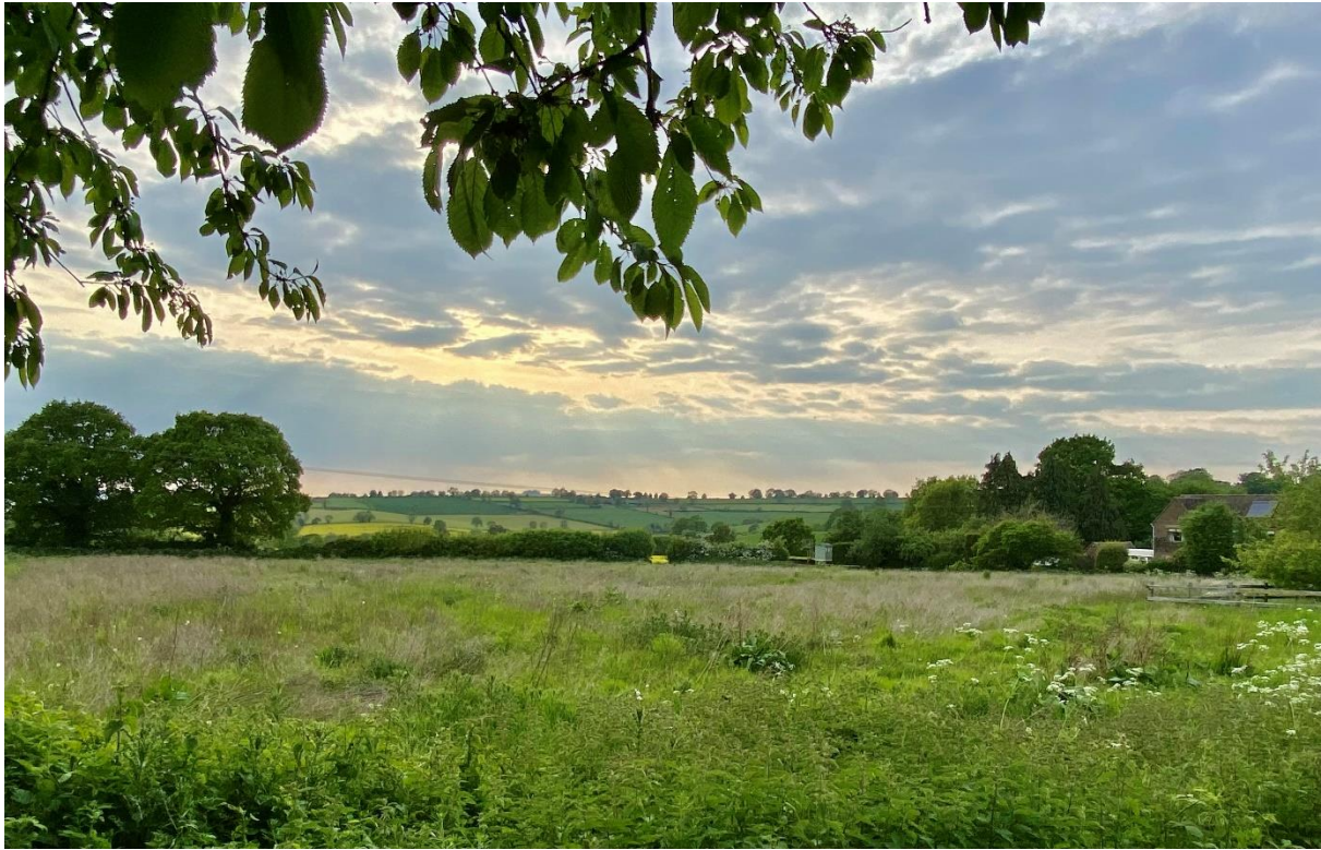
Figure 5 – Existing outlook from garden of Bramley House

The impact of the proposal on existing properties can be gauged from Figure 5, which shows the existing outlook from the gardens of High Rock/Bramley House to the immediate east of the site and will be lost.