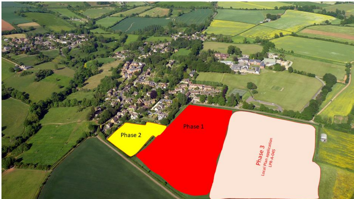
Figure 1 – Pressure for Residential Development in this Locality

The Action Group considers that just because one development has been unfortunately allowed does not mean this latest, amended and harmful proposal should also be approved.