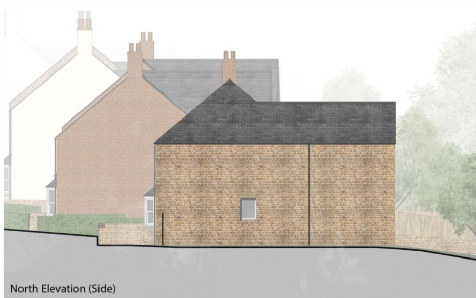
Figure 6 – View of Proposal from the North (Faraday House)

The physical impact of the dwellings – especially Plot 5 – is perhaps most acute upon Faraday House just 15 metres to the north of the site, as shown on Figure 6 taken from the application.