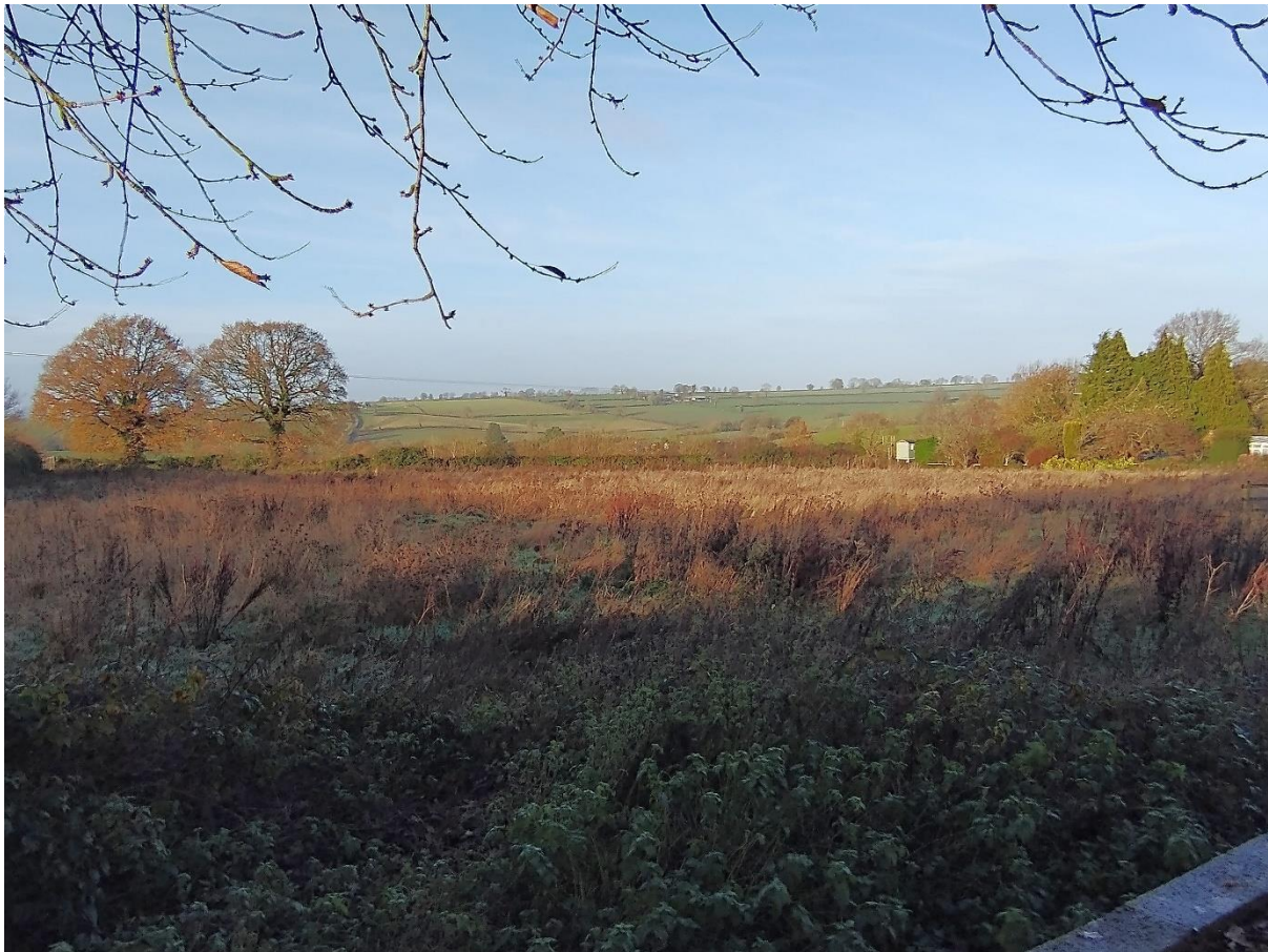
Figure 5 – View of Appeal Site from Garden of Bramley House (to immediate east)

The Action Group remains concerned about this matter and asks the Inspector to pay careful regard to the residential amenity considerations set out in the original objection – see Appendix 1. This is because of the likely physical impact arising from the siting of the proposed development on the eastern side and at the top of the site, within metres of the open rear gardens of neighbouring properties, including Faraday House and Ferris House to the immediate north and Bramley House, Butwick House, High Rock and Richmond House bordering the site to the east, which presently have an attractive open aspect across the appeal site towards open countryside and the Cotswolds AONB. This can be seen at Figure 5, taken from the rear garden of Bramley House.