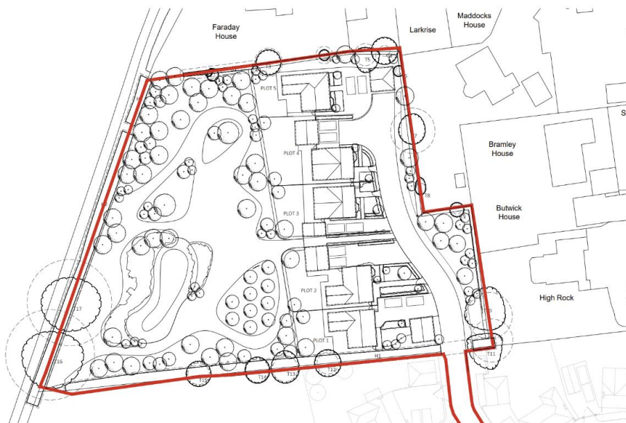
Figure 4 – Applicant's Proposed Site Plan

Outlook is important as a dwelling without a reasonable outlook is an undesirable place to live. This is even more important and critical in village locations in rural areas where there is a loose-knit pattern of development and residents have become accustomed to having an open outlook onto fields and the countryside beyond. Whilst the planning system operates in the public interest and does not protect private views, it is not unreasonable for proposed development to respect existing residential amenities, deliver suitable living conditions and maintain an acceptable outlook. The close proximity of the proposal to existing dwellings is evident from Figure 4, although it should be noted that Butwick House lies to the north of Bramley House, not to the south.