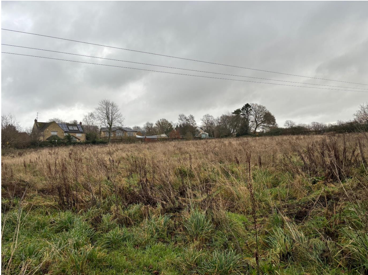
Figure 4 – View of Appeal Site from Woodway Road

The rear view and the rear private gardens would no doubt be dominated by high privacy enclosures and domestic paraphernalia. This added to the row of houses and garage buildings running across the contour on the highest part of the site would appear as a quite densely packed, row of built development on greenfield, agricultural land in a “backland” location intruding into the attractive countryside surrounding the village. This is at odds with the settlement pattern in Sibford Ferris and out of character with existing houses, which are sited in spacious plots with a connection and relationship with the village and surrounding countryside. See Figure 4.