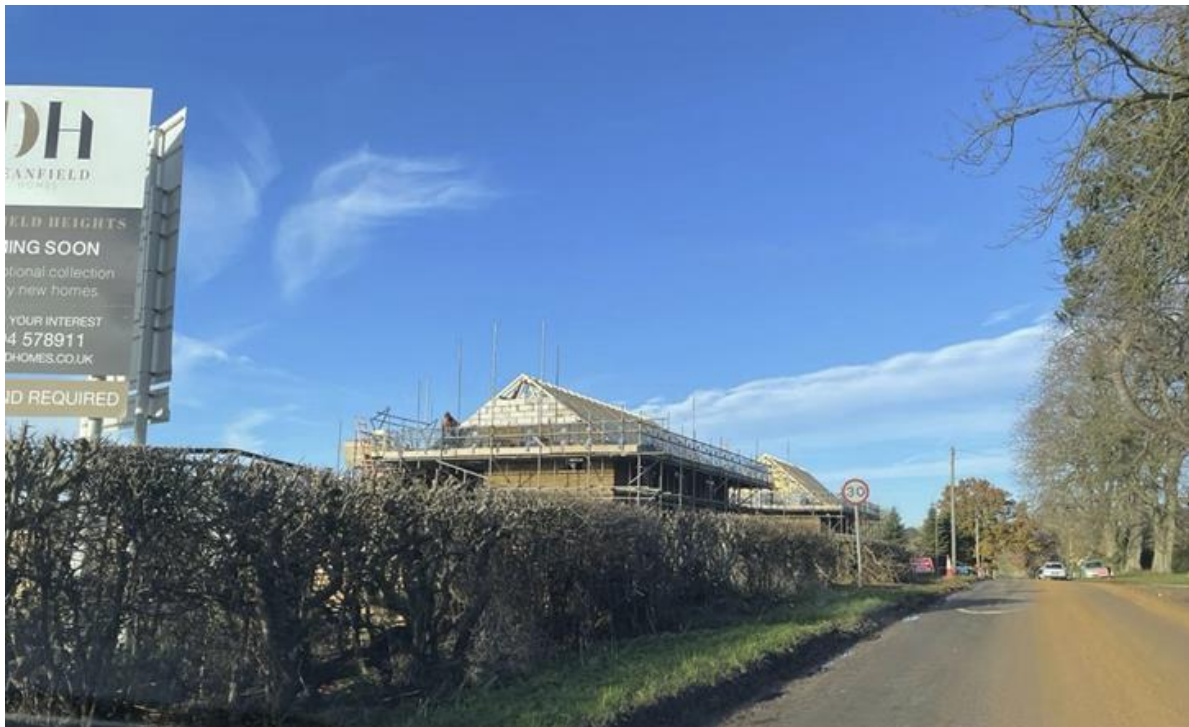
Figure 1 – Development at Hook Norton Road, Sibford Ferris

As set out above the statutory development plan - principally policies in the CLPP1 but also Policy H18 of the CLP 1996 - is aimed at delivering growth in accordance with the NPPF, which includes limited further development at the villages to sustain them. The development of 25 no. homes at Hook Norton Road, Sibford Ferris pursuant to the appeal allowed in 2019 (APP/C3105/W/19/3229631) is already well underway – see Figure 1 – and will satisfy this objective.