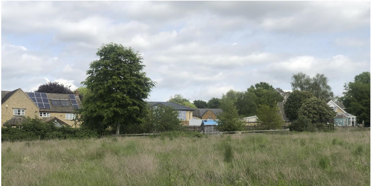
Figure 3 – Existing dwellings and their gardens to the east facing the site

eastern side and top of the site, within metres of the open rear gardens of neighbouring properties, which can be seen on Figure 3 overleaf.