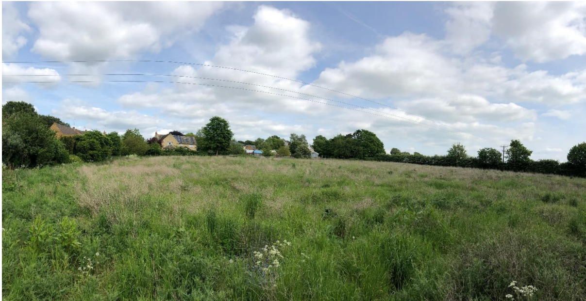
Figure 2 – View of Site from Woodway Road

The current proposal has been amended in terms of its design, layout and landscaping, with 5 no. two storey dwellings with garages, driveways, small gardens and an access driveway concentrated in about half of the site, close to existing dwellings on Woodway Road, Hook Norton Road and Stewart's Court.