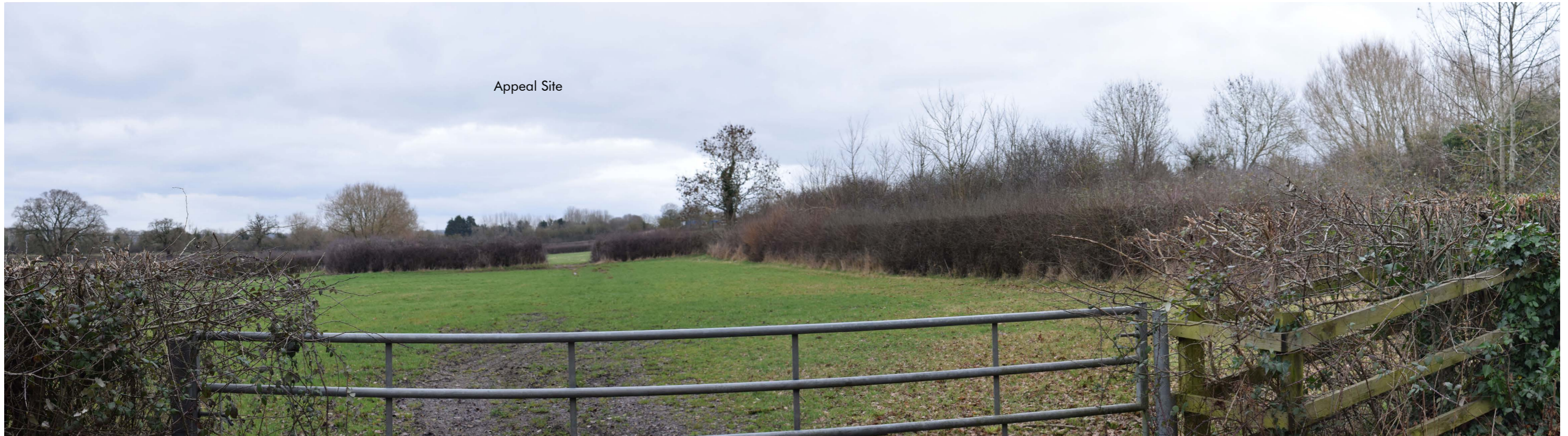
NB VP 6 Additional Sequential View looking northeast through gateway on Ploughley Road adjoining the appeal site (supplements EDP4)