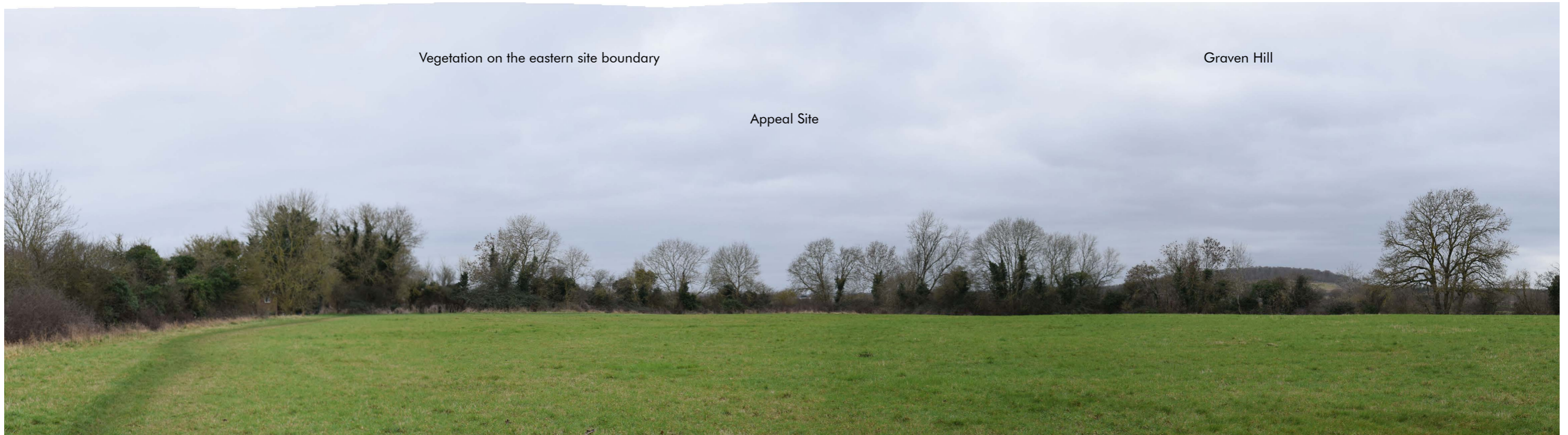
NB VP2 Additional Sequential View looking southwest from Bridleway 105/6/20 approximately 165m north-east of the appeal site.