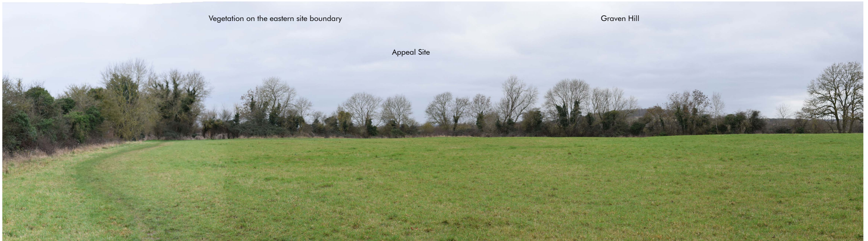
NB VP1 Additional Sequential View looking southwest from Bridleway 105/6/20 approximately 100m north-east of the appeal site (supplements/replaces EDP 2).