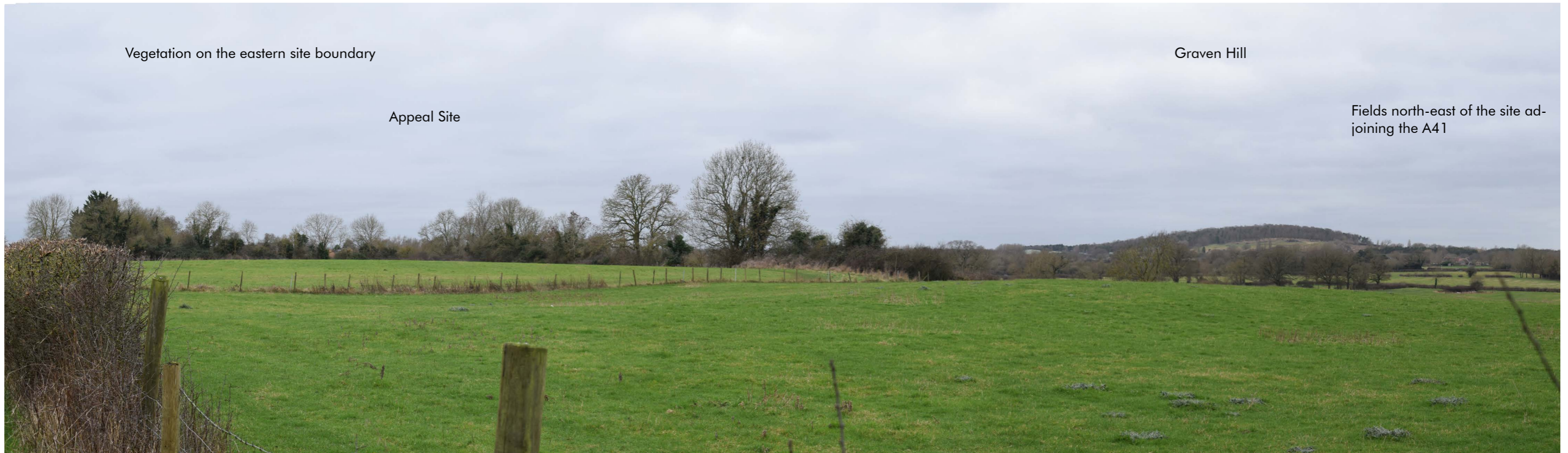
NB VP3 Additional Sequential View looking southwest from Bridleway 105/6/20 approximately 195m north-east of the appeal site.