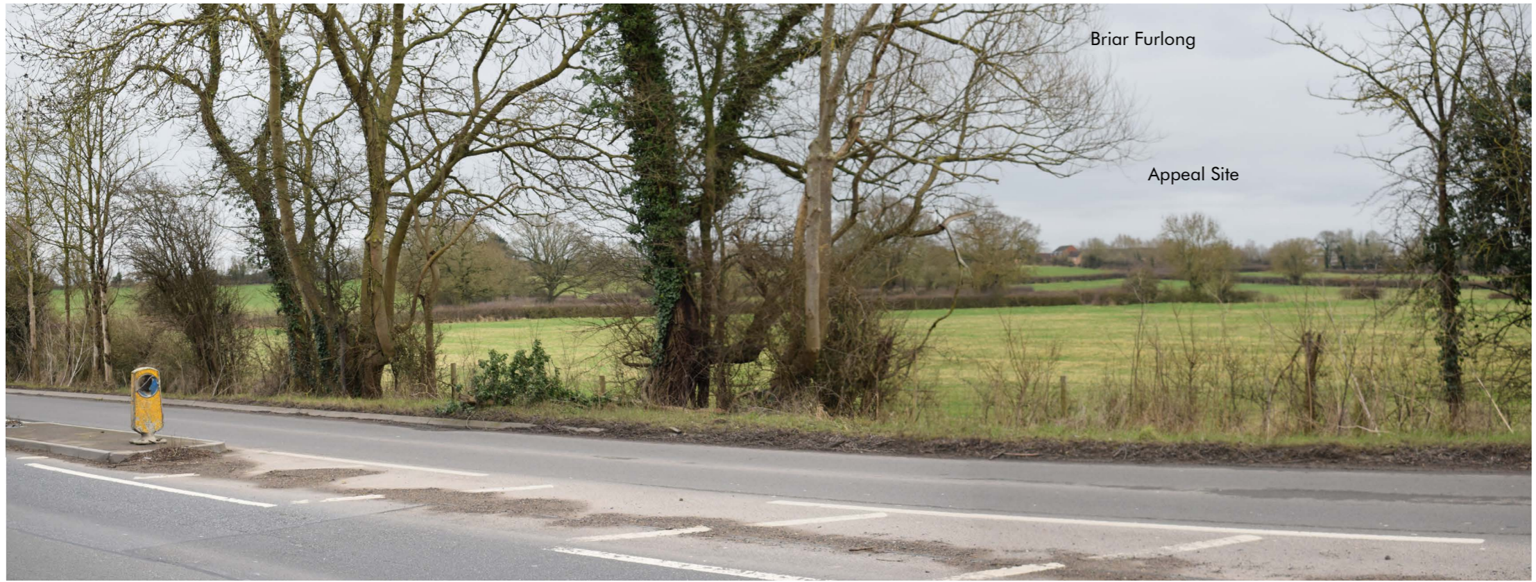
NB VP 7 Additional Filtered View looking south through vegetation gap on the A41 north of the appeal site.