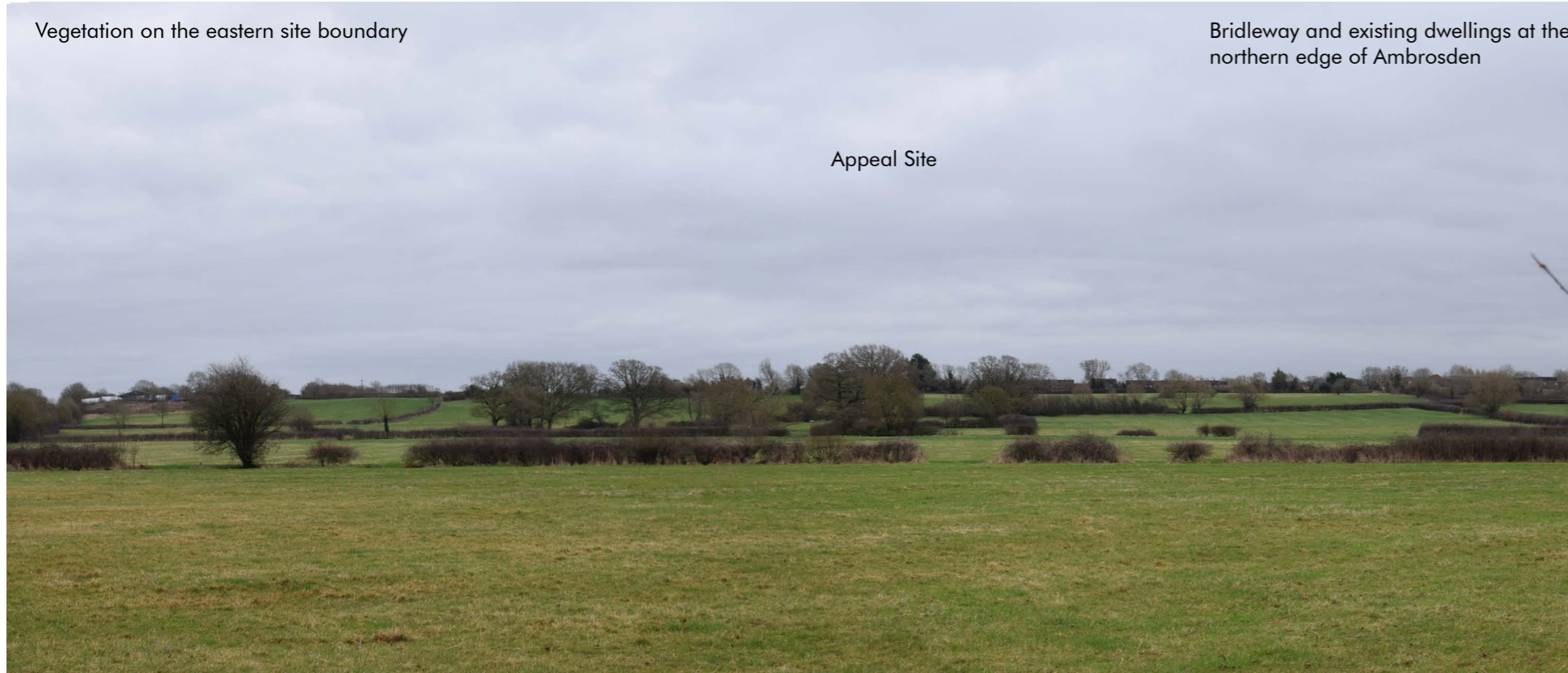
NB VP 5 Additional Sequential View looking southeast through gateway on Ploughley Road 385m north-west of the appeal site.