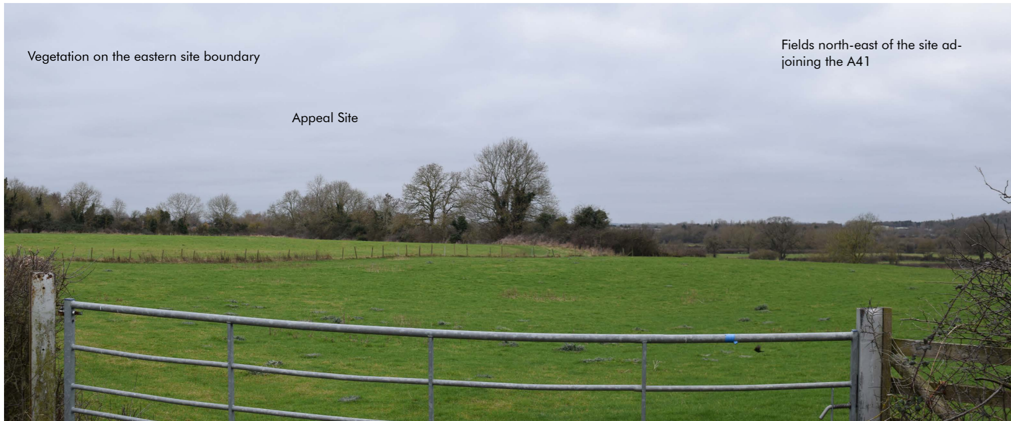
NB VP4 Additional Sequential View looking southwest from Bridleway 105/6/20 approximately 260m north-east of the appeal site.