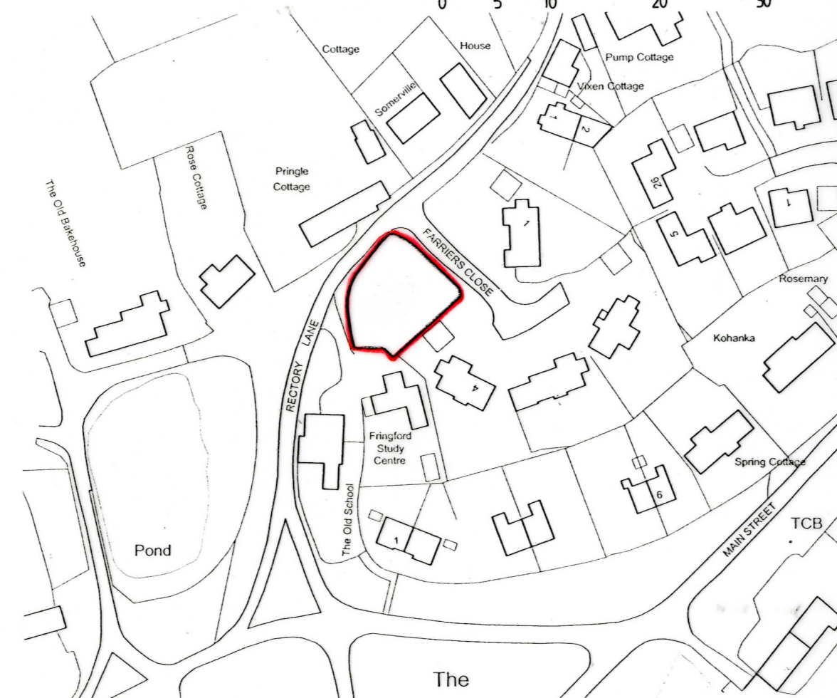
LOCATION PLAN 1:1250 Reproduced Ordnance Survey Promap 1:1250 with the permission of The Controller of Her Majesty's Stationary Office, Crown Copyright Licence No (100000120)