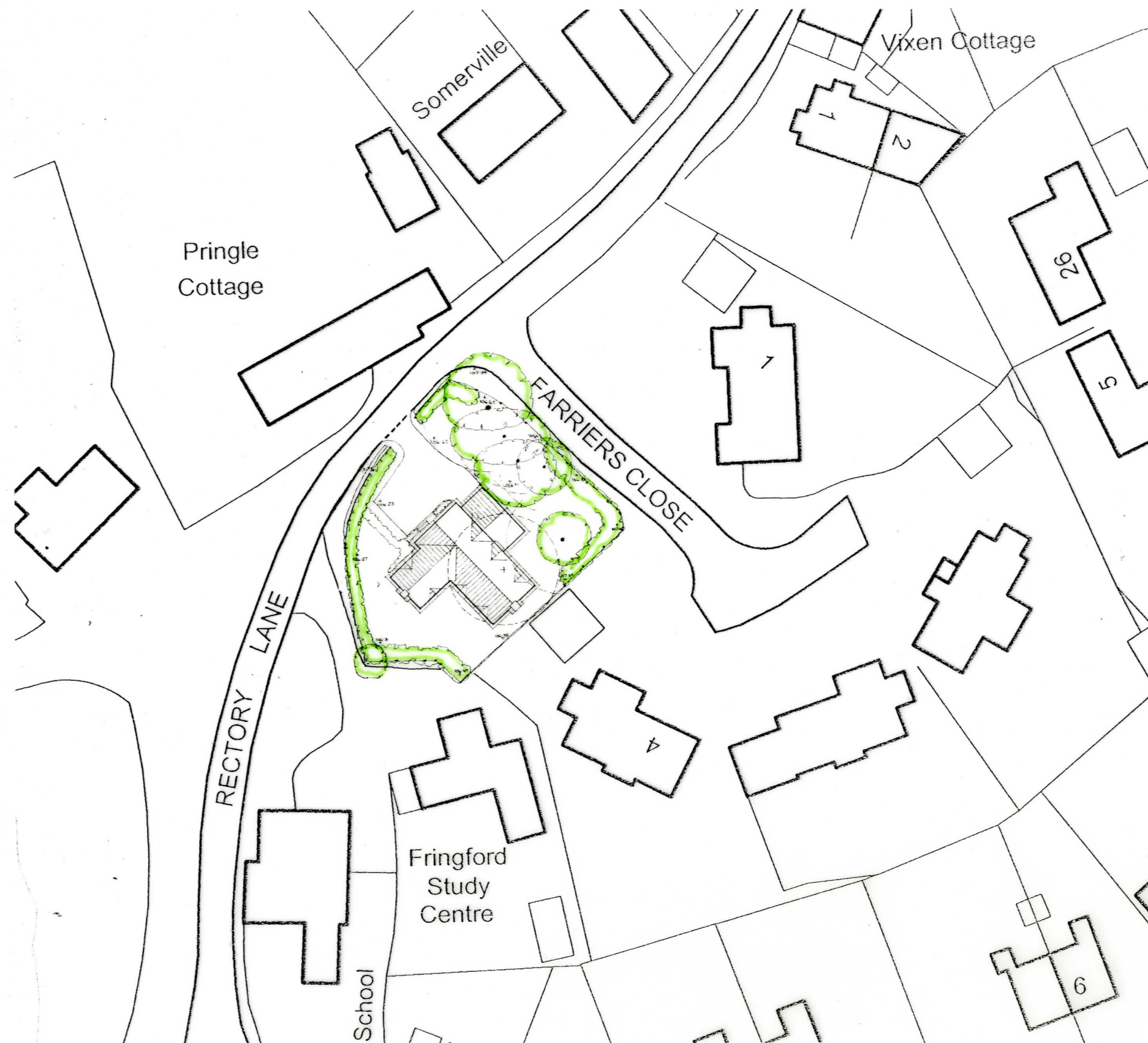
BLOCK PLAN 1:500