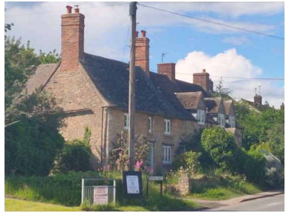
Turnpike Cottages photo'd from the proposed site of 5G mast

The refusal of this planning application by Cherwell District Council would seem to be entirely correct within planning legislation and so this appeal is surprising. The siting for the proposed 5G mast and the multiple structures around it lie within Kirtlington's Conservation Area, at a very obvious position on entering the old part of the village. This Conservation Area, based on standard format of English Heritage's document, Conservation Area Appraisals , was updated as recently as 2010. The site therefore, being within Kirtlington's Conservation Area, falls under The Planning (Listed Buildings and Conservation Area) Act 1990. 'Turnpike Cottages', which are opposite (to the North West) the proposed site, are even cited within that 2010 Appraisal document.