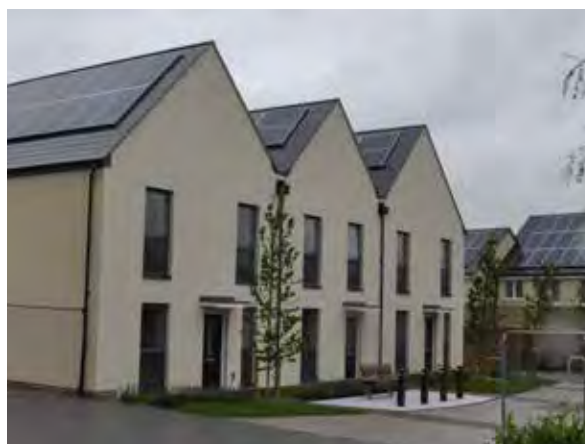
Bicester - Priory Road (top), Church Street (middle), Elmbrook, North West Bicester (bottom)