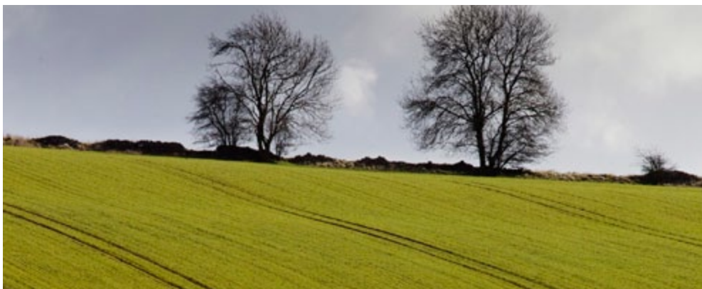
Farmland in late spring, Cutsdean, Gloucestershire.

http://magic.defra.gov.uk – select 'Landscape' (shows ALC and 27 types of soils).