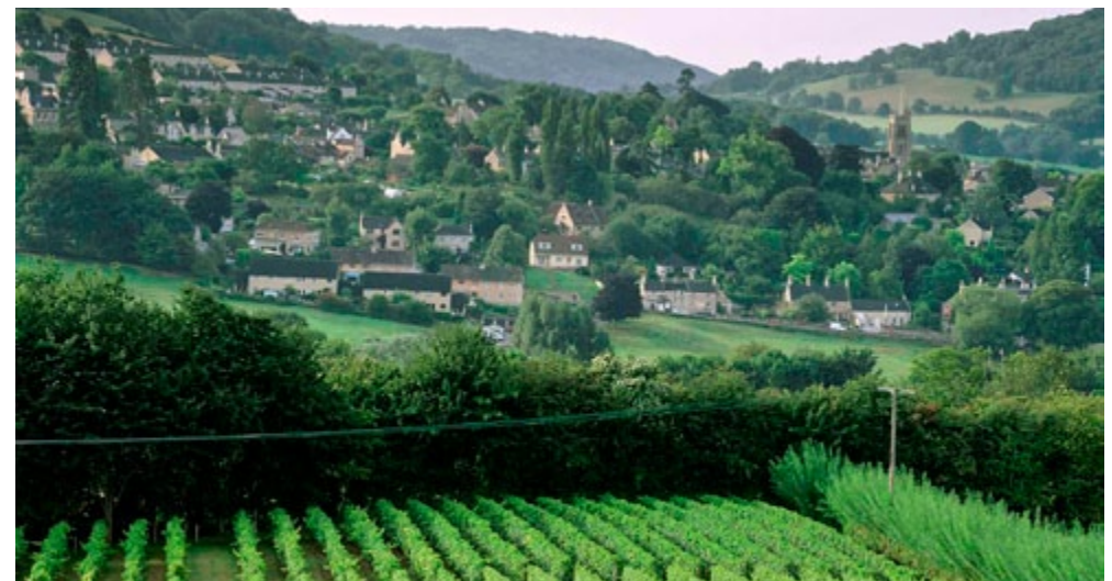
Mumfords Vineyard near Bath.

Further enclosure of farmland and downland for cropping and pasture followed, mostly on a piecemeal basis, in tandem with the creation of new farmsteads and the building of large barns but principally driven by Parliamentary enclosure in the late 18th century and early 19th century (concentrated in the central and eastern wolds). Thousands of miles of