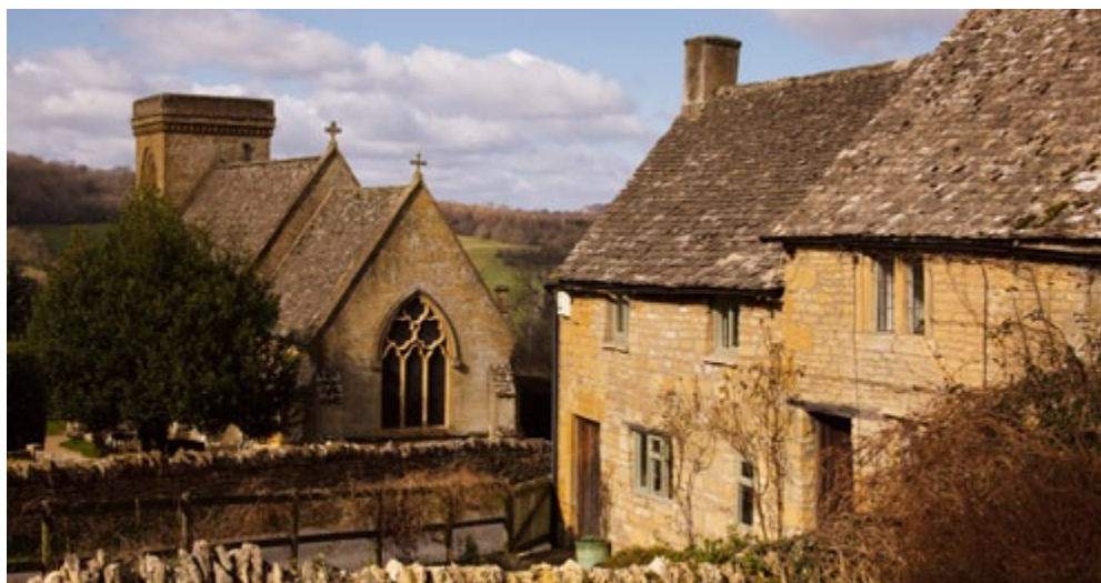
An example of the locally distinctive quarried stone used for domestic architecture at Snowhill, Gloucestershire.