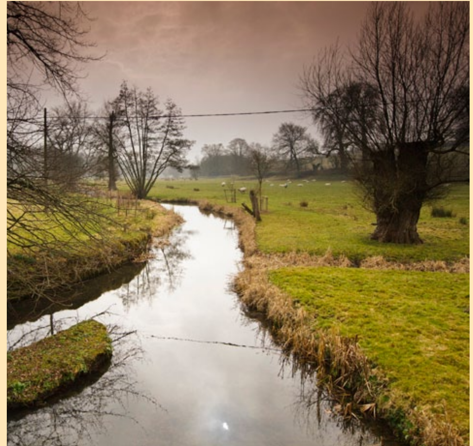
River Churn at Rendcomb, Gloucestershire.