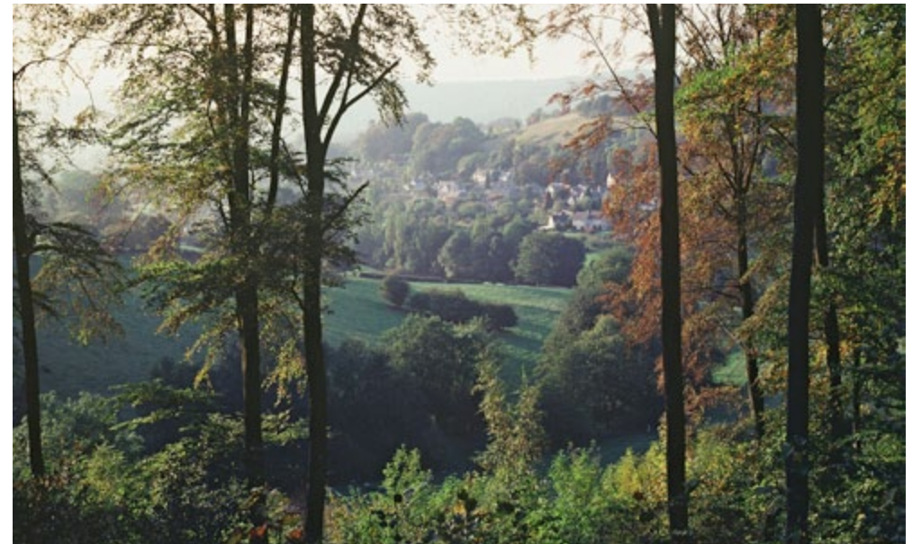
Workman's Wood, Cotswold Commons and Beechwoods NNR.