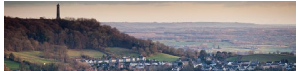
The Cotswold escarpment at Stinchombe, Gloucestershire.

The principal Cotswold towns and cities – Stroud, Cirencester and Bath – lie on the edge of the area. Bath is internationally known and designated as a WHS for its Roman and Georgian architecture. The scarp and dip slope landscape around Bath is less pronounced, breaking up into a series of hills and valleys often referred to as combes. The smaller market towns and villages tend to lie in the valley bottoms, occasionally along the valley sides and at the scarp foot on springlines. Stow-on-the-Wold is an exception as a hill top town. Settlement patterns vary from compact to dispersed and ribbon forms, with some lying round a central green. Away from these sheltered town and villages, which are usually never far from water, the higher ground is often sparsely populated, with only a few hamlets and isolated farmsteads. On the open, high wold and dip slope the oldest and most recent roads sweep across the landscape in almost straight lines; however, along the valleys the typical road is a winding lane linking villages. The combination of high-quality landscape, tranquillity and an excellent rights of way footpath network has made the Cotswolds a popular destination for quiet outdoor recreation.