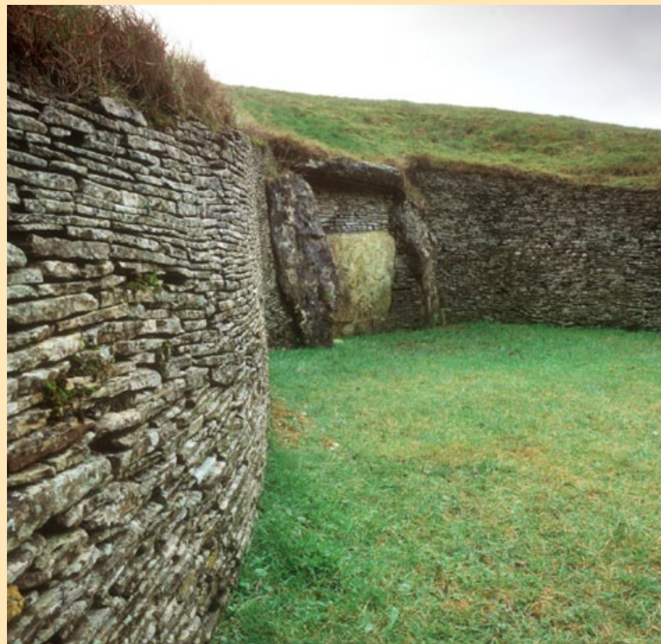
Belas Knapp, a particularly fine example of a Neolithic long barrow.