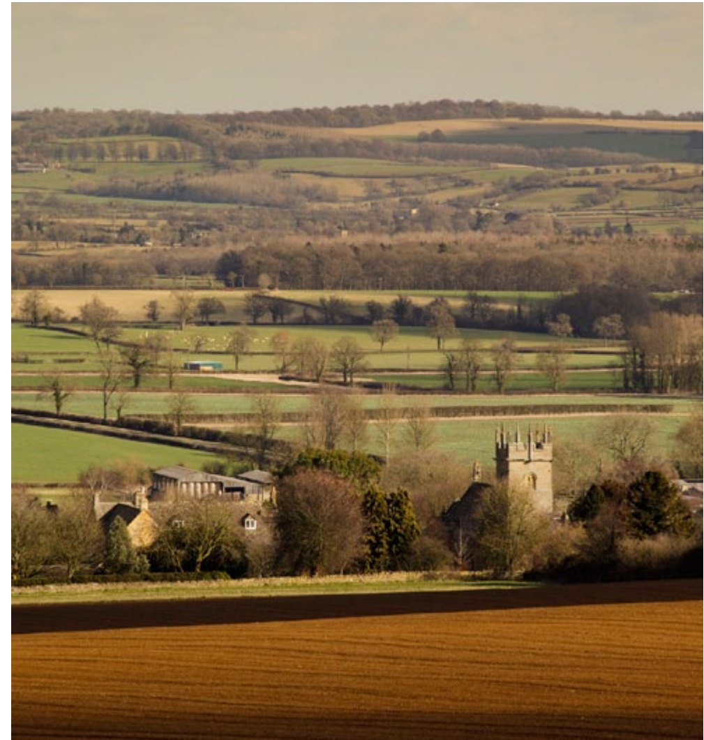
Cotswolds field pattern seen at Longborough.