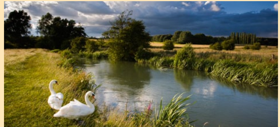
The River Windrush, which flows south-eastwards with the other principle rivers of the area to form the headwaters of the Thames.