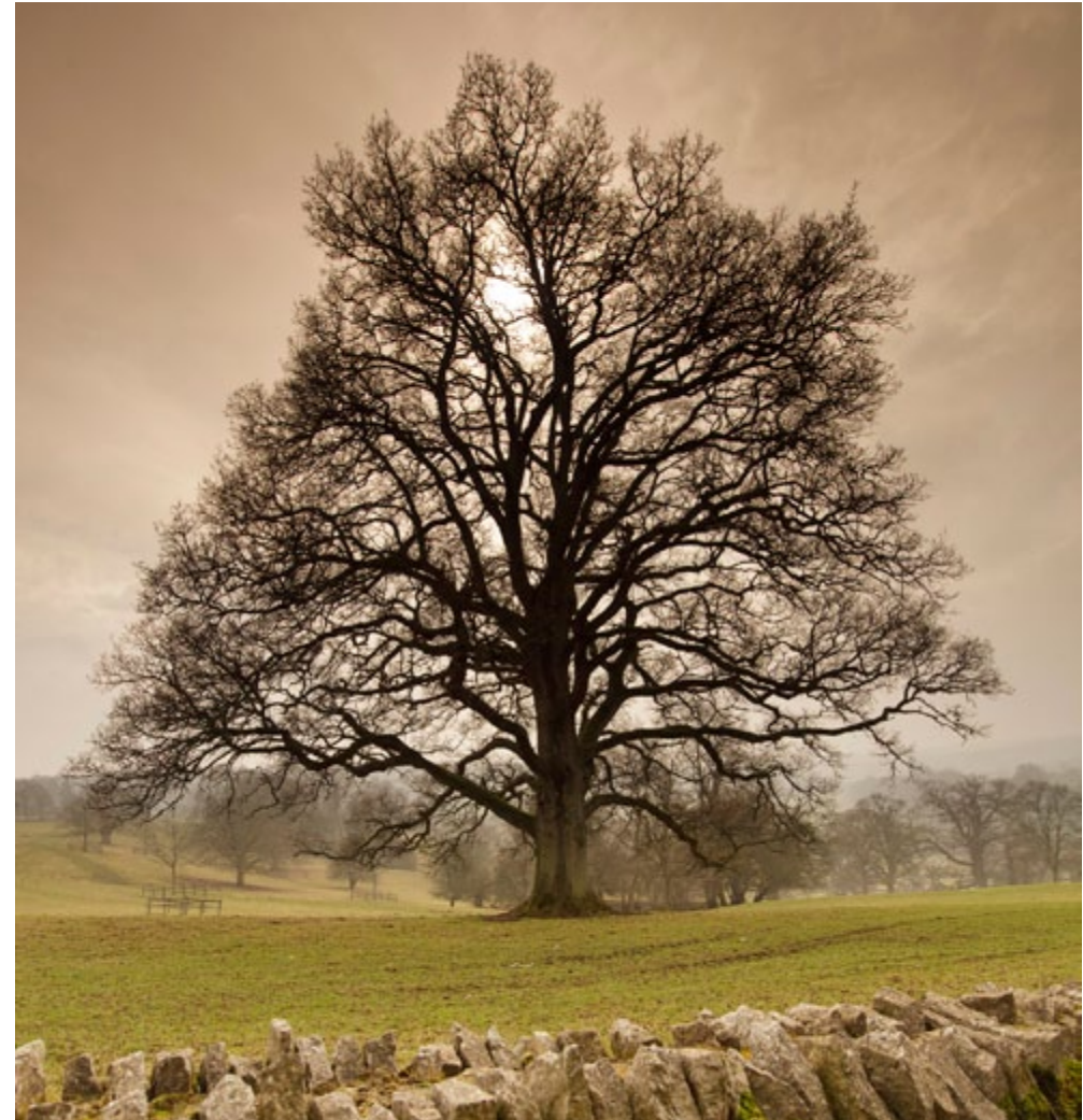
Farmland at Yanworth showing characteristic stone wall and field trees.