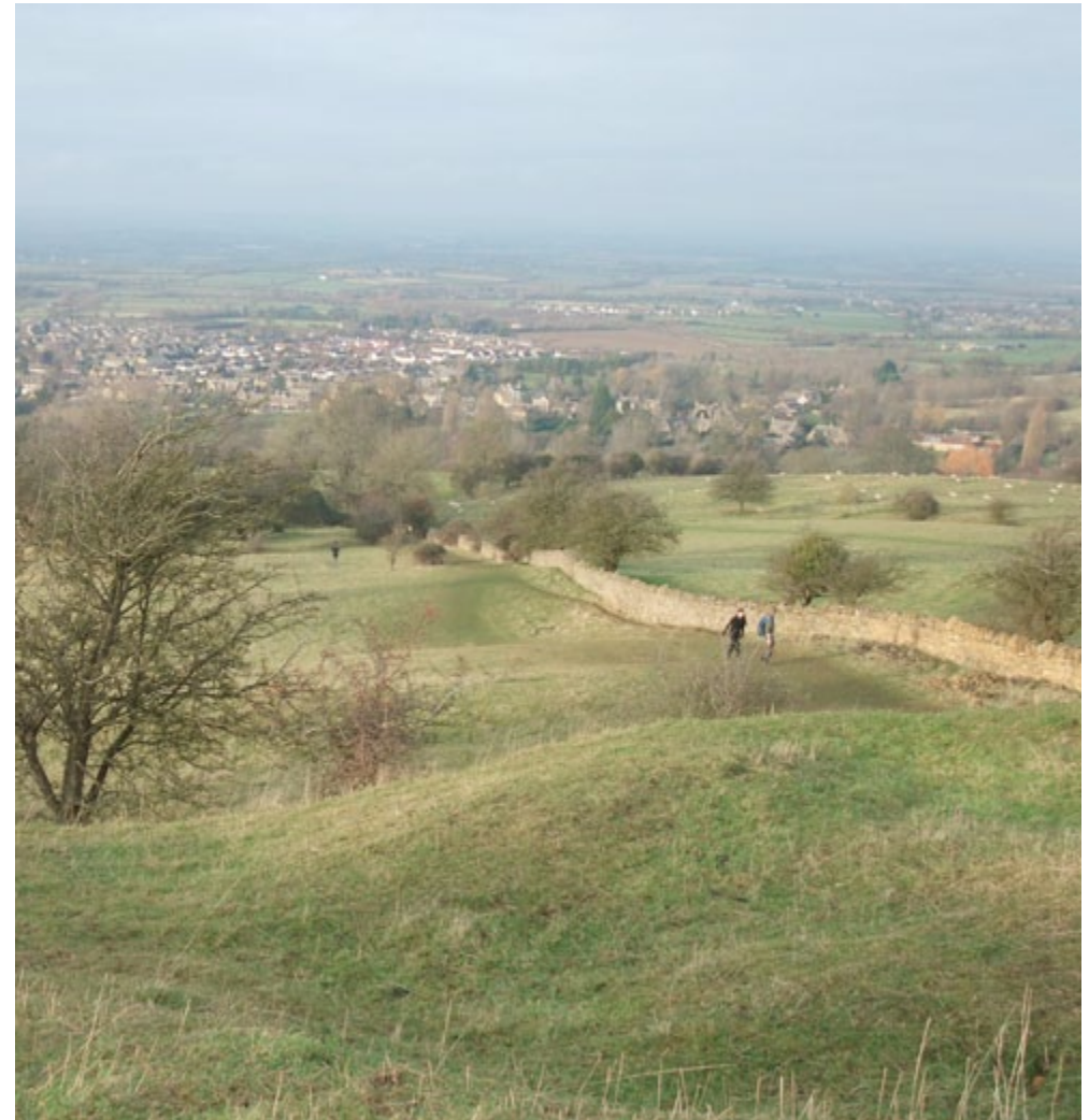
Walking the Cotswold Way from Broadway Tower with expansive views over the Severn and Avon Vales NCA.