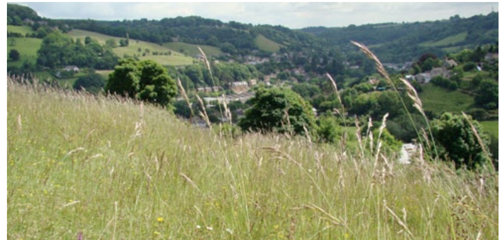
Limestone grassland at Swellshill.

The Cotswolds area is famed for its building stone, used extensively within the NCA but also much further afield, for example in Oxford and London.