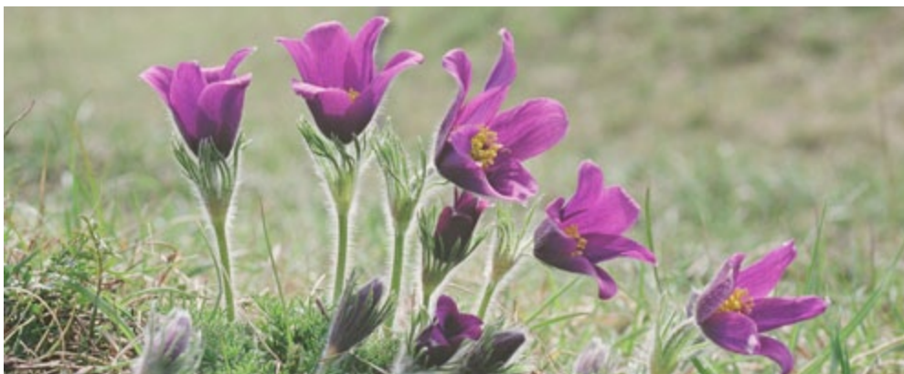
Pasque flower found as part of the limestone grassland flora.

The Government's new strategy for biodiversity in England, Biodiversity 2020, replaces the previous Biodiversity Action Plan (BAP) led approach. Priority habitats and species are identified in Biodiversity 2020, but references to BAP priority habitats and species, and previous national targets have been