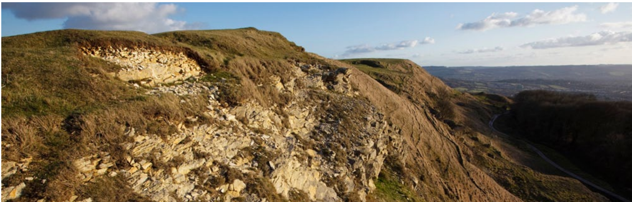
Cotswold escarpment at Cleeve Hill Common - the highest point on the scarp and showing the oolitic limestone geology.

Biodiversity and geodiversity are crucial in supporting the full range of ecosystem services provided by this landscape. Wildlife and geologically-rich landscapes are also of cultural value and are included in this section of the analysis. This analysis shows the projected impact of Statements of Environmental Opportunity on the value of nominated ecosystem services within this landscape.