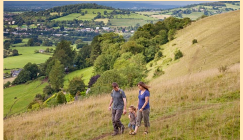
Walkers enjoying the network of footpaths.