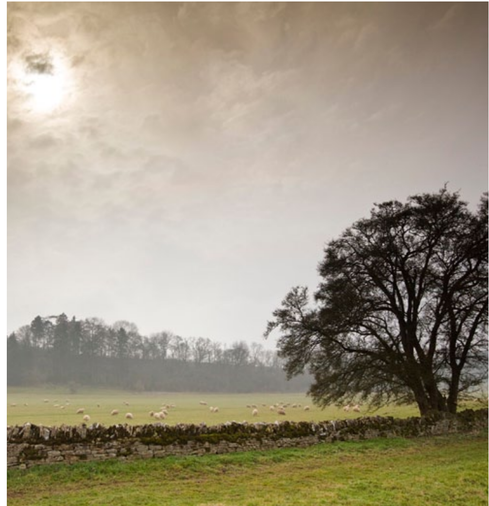
Early spring farmland at Yanworth, showing traditional stone walls and sheep grazing that is characteristic of the Cotswolds.