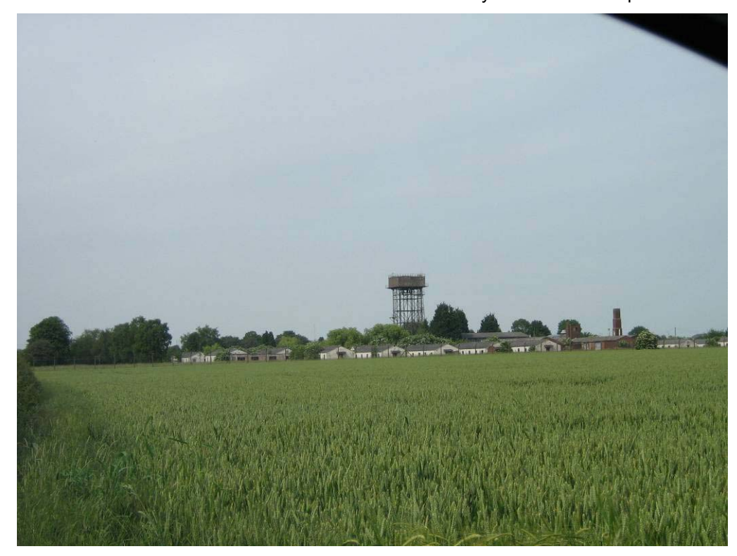
View of Camp Road running through development area (east).