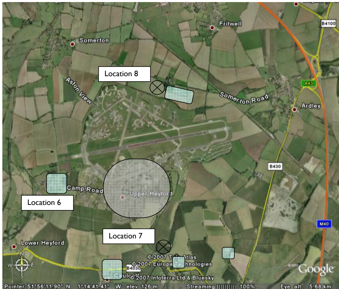
Figure N2 Site plan showing external measurement locations used for setting noise emissions. Blue areas indicate identified residences.