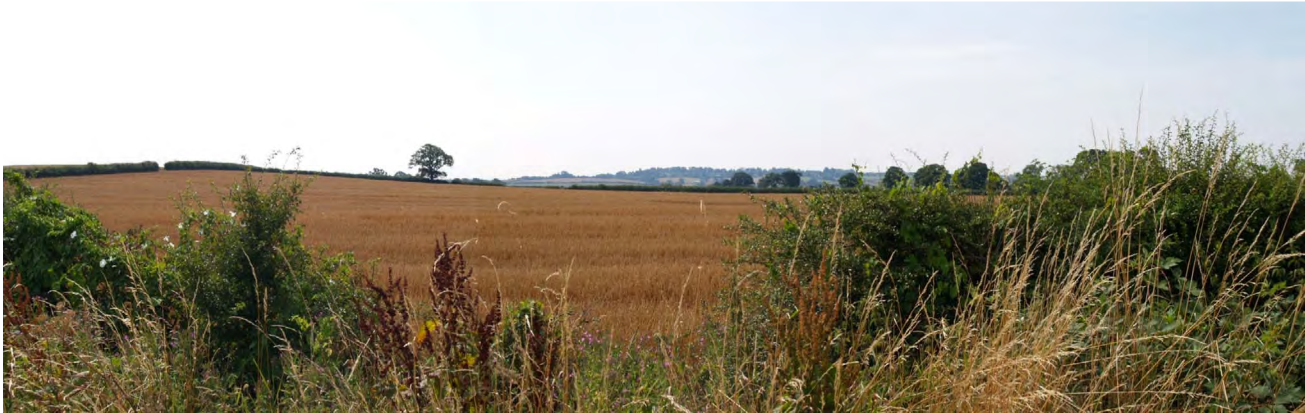
Viewpoint 3: From north-northwest on lane between Deddington and Clifton Villages, looking south-southeast towards site (see inset on Plan L2)