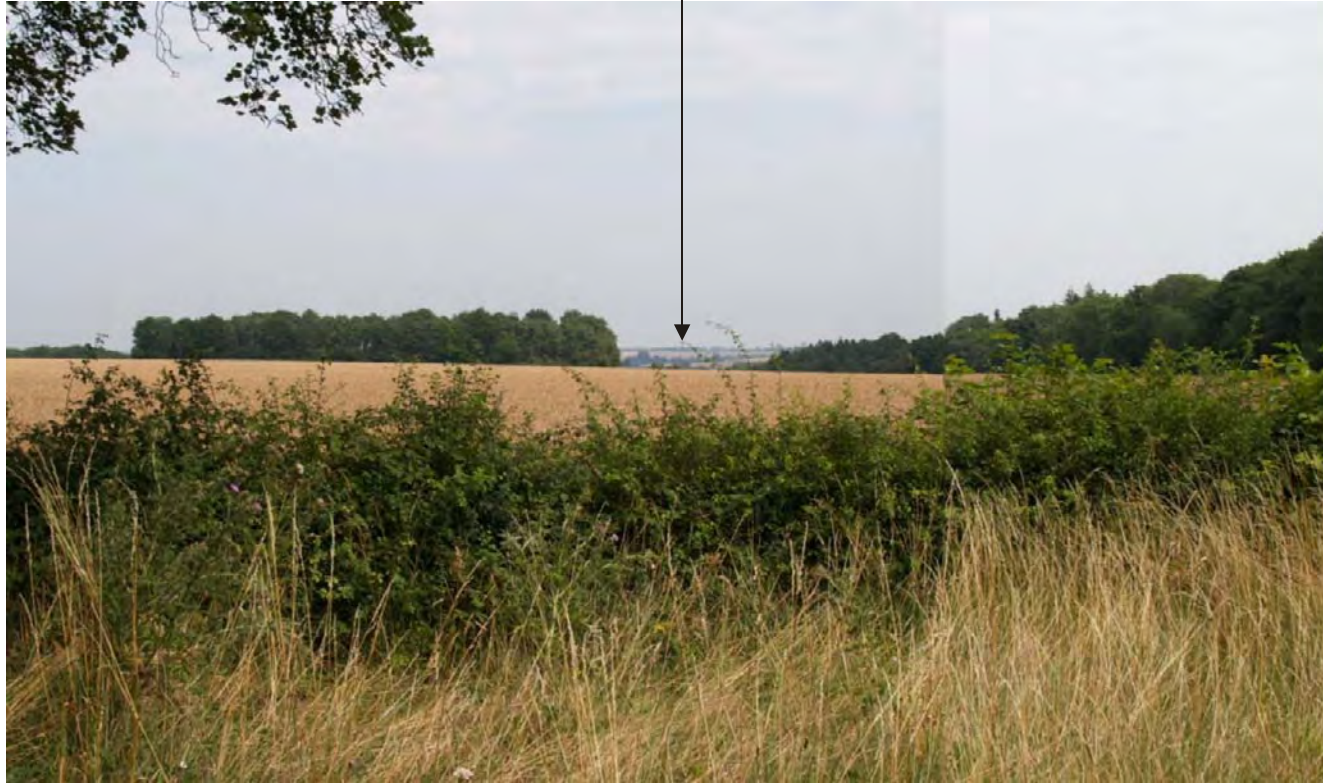
Viewpoint 8: From A4260 from Rousham looking northeast towards site (see inset on Plan L2)