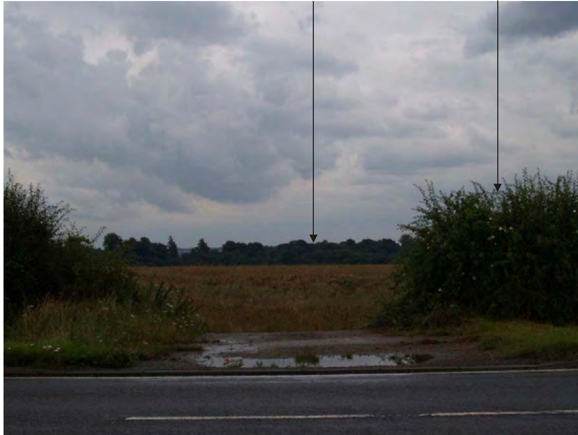
Viewpoint 7: A4260 Opposite Brazenose Farm looking north