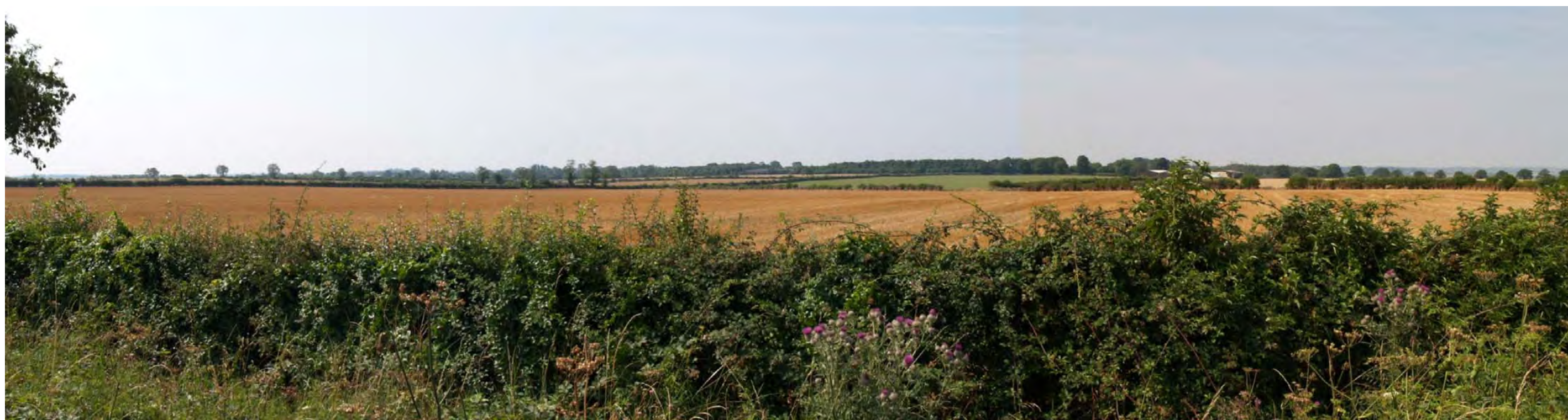
Viewpoint 2: From north-northeast on B4100, looking south-southwest towards site (see inset on plan 2)