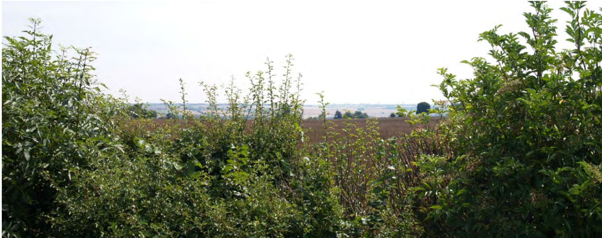
Viewpoint 5: From the A426 north of the Middle Ashton junction