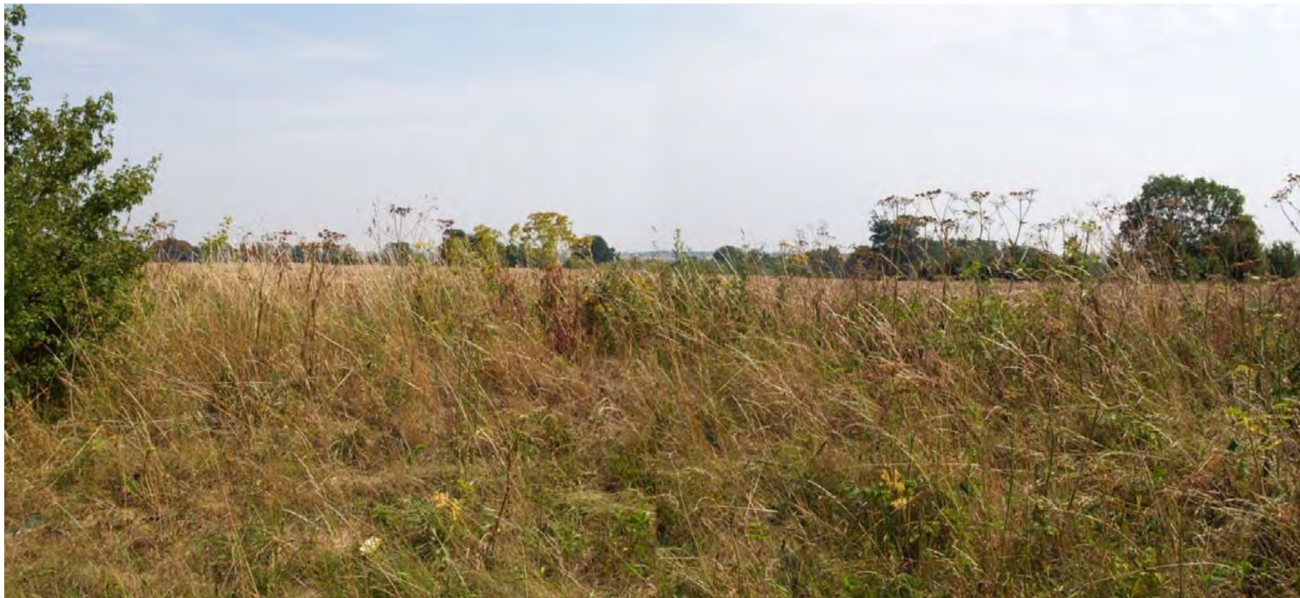
Viewpoint 6: From Middle Ashton junction