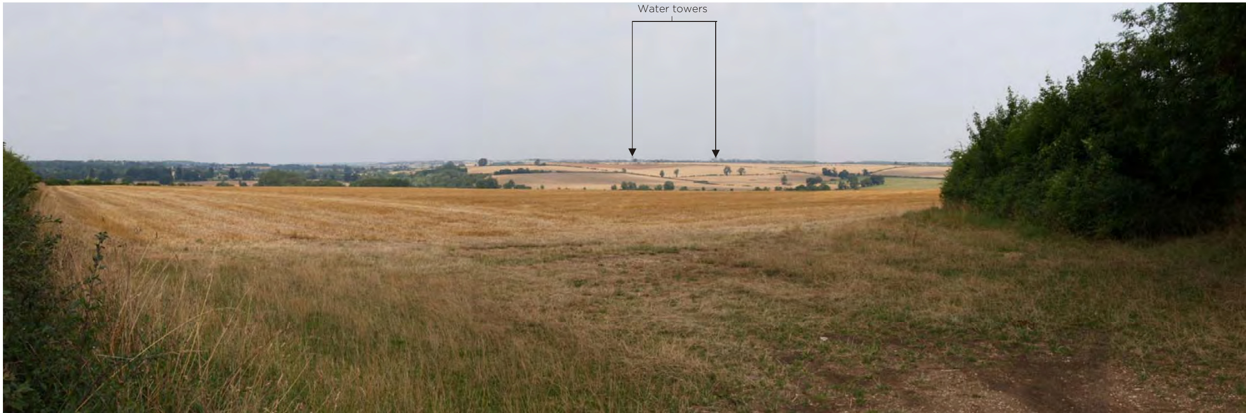
Viewpoint 9: From A4260 turning towards Tackley Village, water towers visible on skyline (see inset on Plan L2)