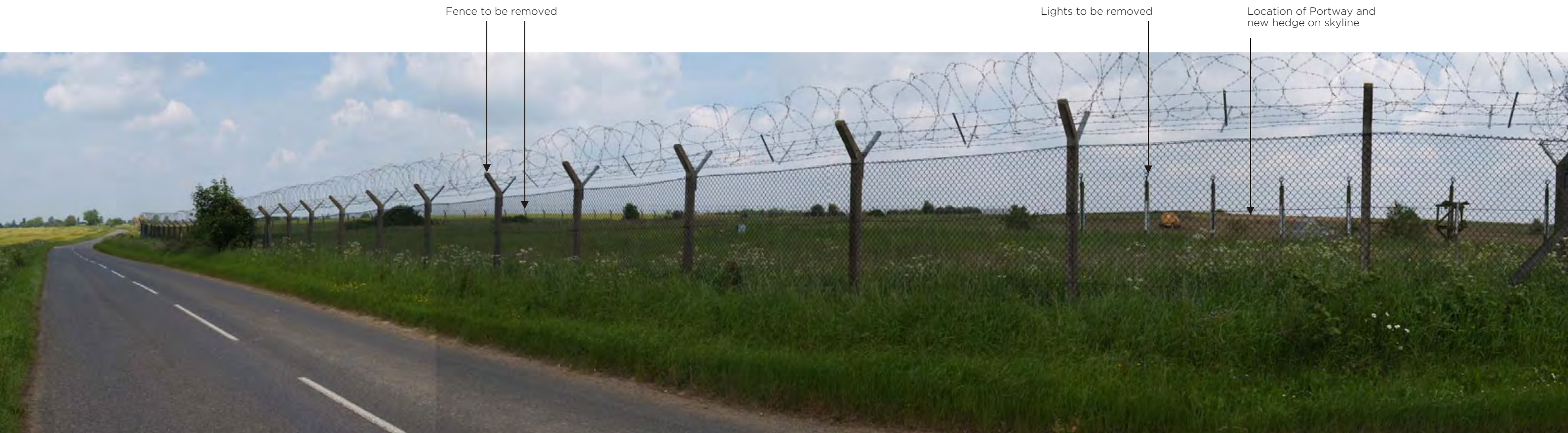
Viewpoint 1: From north edge of Upper Heyford Village, on road to Somerton, looking towards the west nib