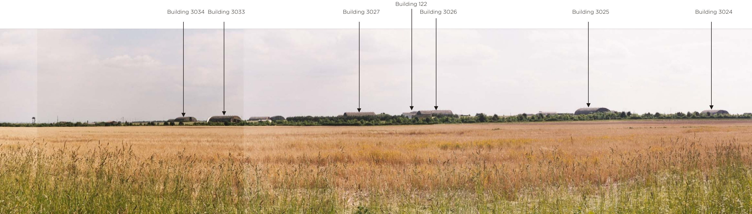
Viewpoint 26: From public footpath south of Troy Farm