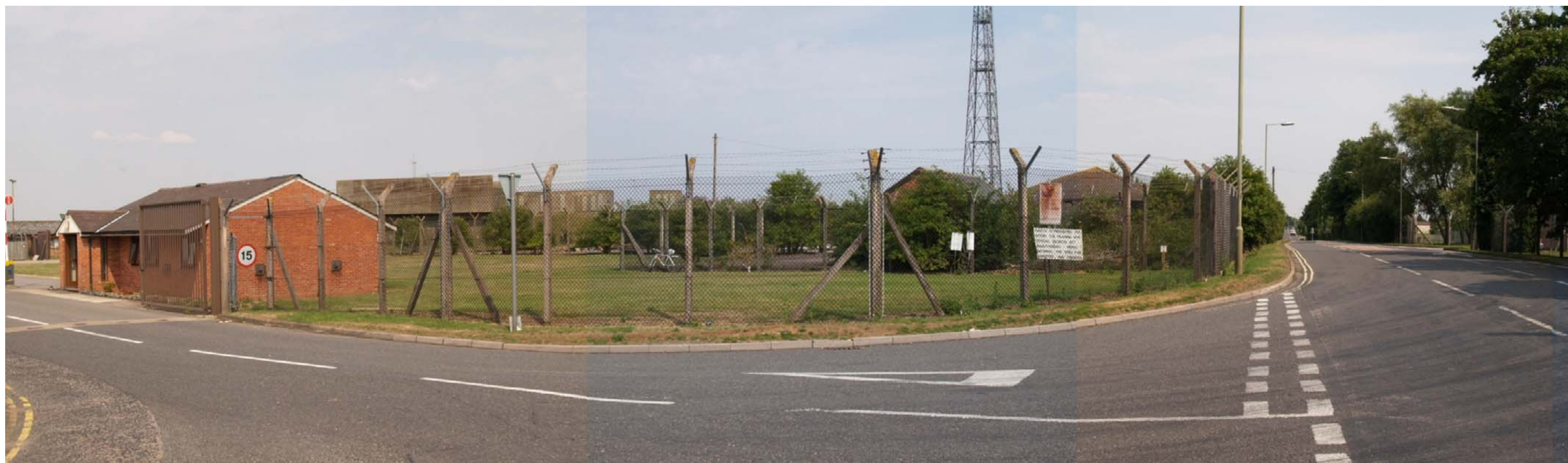
Viewpoint 30: From Camp Road on the west edge of the airbase, looking east towards the 8B Avionics and HAS character area.