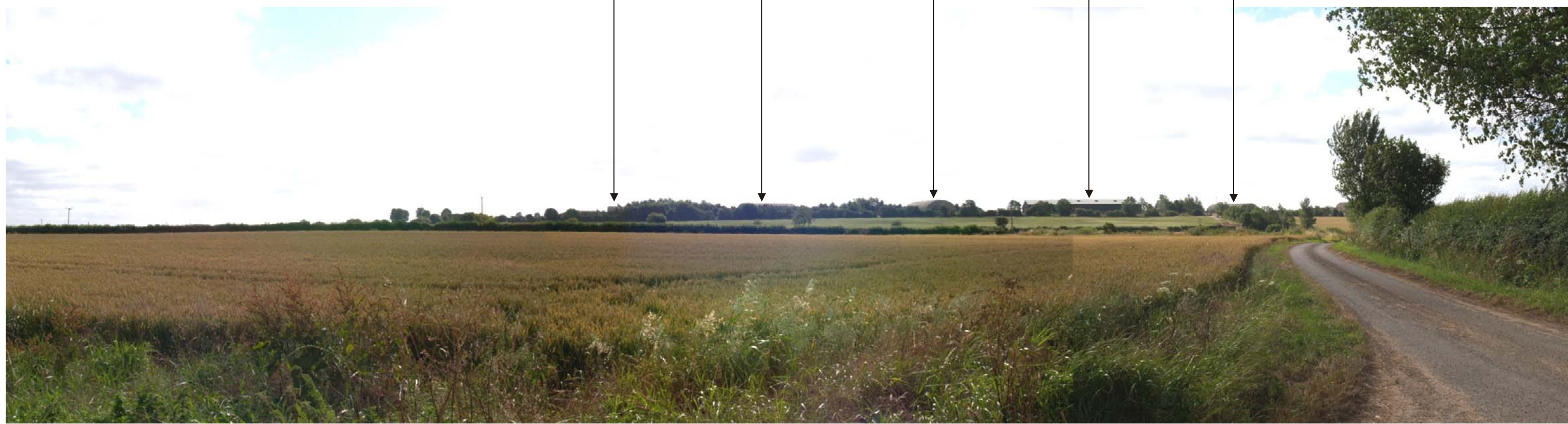
Viewpoint 29: From Mudginwell Farm track looking towards the Northwest Fringe HASs, to be removed to provide visual benefit

Building 3054 Building 3053 Building 3052 Building 3135 Building 3014