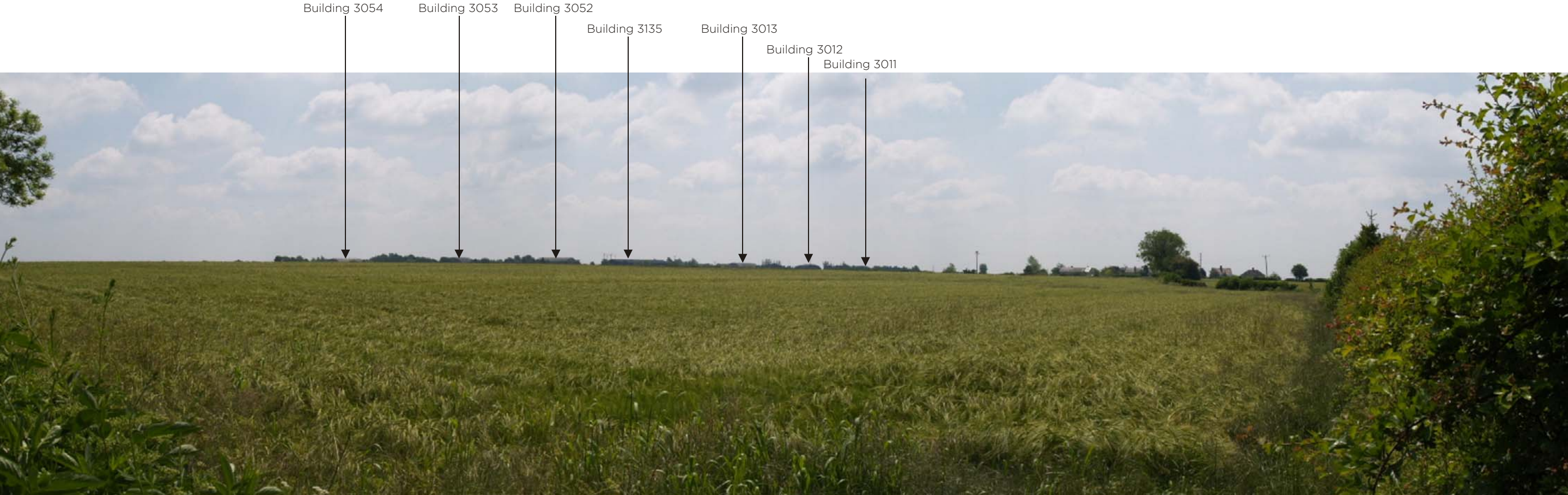
Viewpoint 27: From east edge of Somerton to Ardley Road, looking southeast towards site