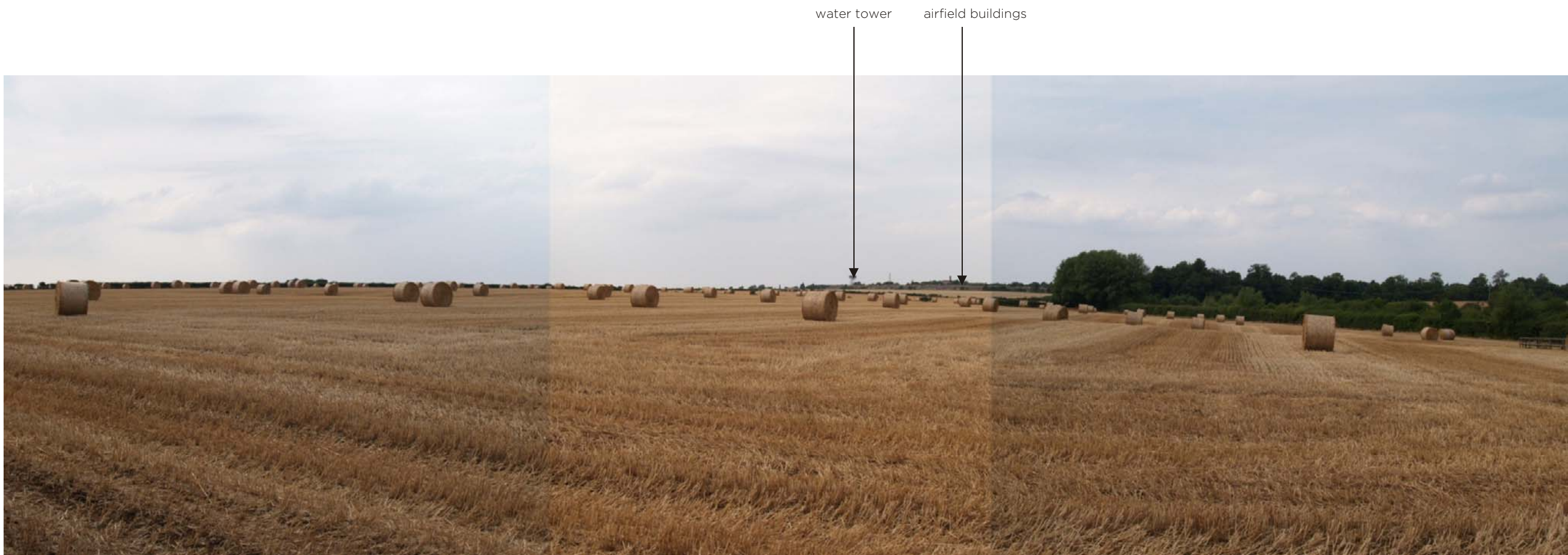
Viewpoint 33: From B4030 0.6km to the east of Caulcott, looking north-northwest towards site