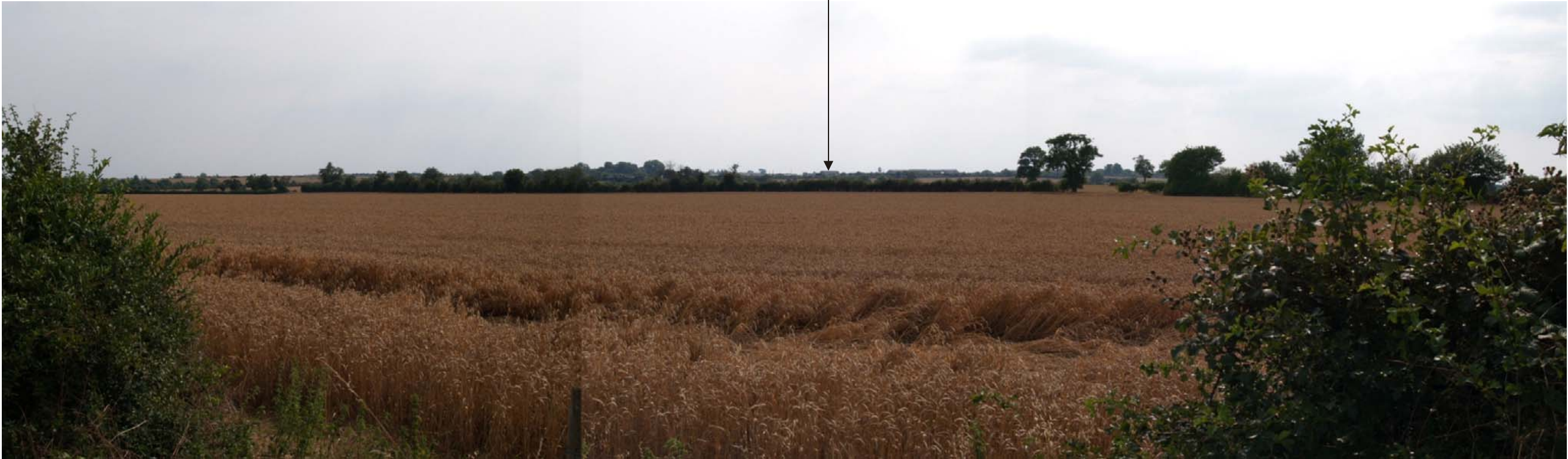
Viewpoint 23: From road midway between Fritwell and Ardley villages, looking south-southwest towards site