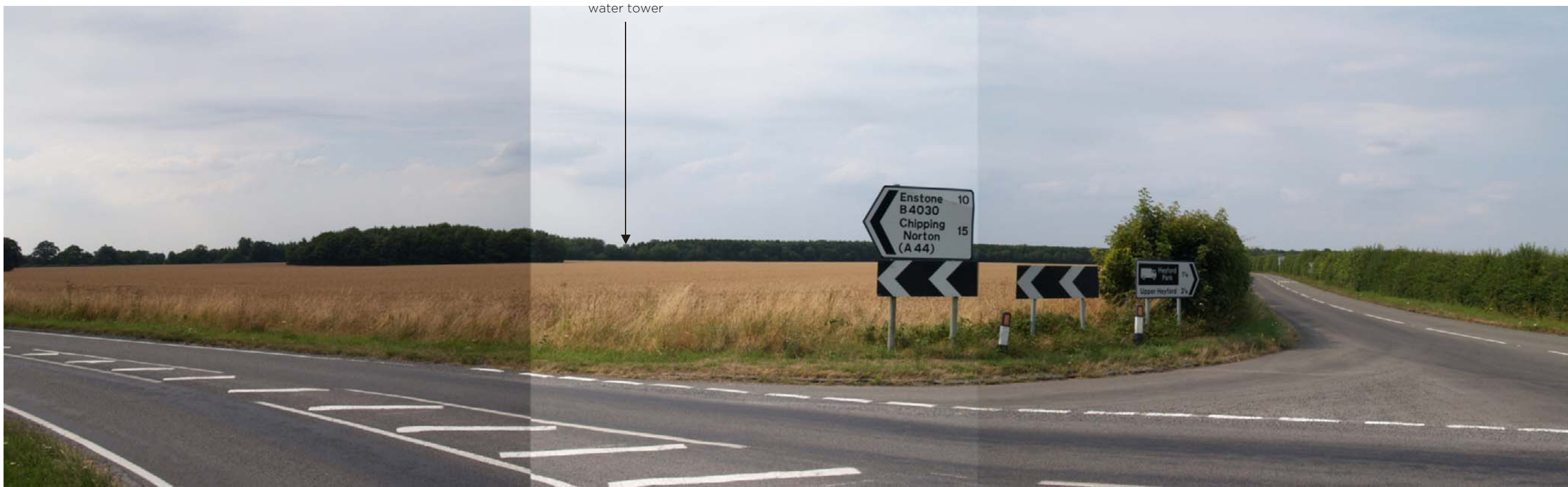
Viewpoint 34: From B4030 between Caulcott and Middleton Stoney, at junction with unclassified road leading northwest to Upper Heyford