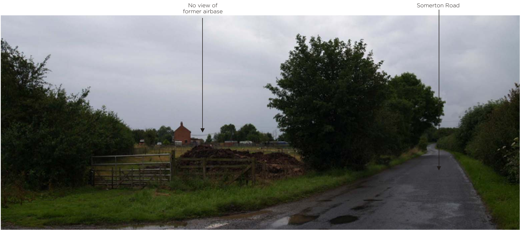
Viewpoint 25: Somerton Road 200m to south-west of Ardley, adjacent to link over rail line