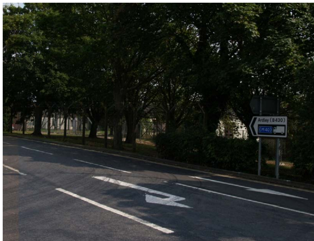
Viewpoint 31: From Camp Road on the west edge of the airbase, looking east towards site continued