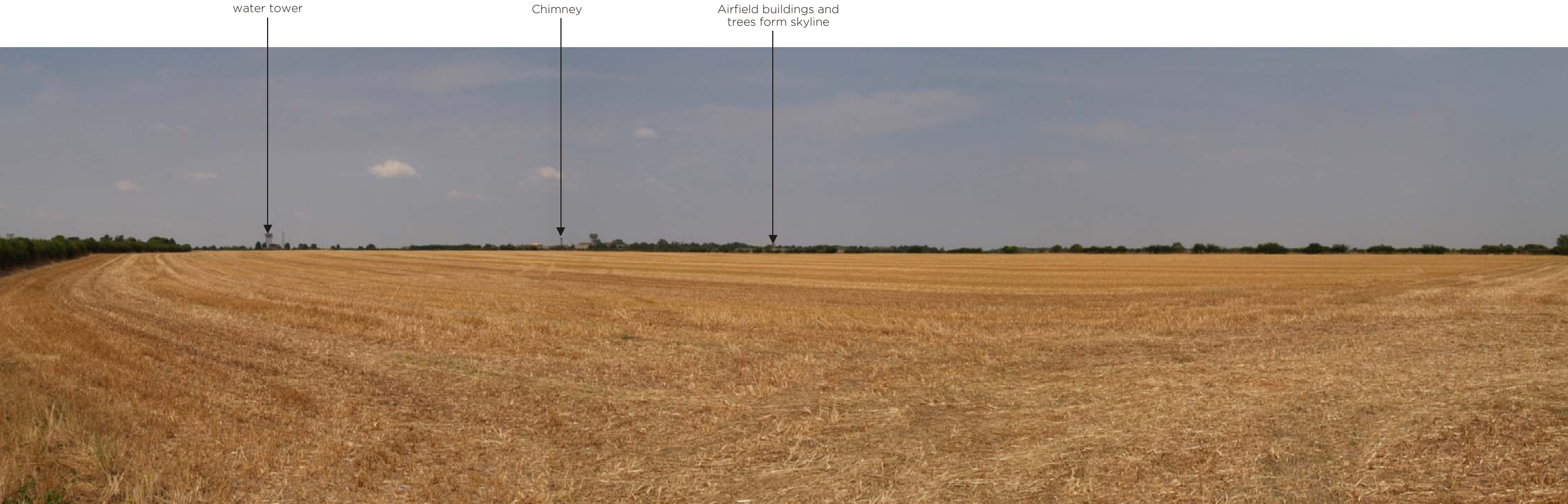
Viewpoint 31: From B4030 at junction with the unclassified Port Way, looking north-northeast towards site