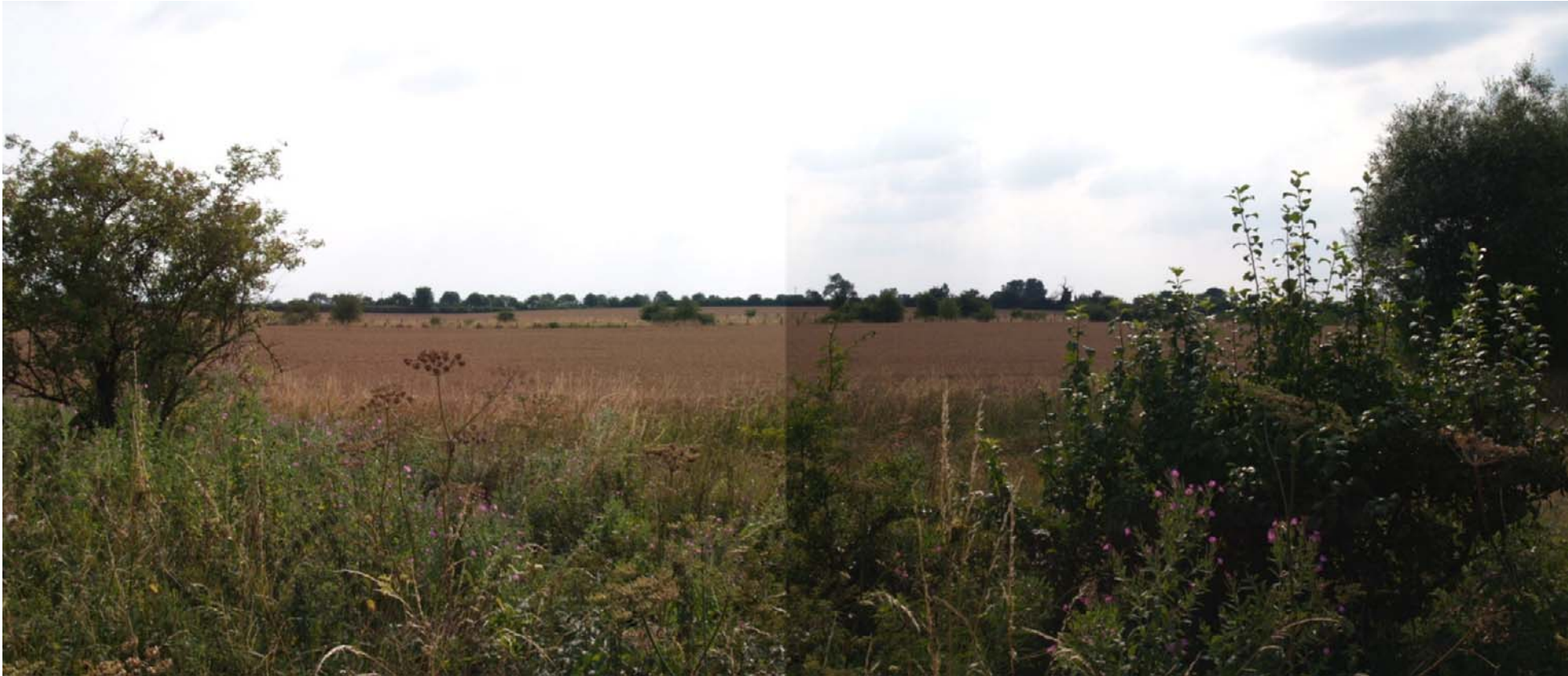
Viewpoint 24 : From road to Fritwell 0.6km south of the village, looking south-southwest towards site