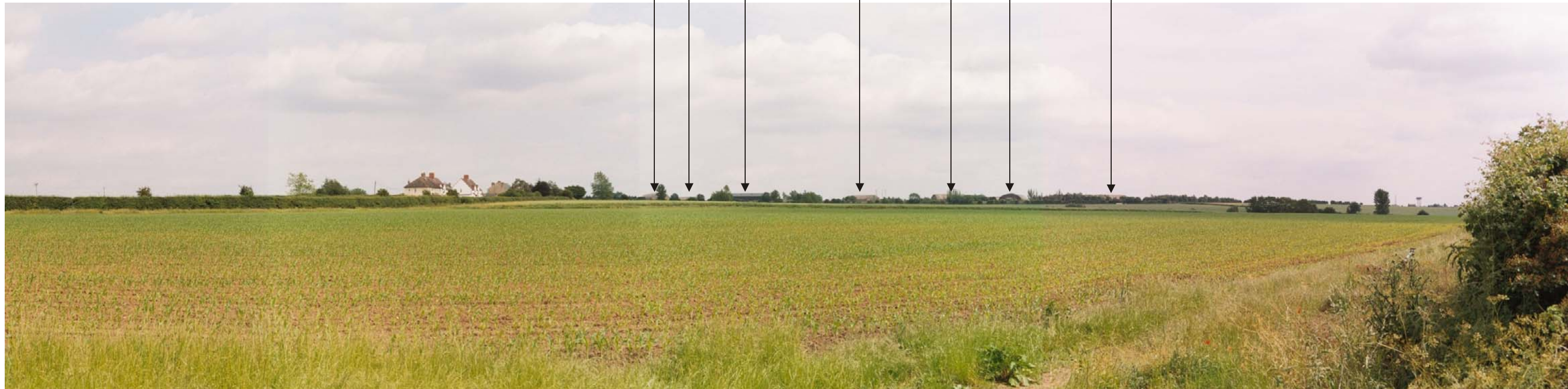
Viewpoint 28: From Somerton to Upper Heyford road approx 0.5km south of Somerton, looking east-southwest towards site

Building 3052 Building 3022 Building 3135 Building 3014 Building 3013 Building 3012 Building 3011