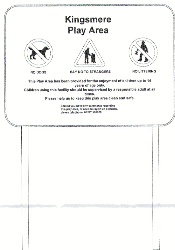
5 - SIGN