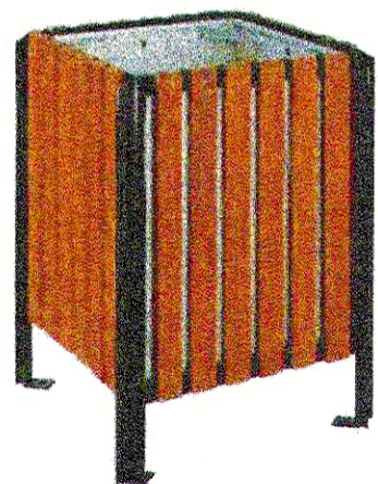
7 - IROKA WOOLBROOK LITTER BIN