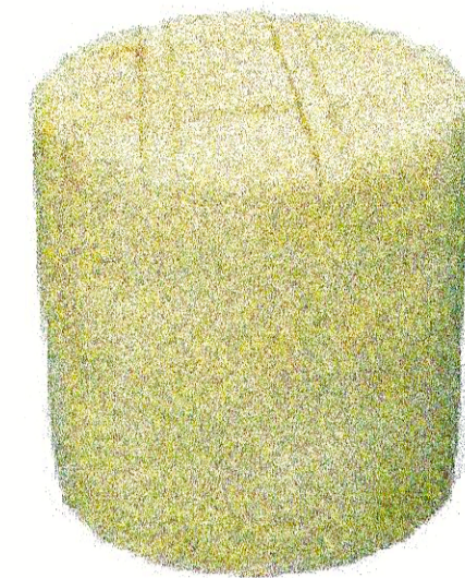
4 - PLAYDALE LOG WALK (PRODUCT CODE AT)