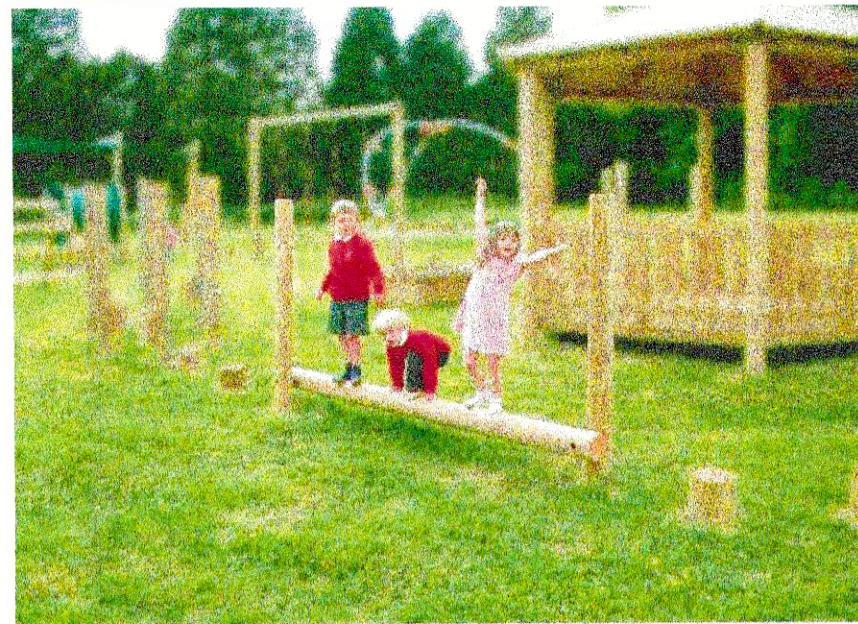
3 - PLAYDALE LOG BEAM (PRODUCT CODE LBM)