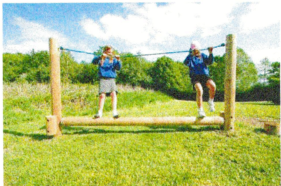
1 - PLAYDALE ROLL 'N' ROPE (PRODUCT CODE RRP)

Z:\Ningsmere 2226\038 CAD\2226_DB_034_LAP_190718.dwg