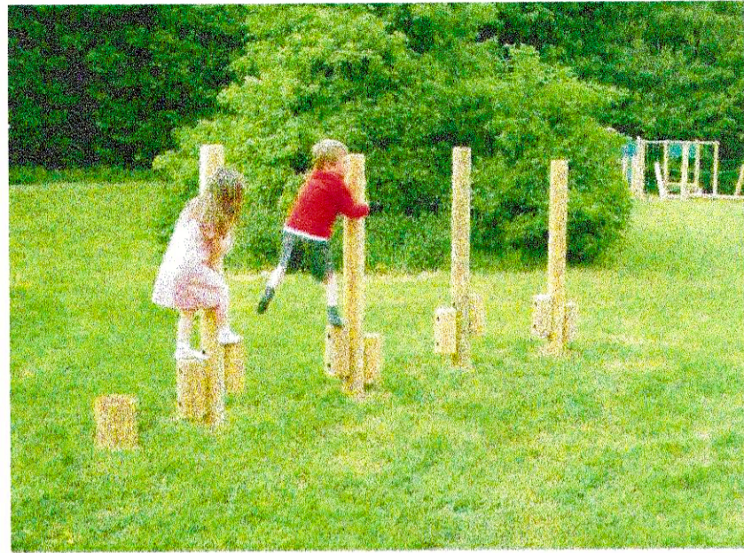
2 - PLAYDALE STRIDING STILTS (PRODUCT CODE STR/4)