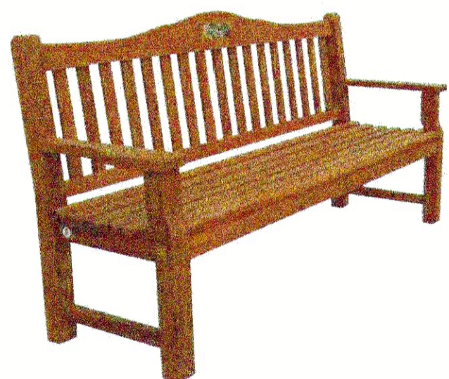
6 - IROKA TRADITIONAL ARCHED BENCH WITH FLAT ARMS