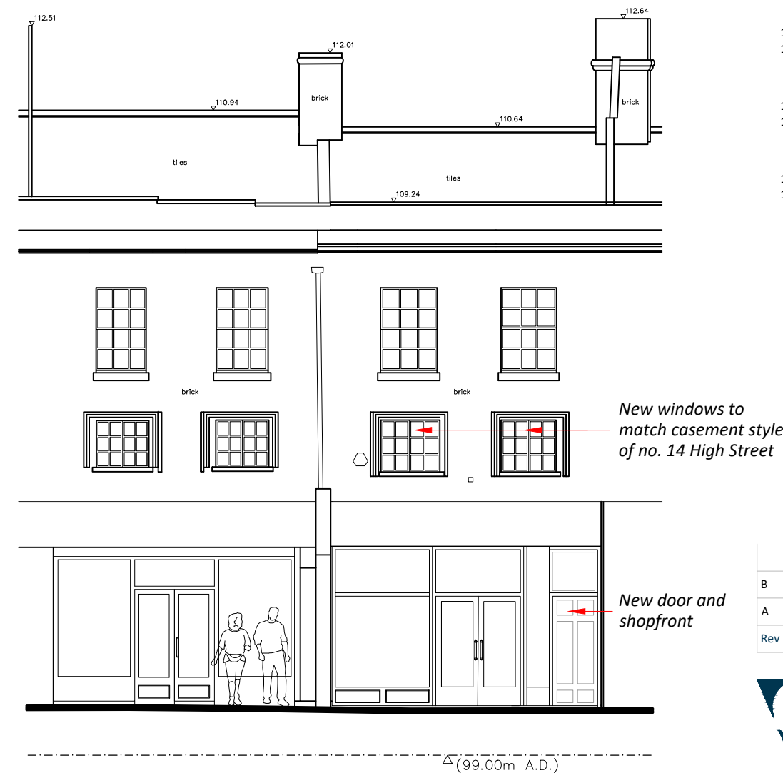
02 SOUTH-EAST ELEVATION 1:100