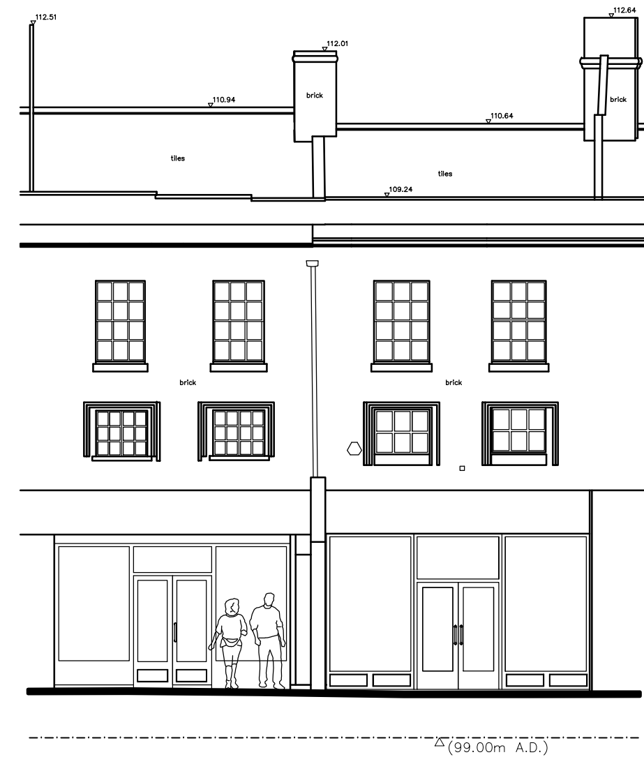
02 SOUTH-EAST ELEVATION 1:100