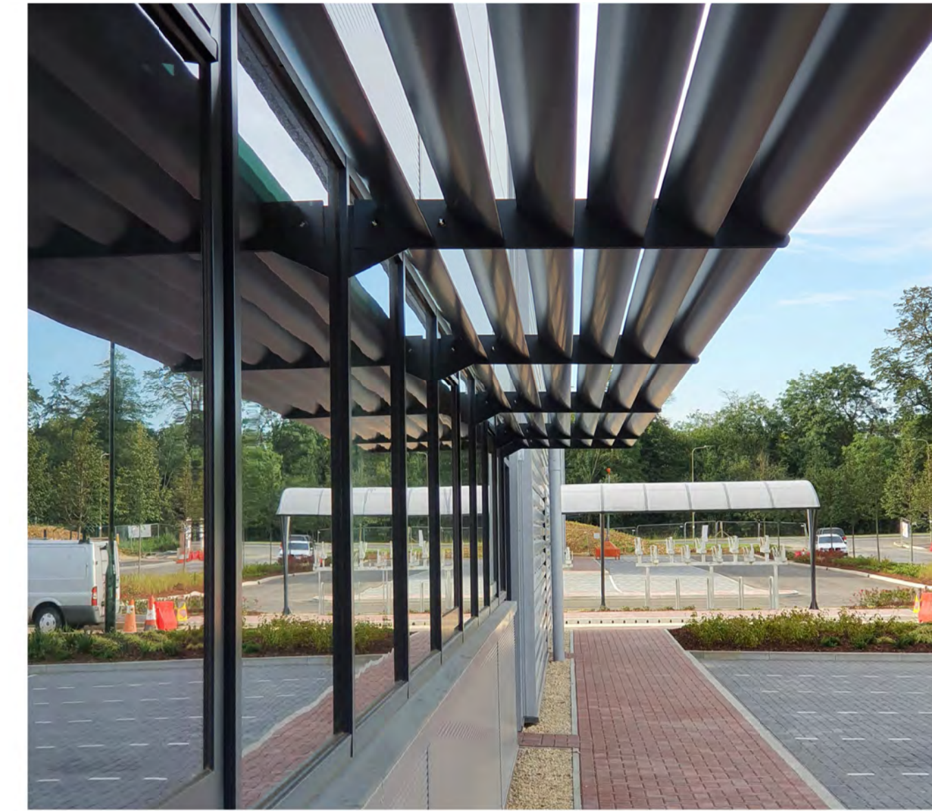
11 BRISE SOLIEL 020 RAL7016