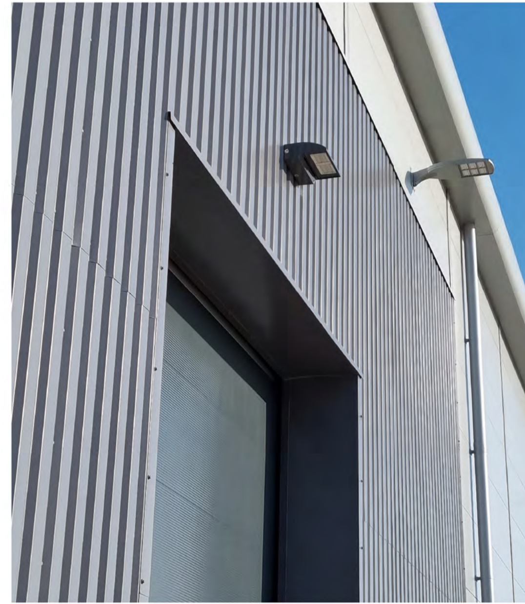
09 VERTICAL METAL CLADDING 020 ZEUS