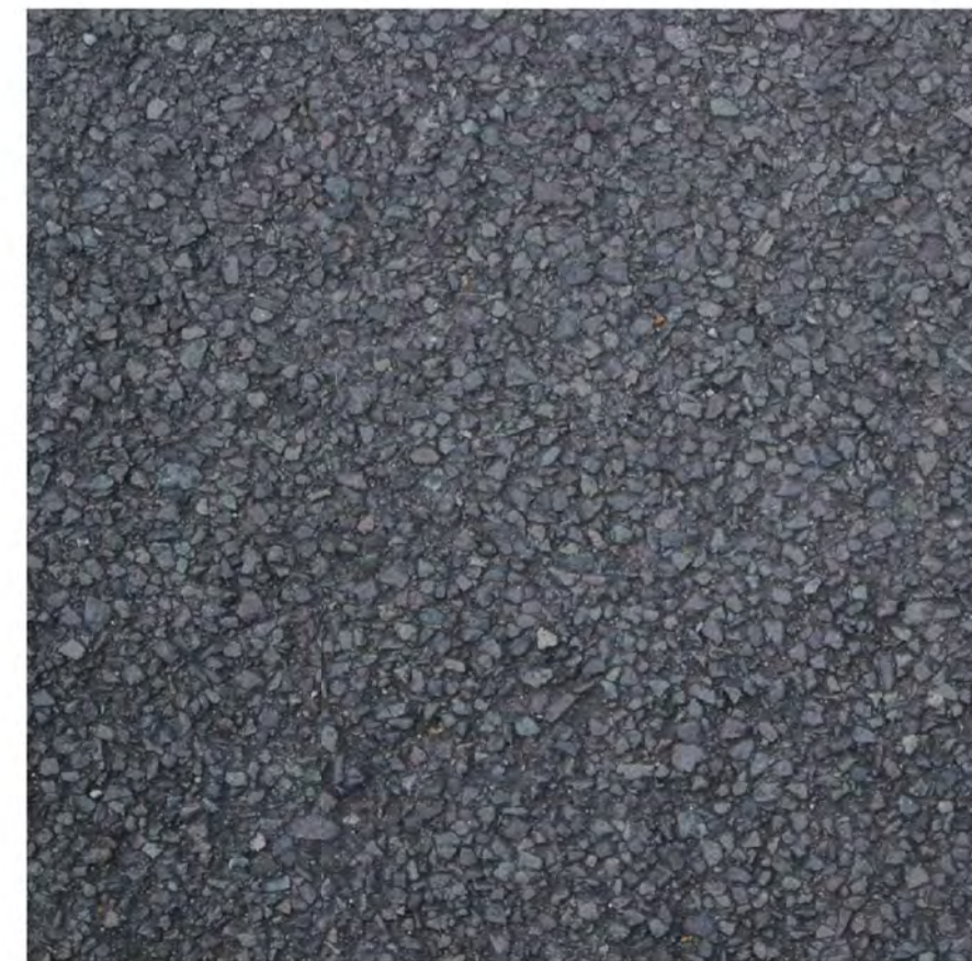
07 TARMAC CIRCULATION 020