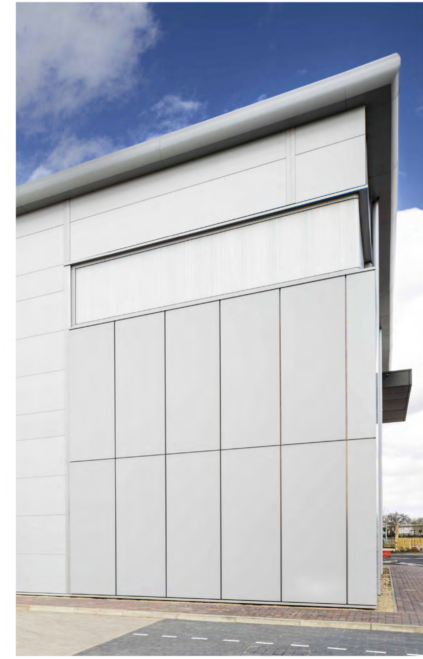
12 RAINSCREEN (This is a 'flat' version of the proposal) 020 SIRIUS Ral 9006