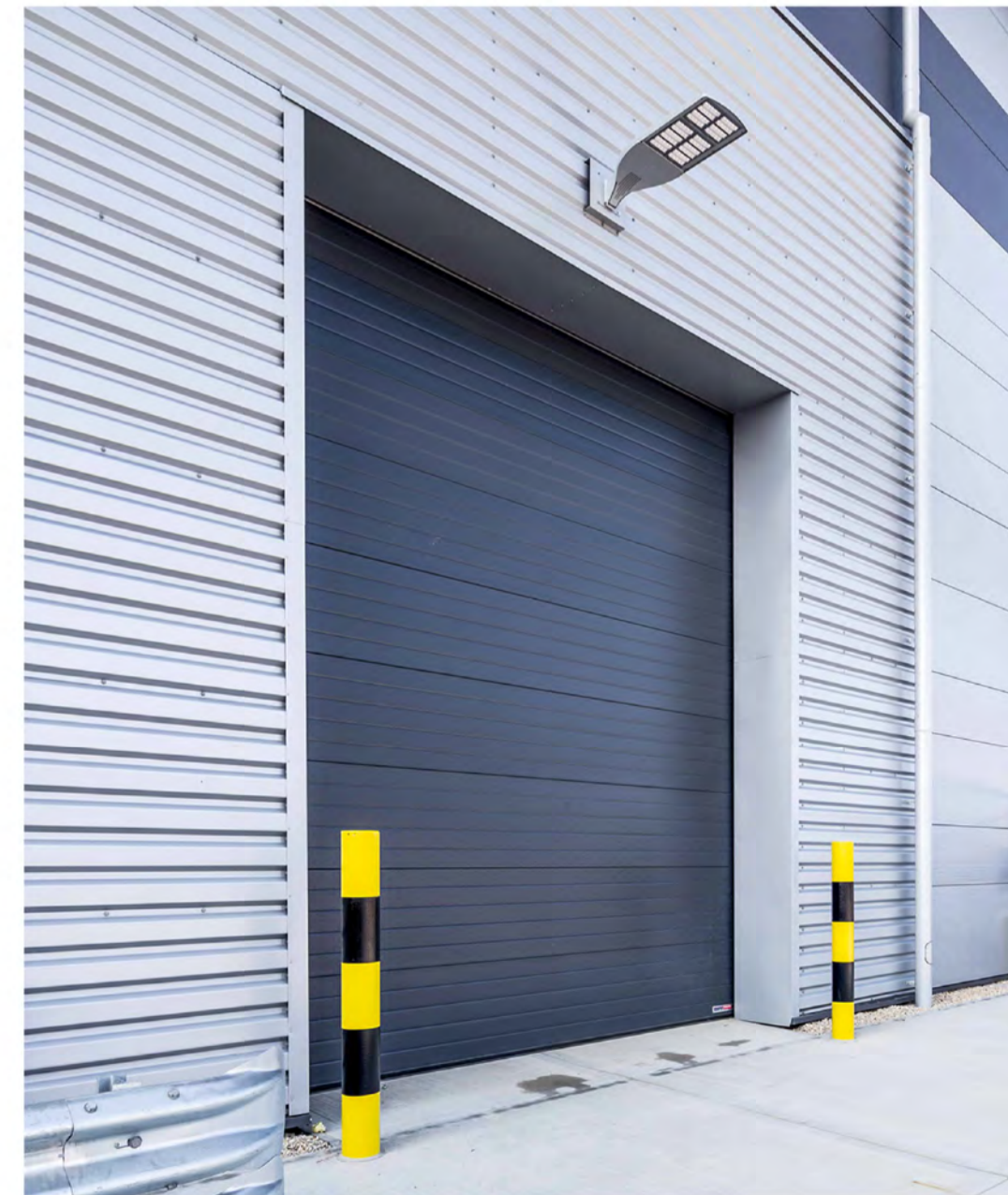
10 LOADING DOORS 020 RAL7016