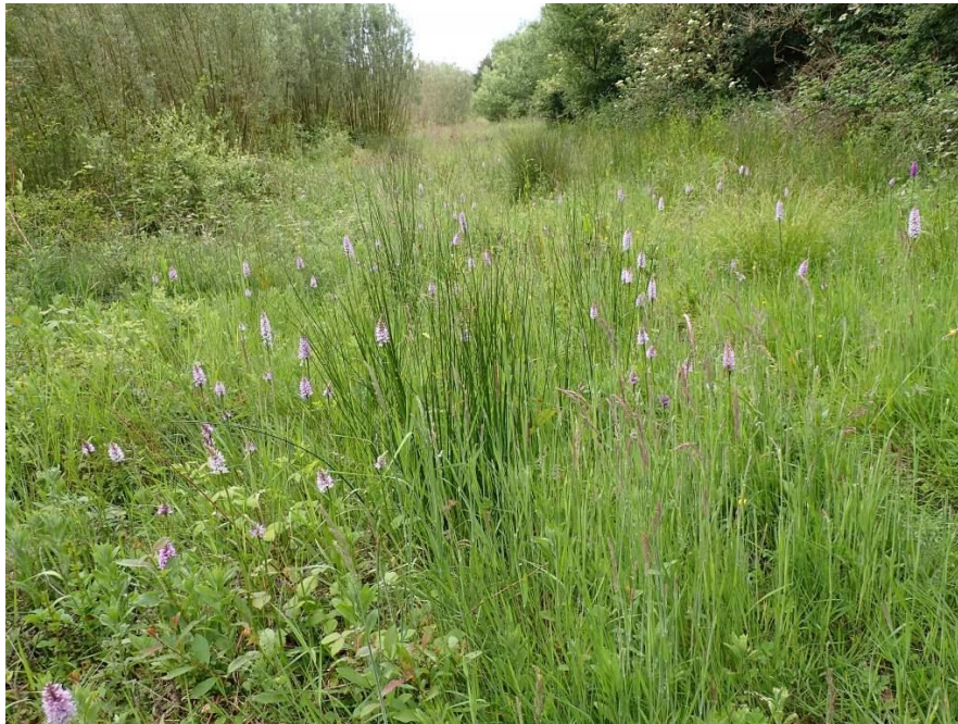
Common Spotted Orchids Dactylorhiza fuchsii , South ride looking east in the Triangle with Stratfield Brake East Woodland on the right. 09.06.2024