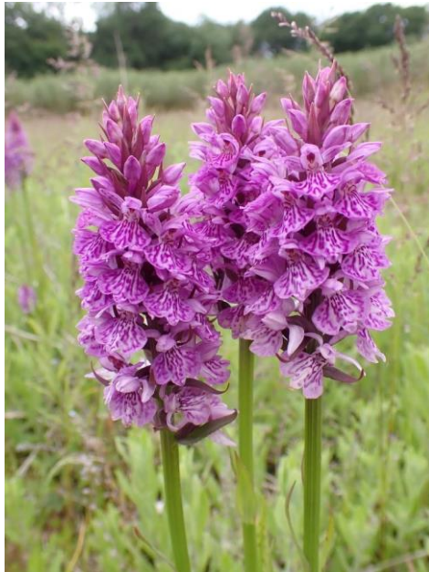
Hybrid Marsh Orchids Dactylorhiza x grandis , Triangle, 09.06.2024