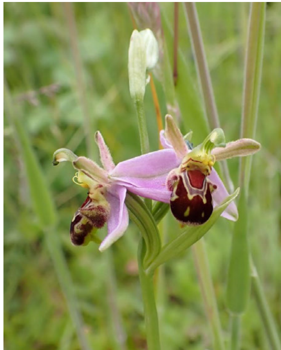
Bee Orchid Ophrys apifera , normal pink version, Triangle, 09.06.2024