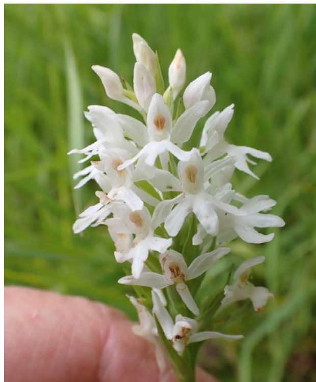
Common Spotted Orchid Dactylorhiza fuchsii , robust normal version on left and white version on right, Triangle, 09.06.2024