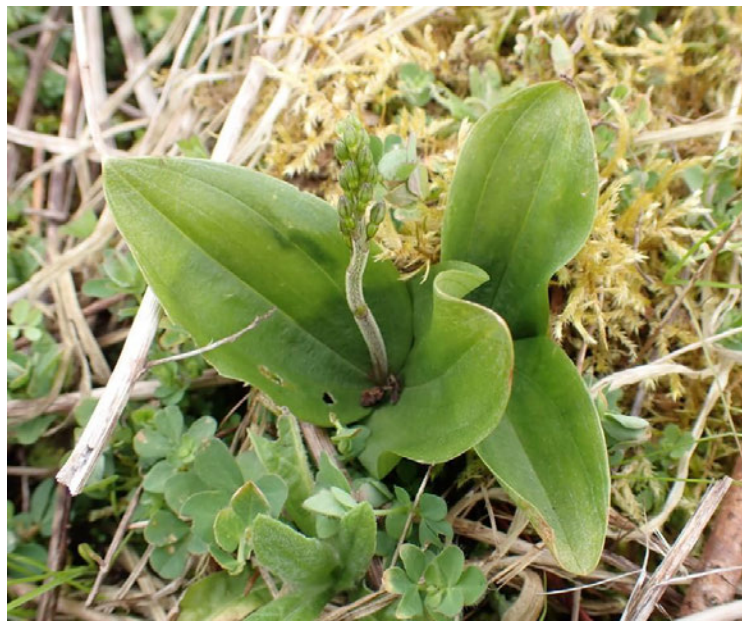
Twayblade Orchid Neottia ovata , early stage, Triangle, 06.05.2024