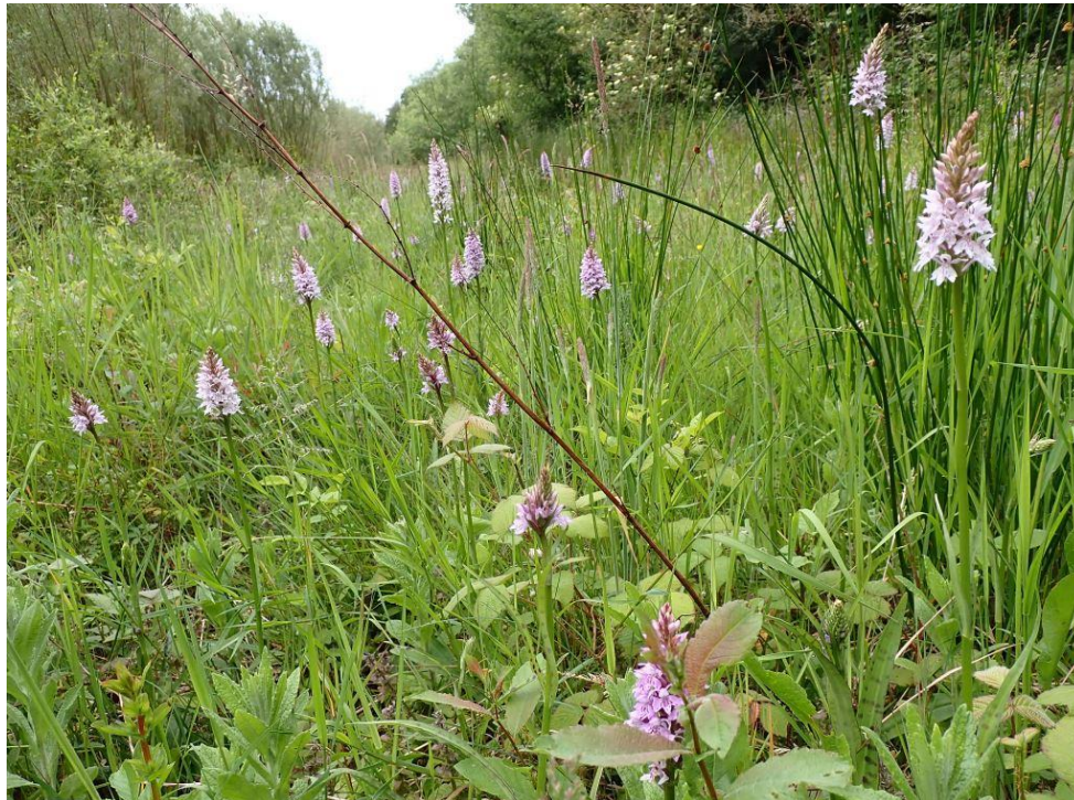
Common Spotted Orchids on the south ride of the Triangle