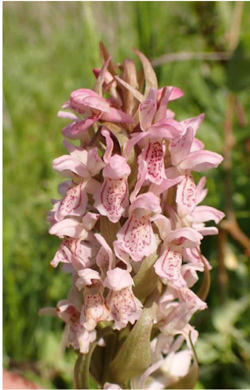
Early Marsh Orchid Dactylorhiza incarnata ssp. incarnata , Triangle, 25.05.2024