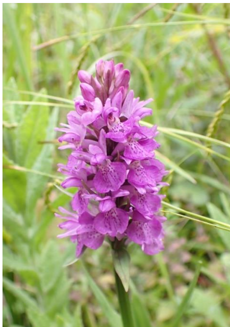
Southern Marsh Orchid Dactylorhiza praetermissa , Triangle, 09.06.2024