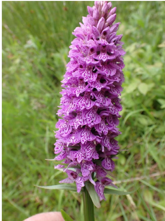
Tallest Hybrid Marsh Orchid Dactylorhiza x grandis , Triangle, 09.06.2024 (50 – 60cm tall)