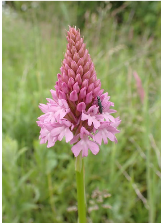
First Pyramidal Orchids Anacamptis pyramidalis , Triangle. 09.06.2024