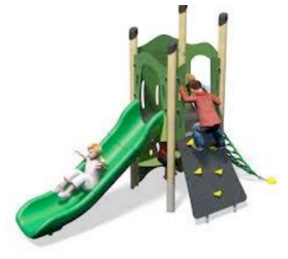
2. Tottelbank Plus Age: 2 - 5 years Skills: Climbing skills; balance & co-ordination; sliding; and social interaction. Ref. Playdale LTH/TOT