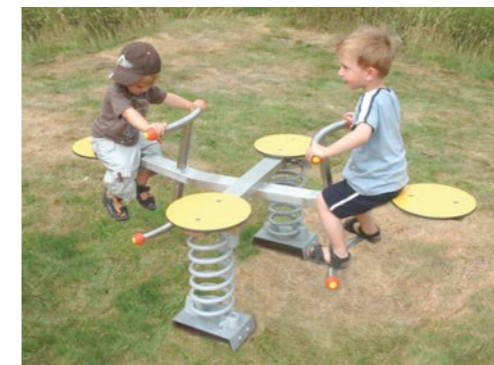
1. Quad Rider Age: 18months - 6 years Skills: Bouncing and rocking; balance and co-ordination; and play co-operation. Ref. Playdale CQRD