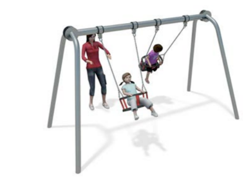
3. City Cradle Swing Age: 18 months - 3 years Skills: Speed and movement; social interaction and teamwork. Ref. Playdale SC5W