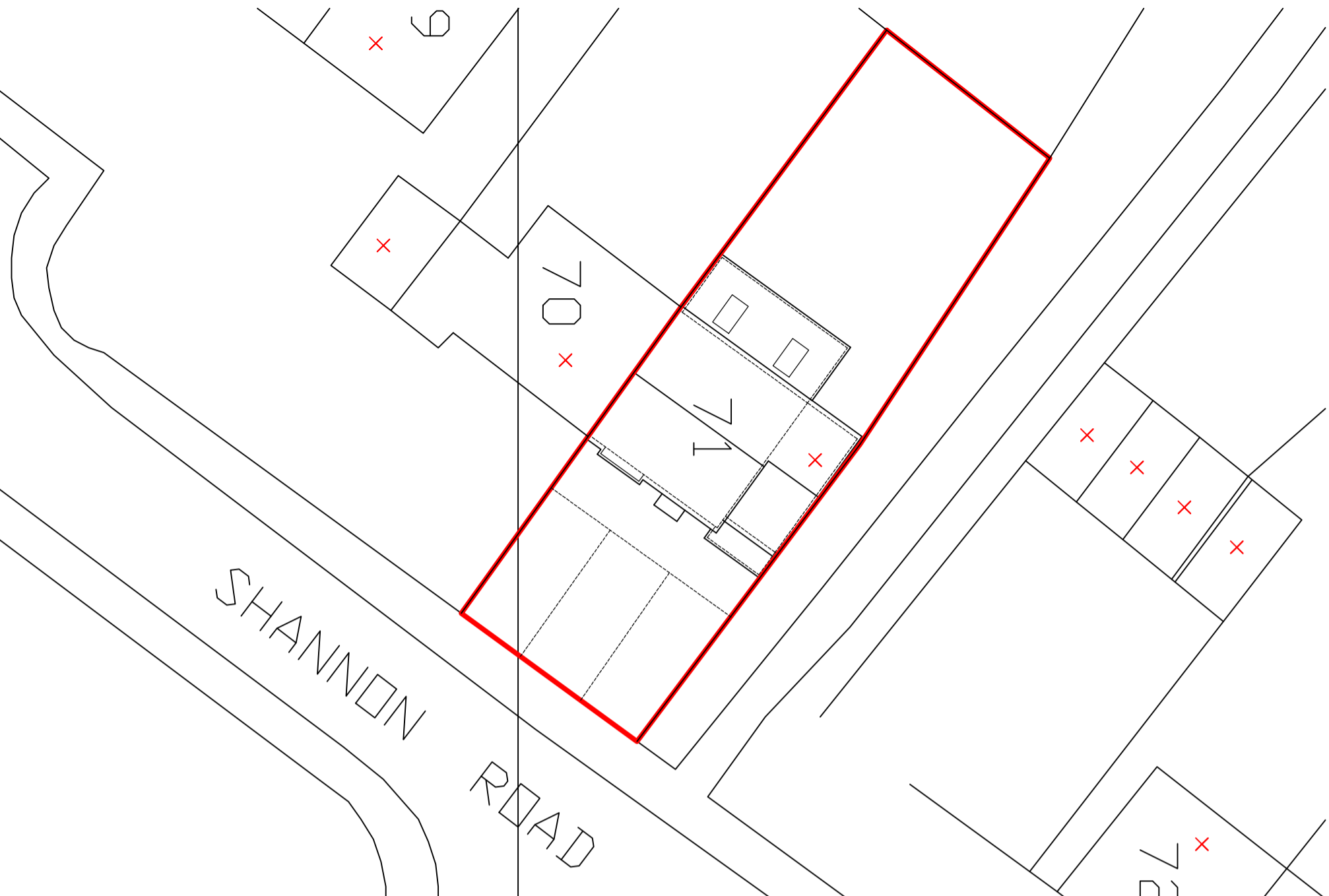
Site Plan 1:200