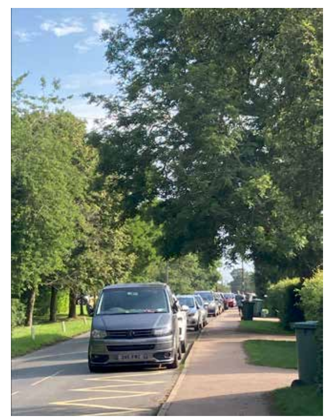
Station Road - during peak times this road is lined with parked cars. Out of peak time there would be 2-3 cars parked here.