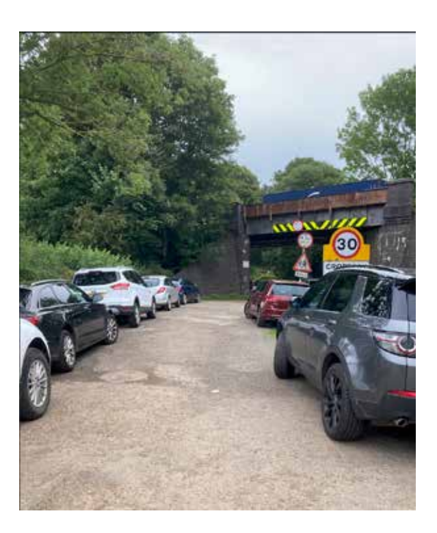
The layby by railway bridge shows cars parked across access to farmer's fields.