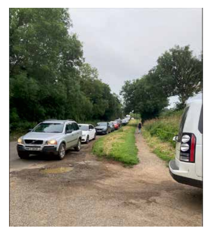
Views of cars parked on the roadside between railway bridge and Great Brouton.

We urge you to consider the impact of a development of this size on a small village, and our neighbouring villages.