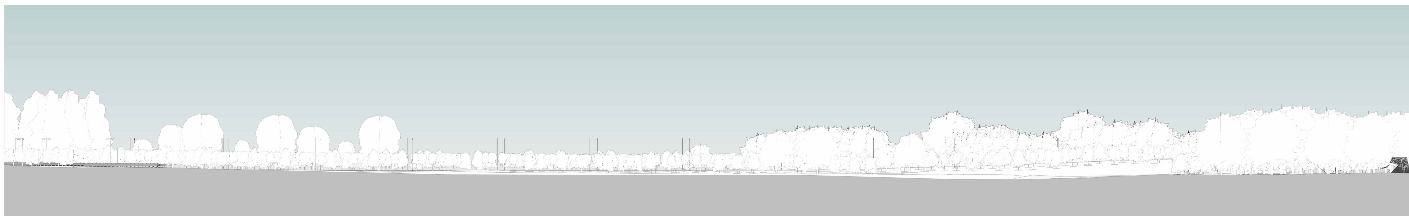
2 Existing Site Section N-S 1 : 500

NOTES All dimensions and levels to be checked on site Any discrepancies are to be reported to the Architect before any work commences This drawing shall not be scaled to ascertain any dimensions, work to figured dimensions only This drawing shall not be reproduced without express written permission from AFL Architects Ltd. DISCLAIMER When this drawing is issued in CAD, it is an uncontrolled version issued for information only, to enable the recipient to prepare their own documents/drawings for which they are solely responsible. SOFTWARE INTEROPERABILITY AFL prepared this drawing using Autodesk REVIT Architecture. AFL does not accept liability for any loss or degradation of any information held in the drawing resulting from the translation from the original file format to any other file format or from the recipient's reading of it in any other programme.