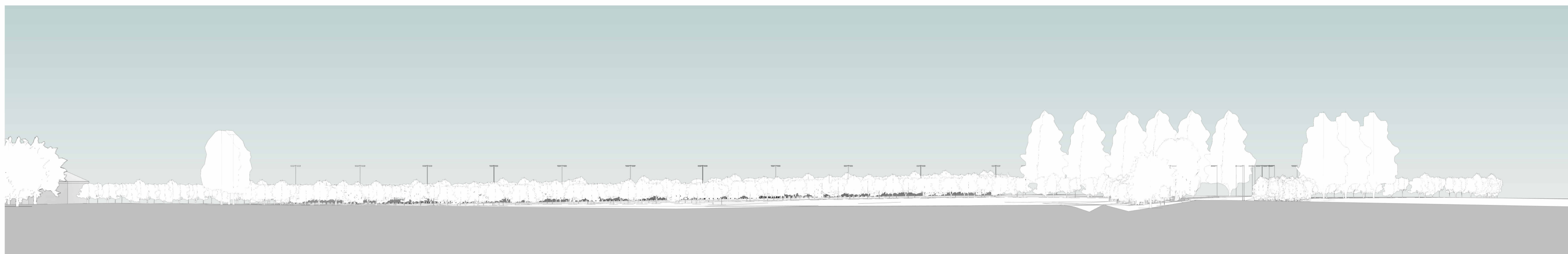
1 Existing Site Section E-W 1 : 500