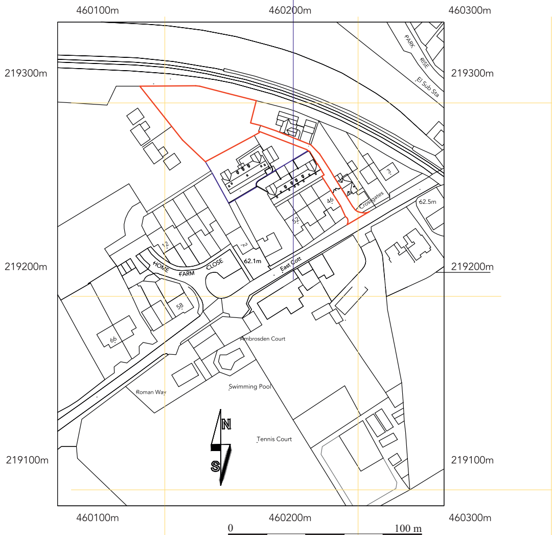
Fig 1. Trench Location