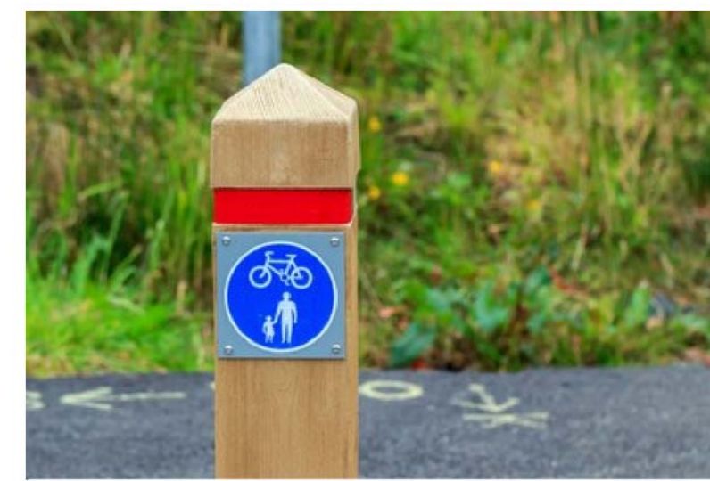
Cycle Marker Bollard