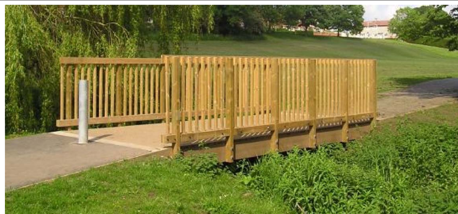
Indicative Proposed new cycle bridge 1.4m parapet 3m wide