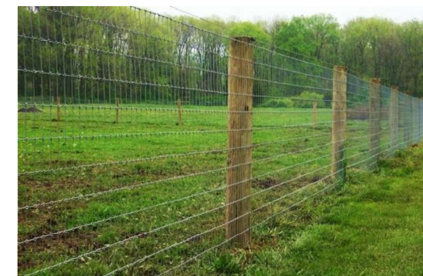
Post and Mesh Fence