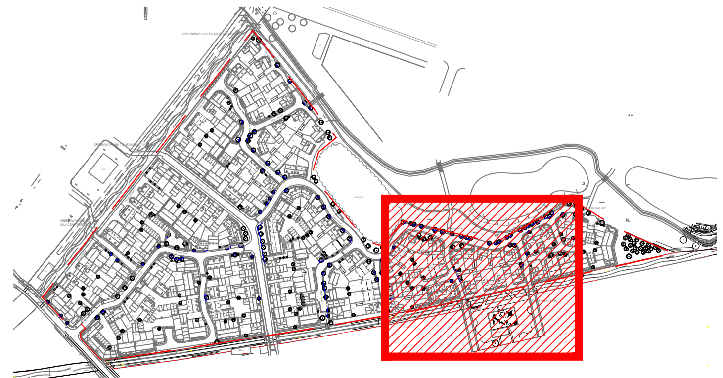
Key Plan NTS