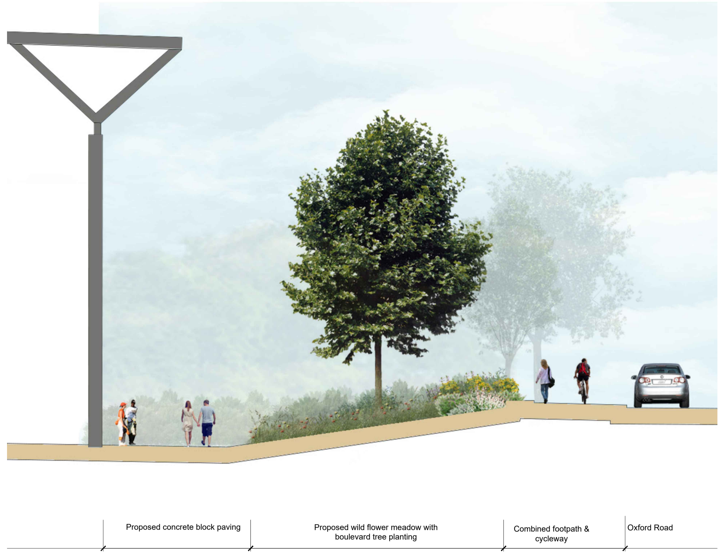
8004 2 Section G-GG Scale: 1:100