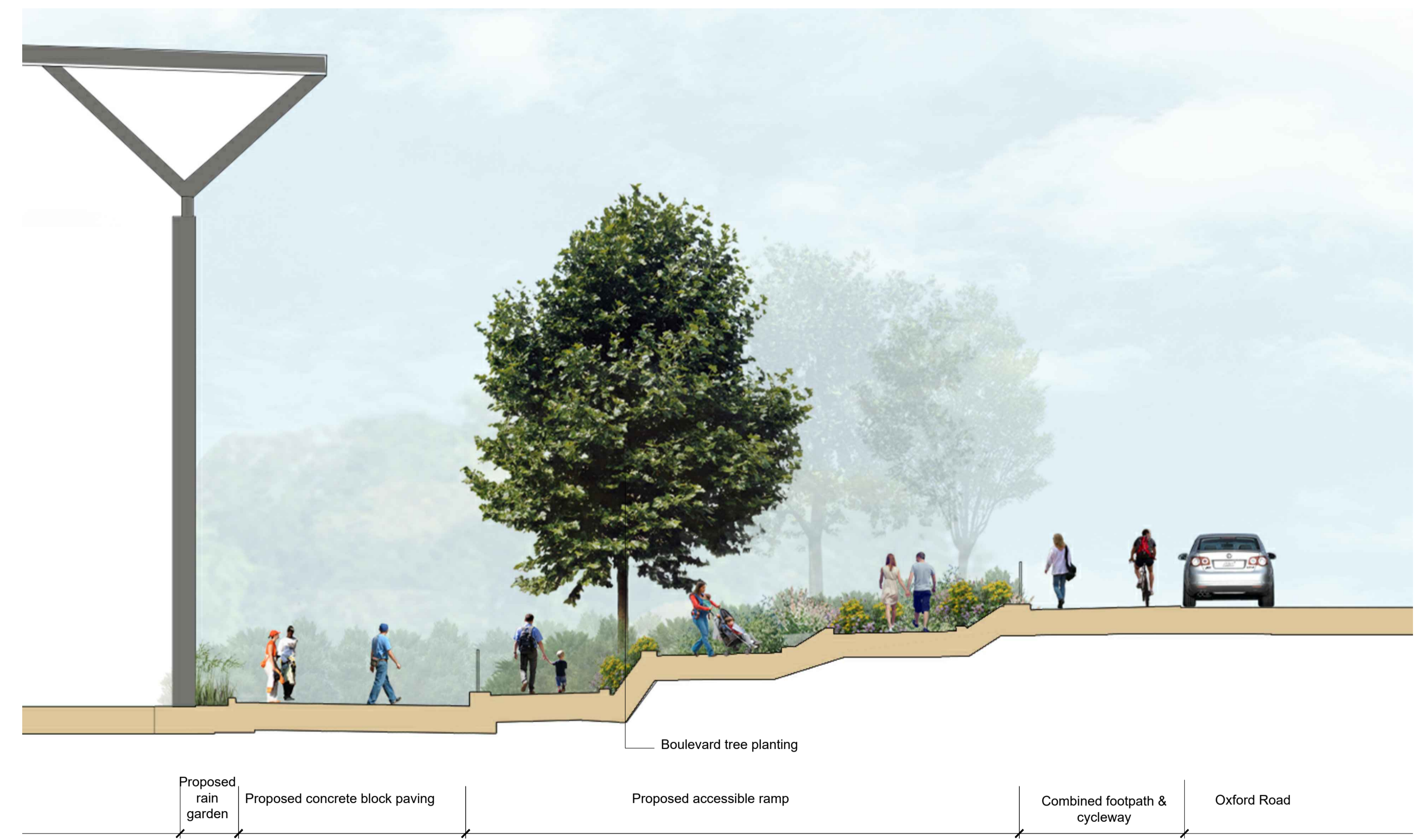
8004 3 Section H-HH Scale: 1:100