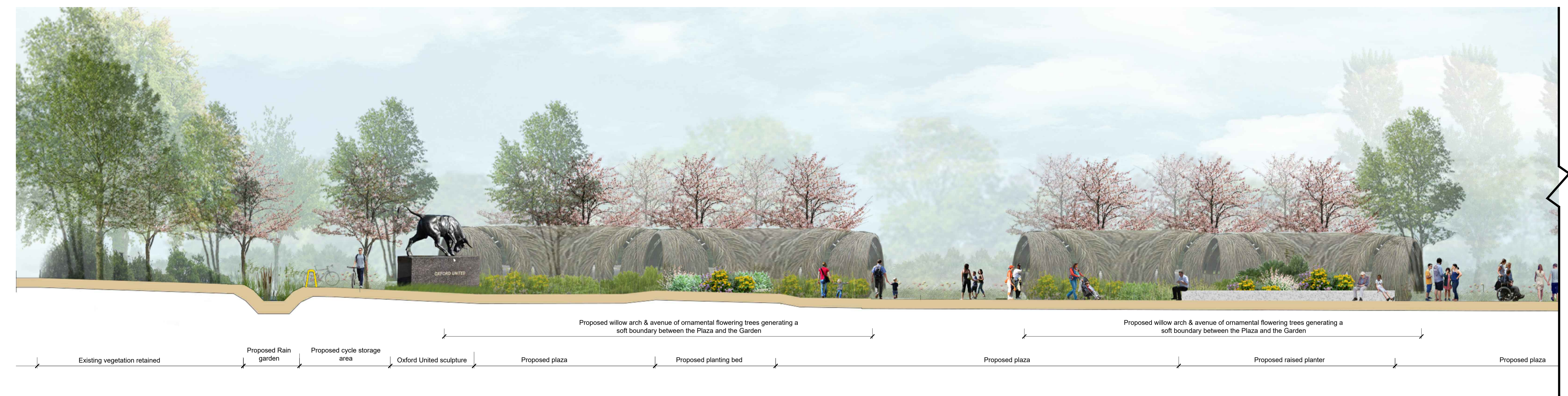
8000 Section A-AA 1 Scale: 1:100