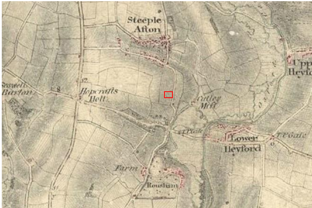
Figure 4 – Extract of William Stanley's map of Bicester 1815. Approximate site location is marked in red.