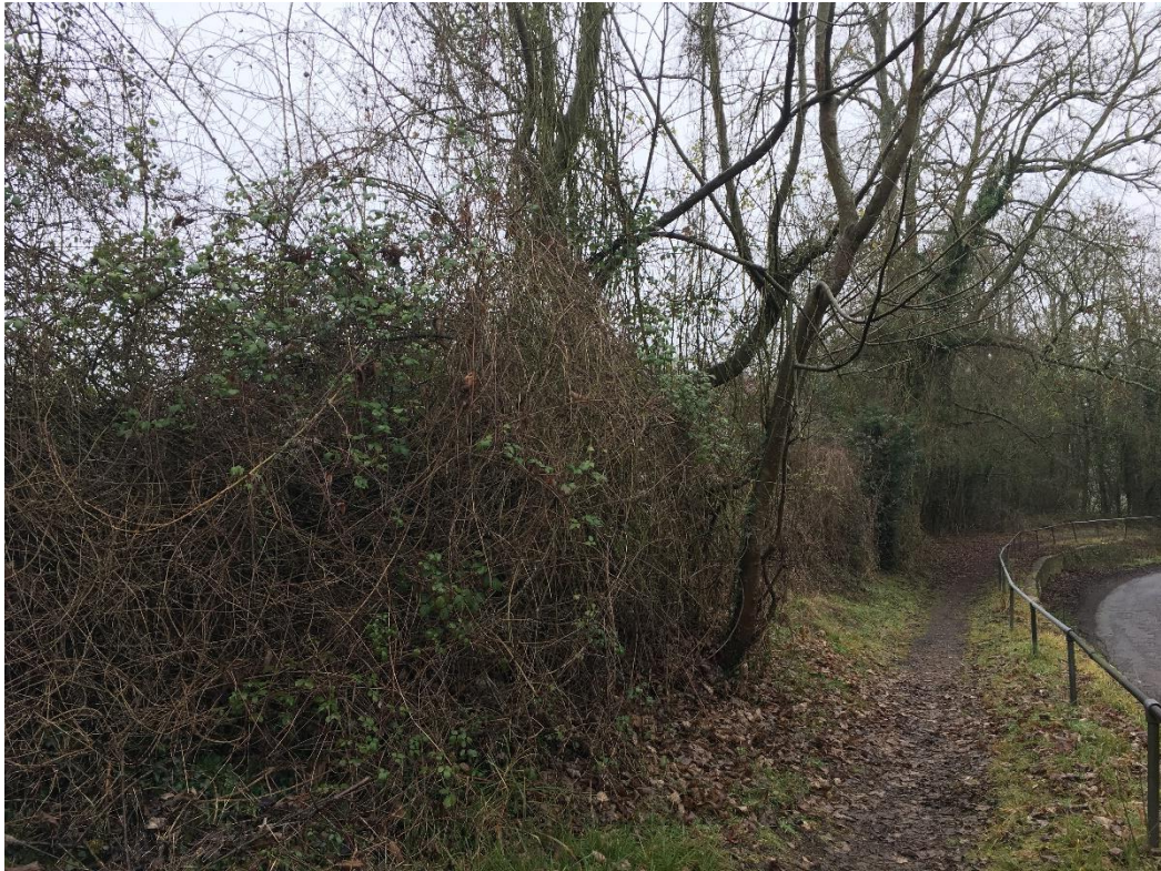
Figure 8 – View from the east footpath by Heyford Road towards Rousham House and the Cherwell valley.