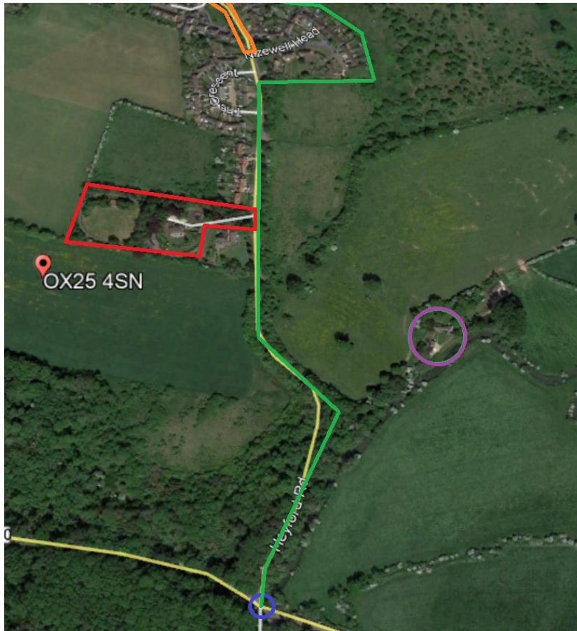
Figure 2 – Photo showing site location (red), Cuttle Mill Complex (purple), Heyford Bridge (blue), Rousham Conservation Area boundary (green) and Steeple Aston Conservation Area boundary (orange).