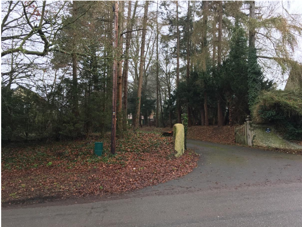
Figure 11 – View of The Beeches from within Rousham Conservation Area, looking east to west.