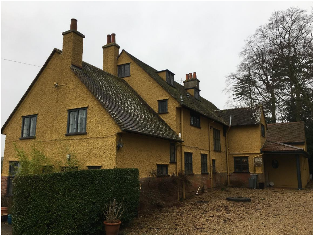
Figure 9 – The Beeches.

3.12 The Beeches is not visible from any of the important views that are mentioned within the Rousham Conservation Area Appraisal, including any of the views from view 6 (Riverside Walk), View 8 (The Causeway) or View 9 (Temple Mill), due to the site being situated higher up the hill and the view being completely obstructed by trees and vegetation. Views of The Beeches at a closer distance, from within the conservation area (Figure 11), are also heavily filtered. Parts of the house and some outbuildings can be glimpsed, but the field to west of the house, and the railway and buildings within the field, cannot be seen. This is the case during the winter and in the summer months even less of the buildings would be visible.