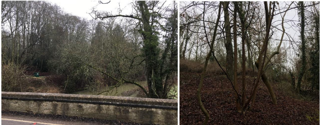
Figure 3 – View from Heyford Bridge (left) and from footpath leading to Cuttle Mill 2 (right), looking north towards the proposed site, showing that the site is not visible.