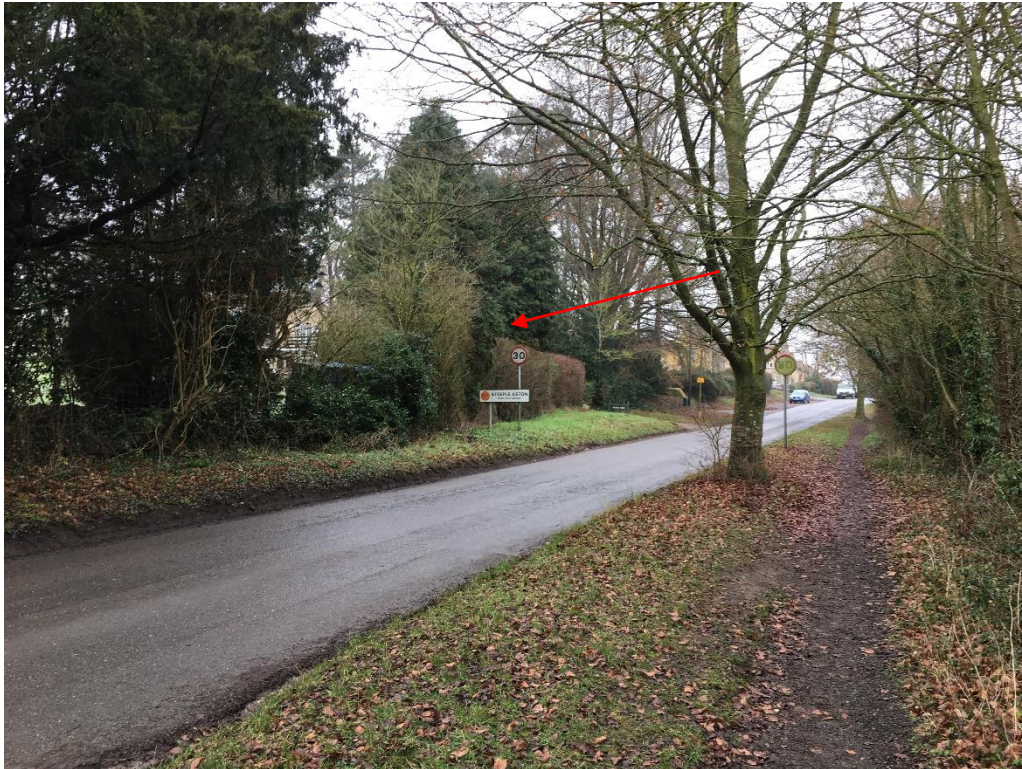
Figure 7 – View from south to north along Heyford Road. The boundary of Rousham Conservation Area is the road. An arrow points to the location of The Beeches.

3.10 The Beeches is located close to the west boundary of Rousham Conservation Area. This part of the conservation area is along Heyford Road and located on a hill. A large woodland is located on the south part of the hill, which has been in existence since at least the 19 th century, when it was known as Dean Plantation (Figure 5). The woodland and trees that line Heyford Road mean that while the hill and woodland itself can be seen from long distances, smaller features and buildings like the roads and houses cannot be easily seen. Due to the trees, vegetation and the rising topography of the land views in this part of the conservation tend to be obstructed and only from short distances (Figure 7). Longer views of the valley are not possible from the footpath on the east side of the road (within the conservation area) due to the trees and vegetation (Figure 8), and it is only possible to get longer views of the valley if you are to walk through the vegetation and into the fields on the east side of the road.