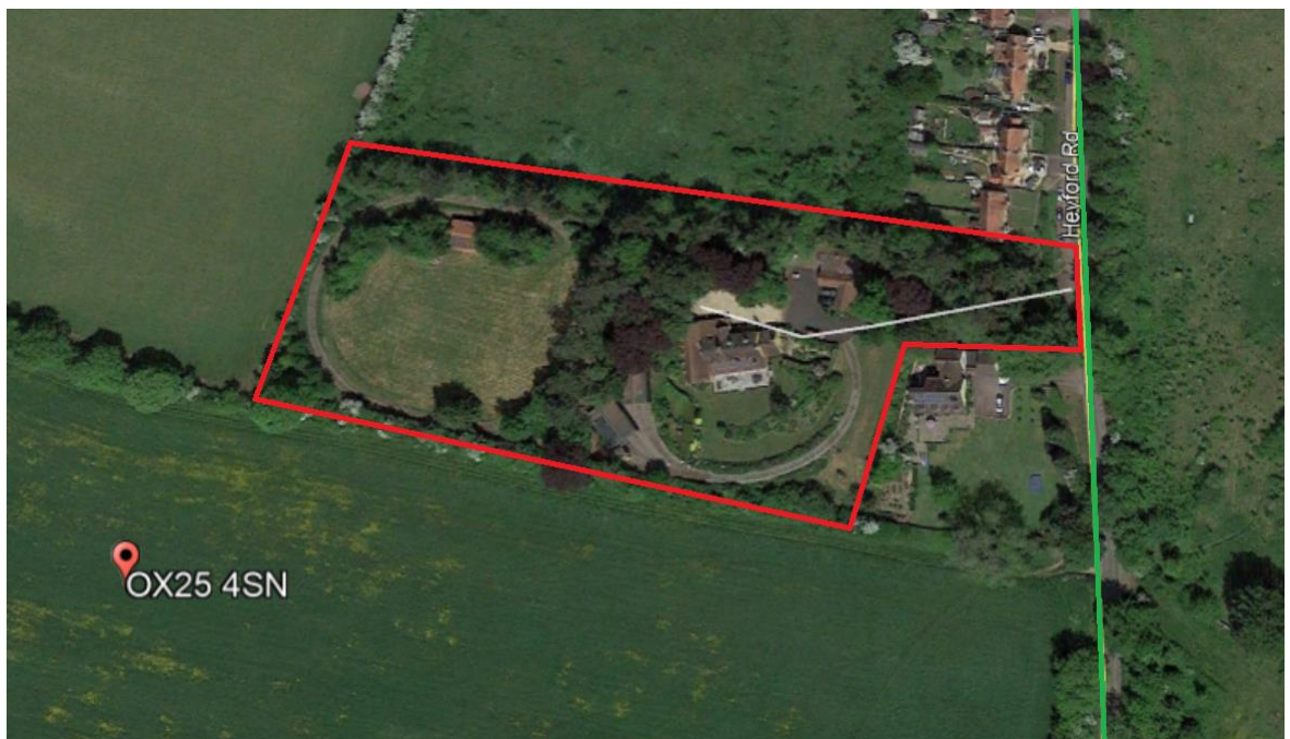
Figure 1 – Site location (in red). Rousham Conservation Area is on the opposite side of Heyford Road (east) with the boundary marked by the green line.