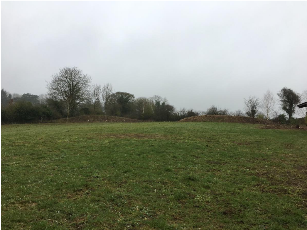
Figure 10 – View of the field to the west of the The Beeches House, looking east to west.