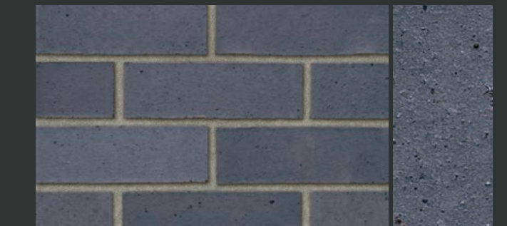
Staffordshire Slate Blue Smooth 2232