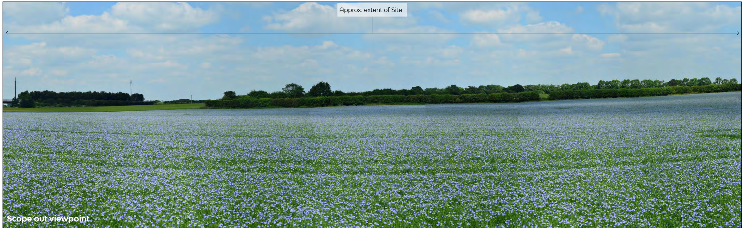
Baseline Image B: View north from PRoW 109/5/10 traversing Site A