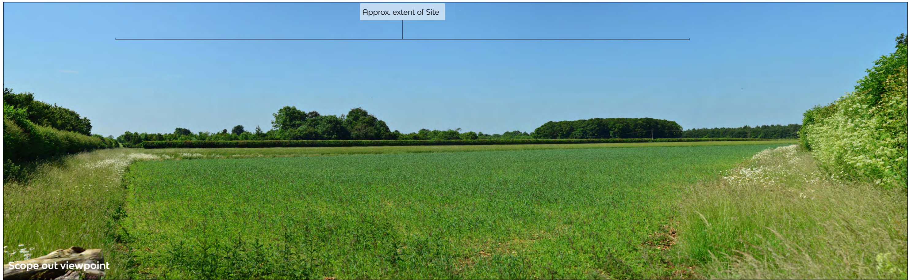
Baseline Image A: View from junction of PRoW within Tusmore Park