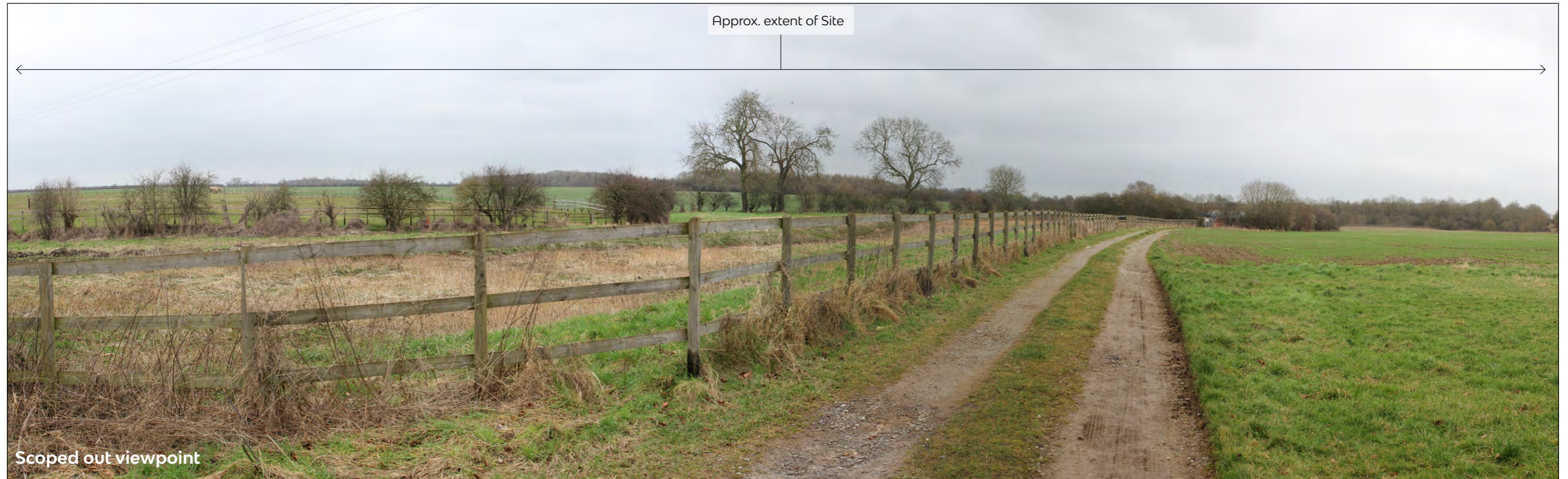
Baseline Image F: View from PRoW 109/7/10, east of Ardley