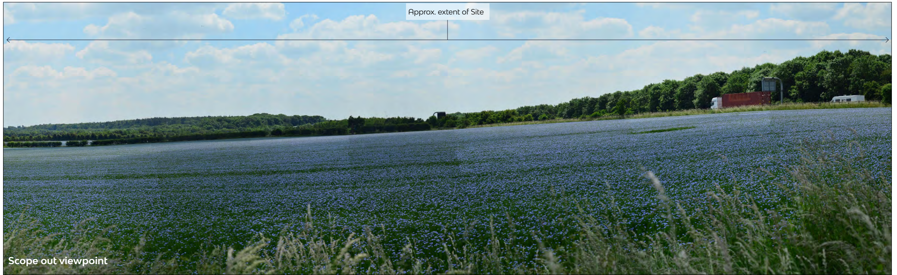
Baseline Image B: View south from PRow 109/5/10 traversing Site A