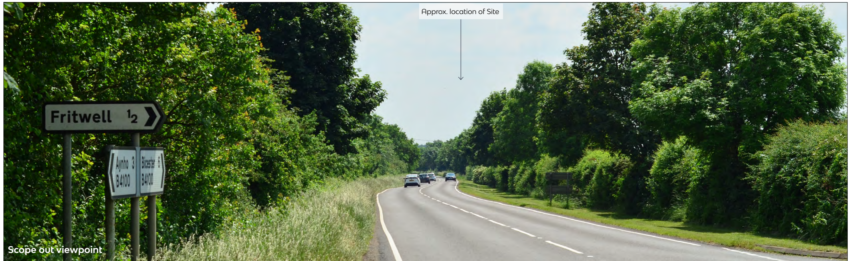
Baseline Image C: View from B4100 northwest of Application Site