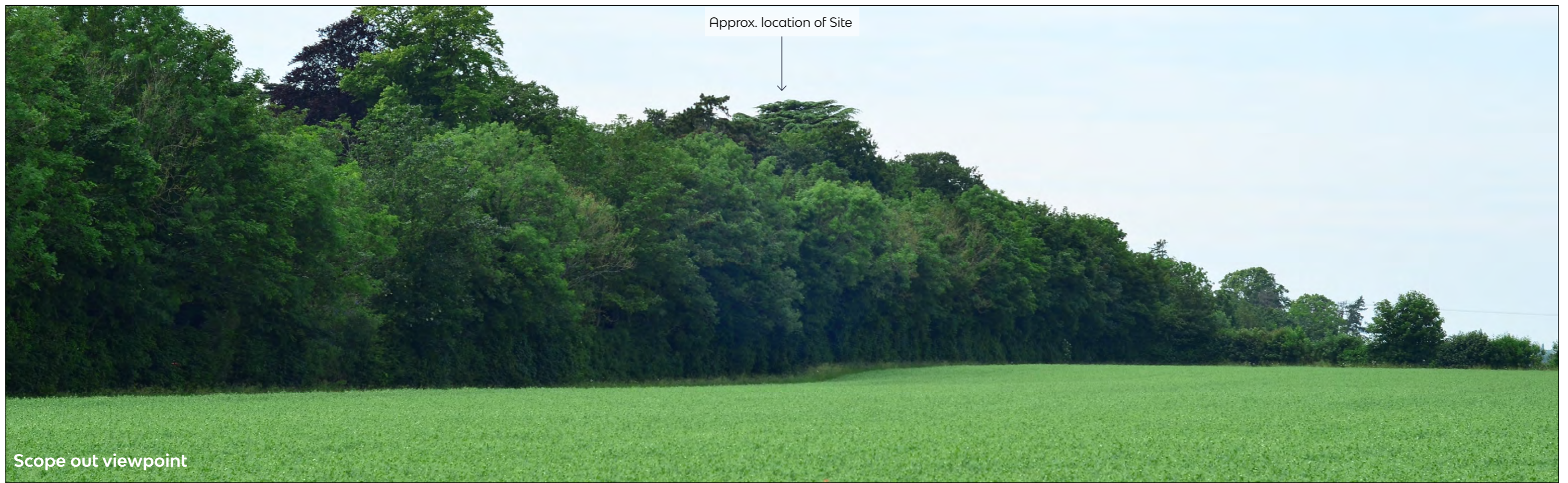
Baseline Image H: View from bridleway 367/5/20, north of Stoke Little Wood