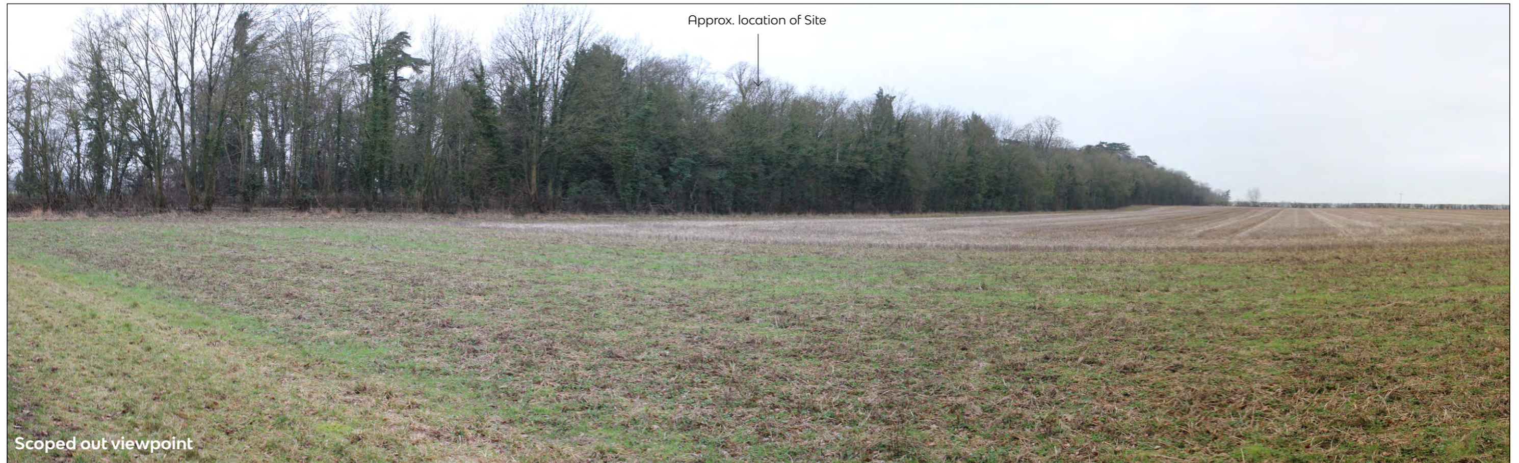
Baseline Image H: View from bridleway 367/5/20, north of Stoke Little Wood