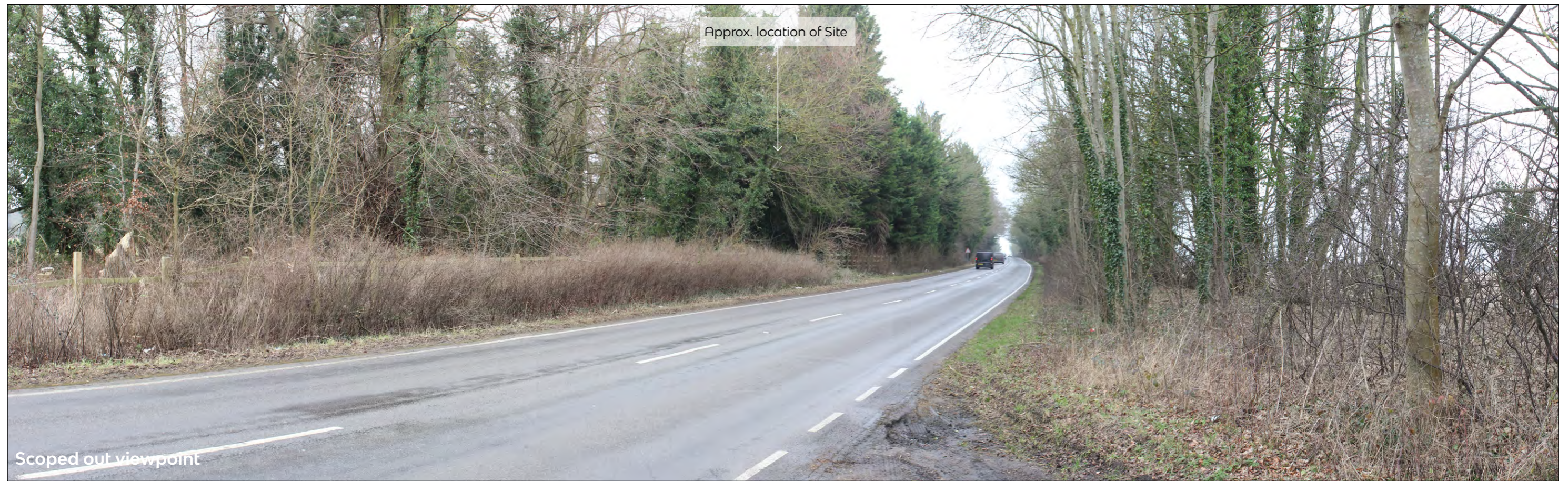
Baseline Image G: View from B4100 south of Swifts House Farm