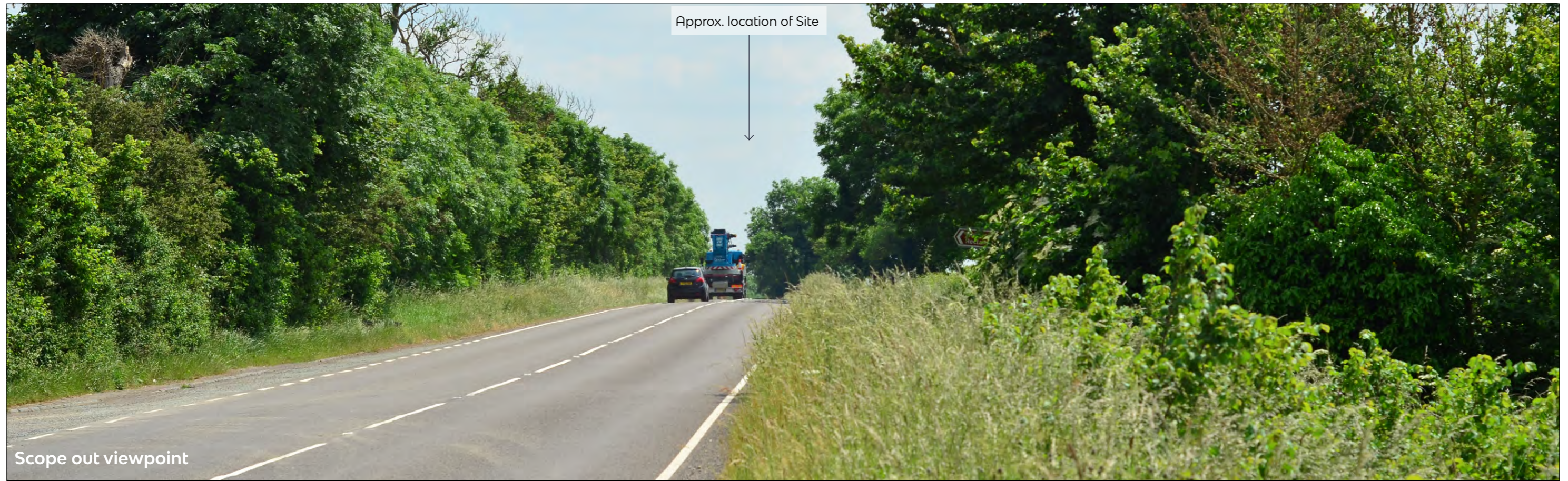
Scope out viewpoint