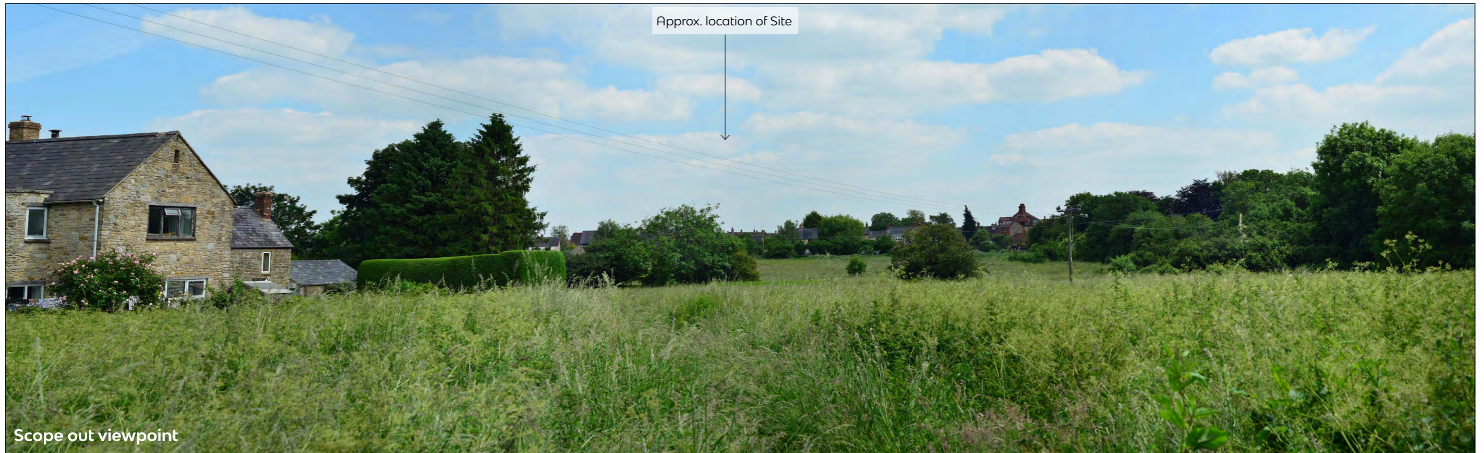
Scope out viewpoint