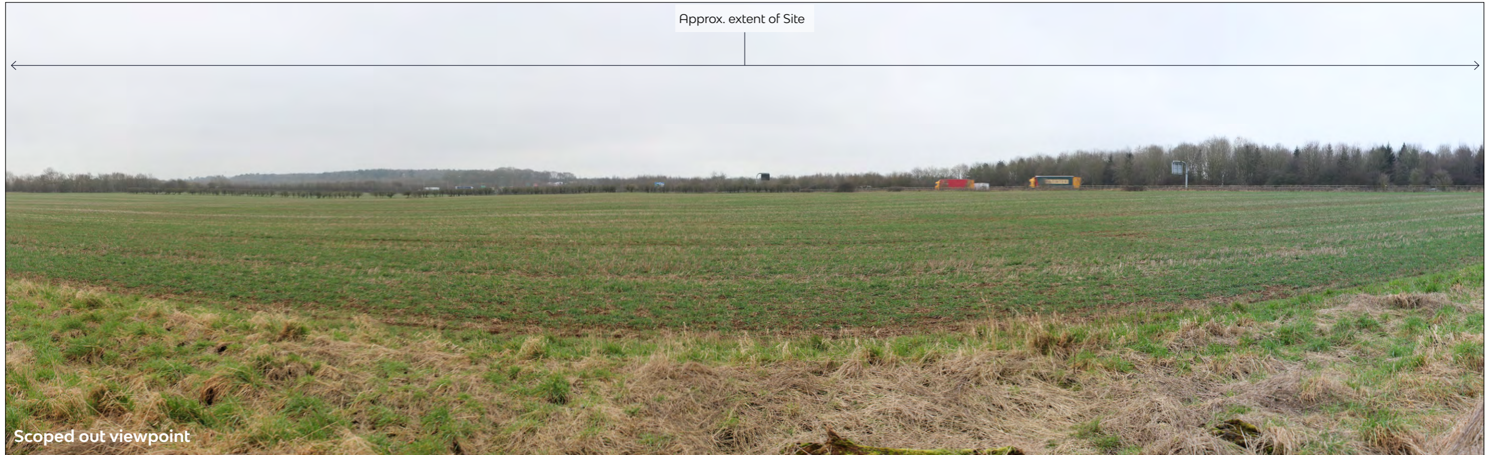
Baseline Image B: View north to south from PRow 109/5/10 traversing Western Site