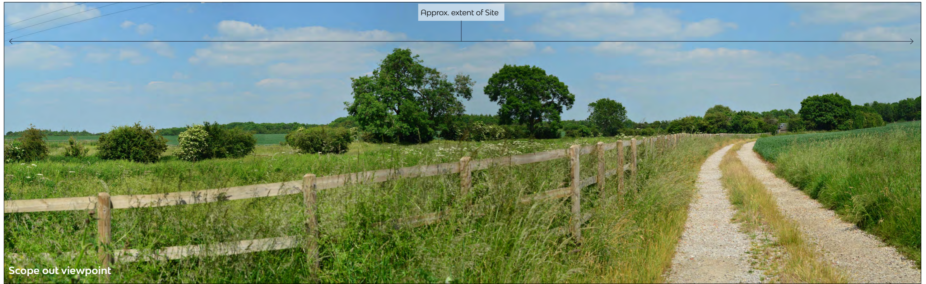
Baseline Image F: View from PRow 109/7/10, east of Ardley