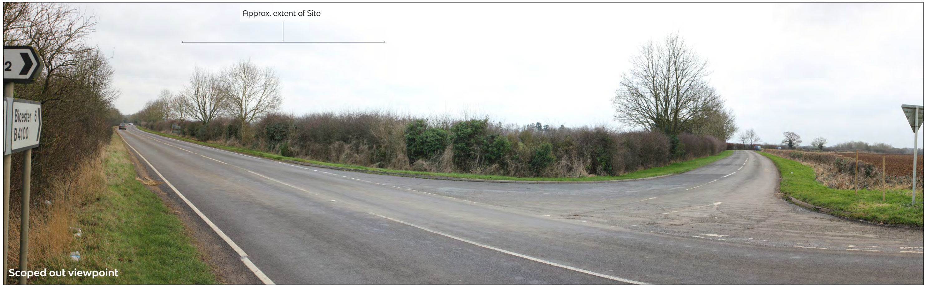
Baseline Image C: View from B4100 northwest of Application Site