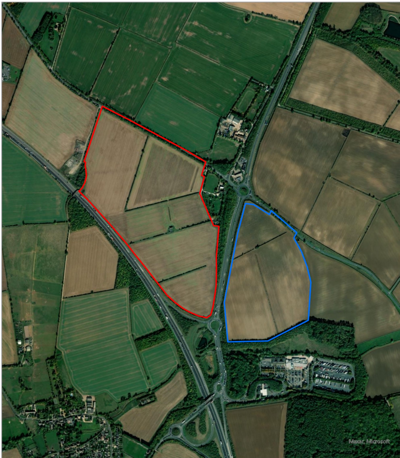
Figure 2.1: Site Boundary Plan