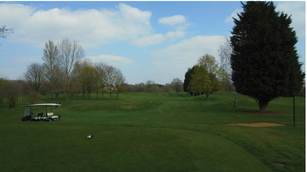
Plate 2: View northeast of Golf Course from near western boundary