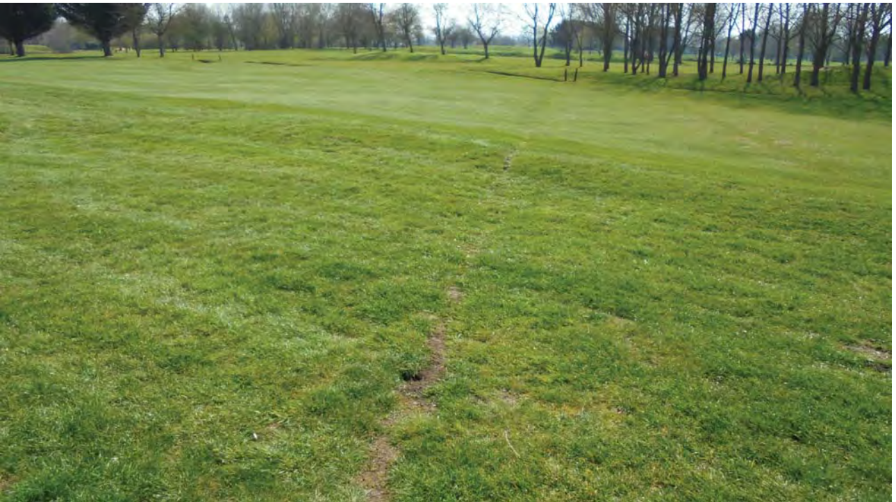
Plate 12: View south of field drains (Site 55)