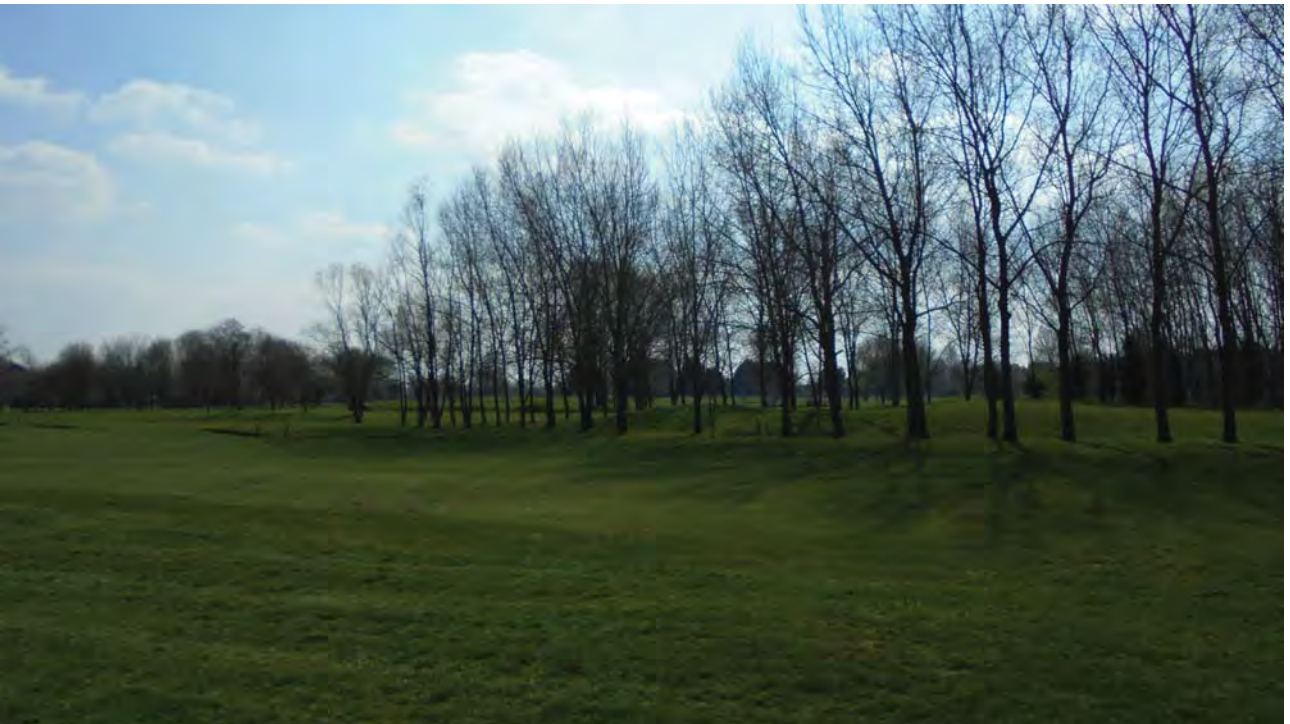
Plate 4: View southeast of mature trees on banks separating golf fairways