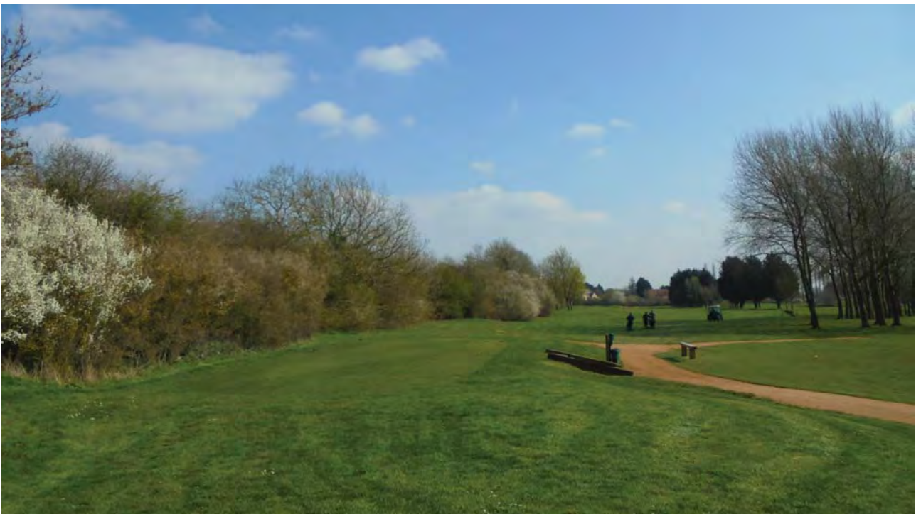
Plate 10: View southeast along A4095 boundary