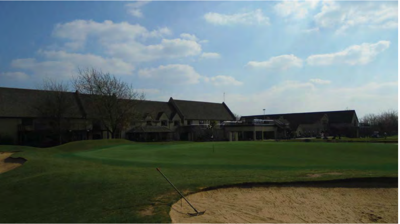
Plate 3: View southeast of Golf Club House and Hotel