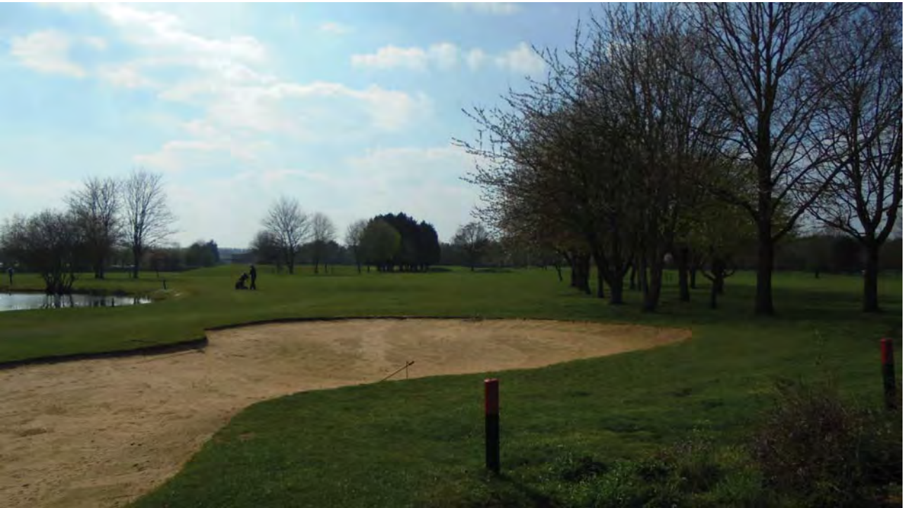
Plate 7: View northwest of bunker near Bicester Golf Club House and Hotel