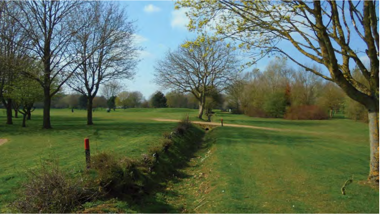
Plate 1: View northwest of Site 54 in use as Golf Course drainage ditch