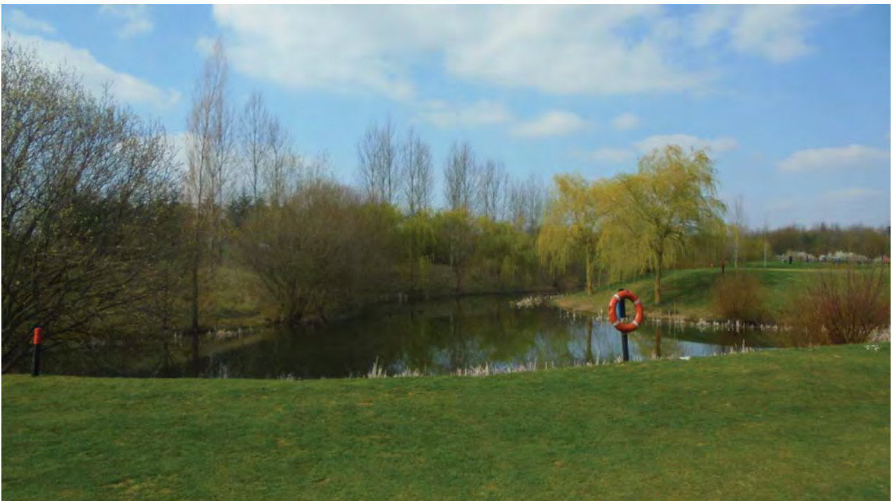
Plate 6: View northeast of water feature near M40 boundary