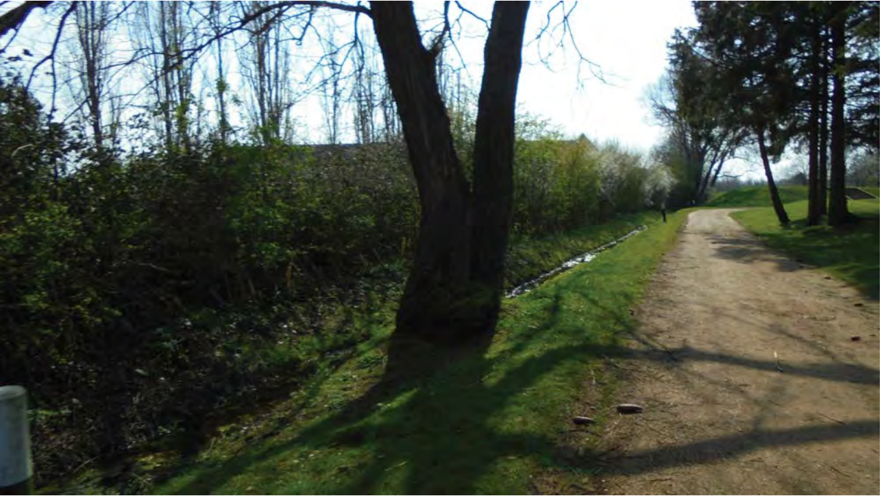
Plate 11: View southwest along Site's southeastern boundary