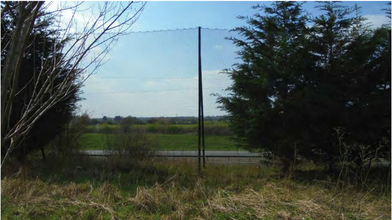
Plate 9: View west from Site of M40