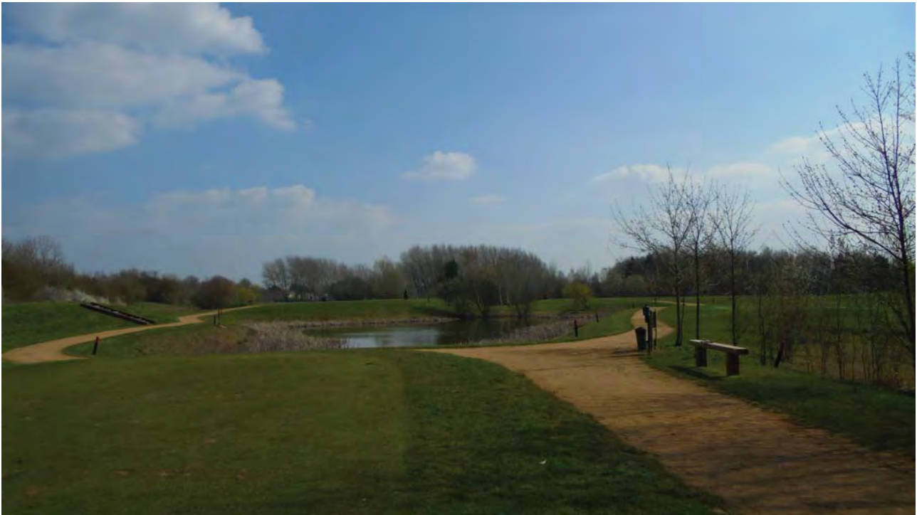
Plate 5: View southeast from northwest corner of Site of water feature