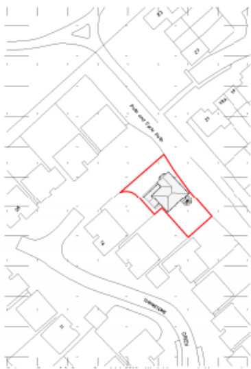
1 00.0 location plan as existing P100A 1 : 1250