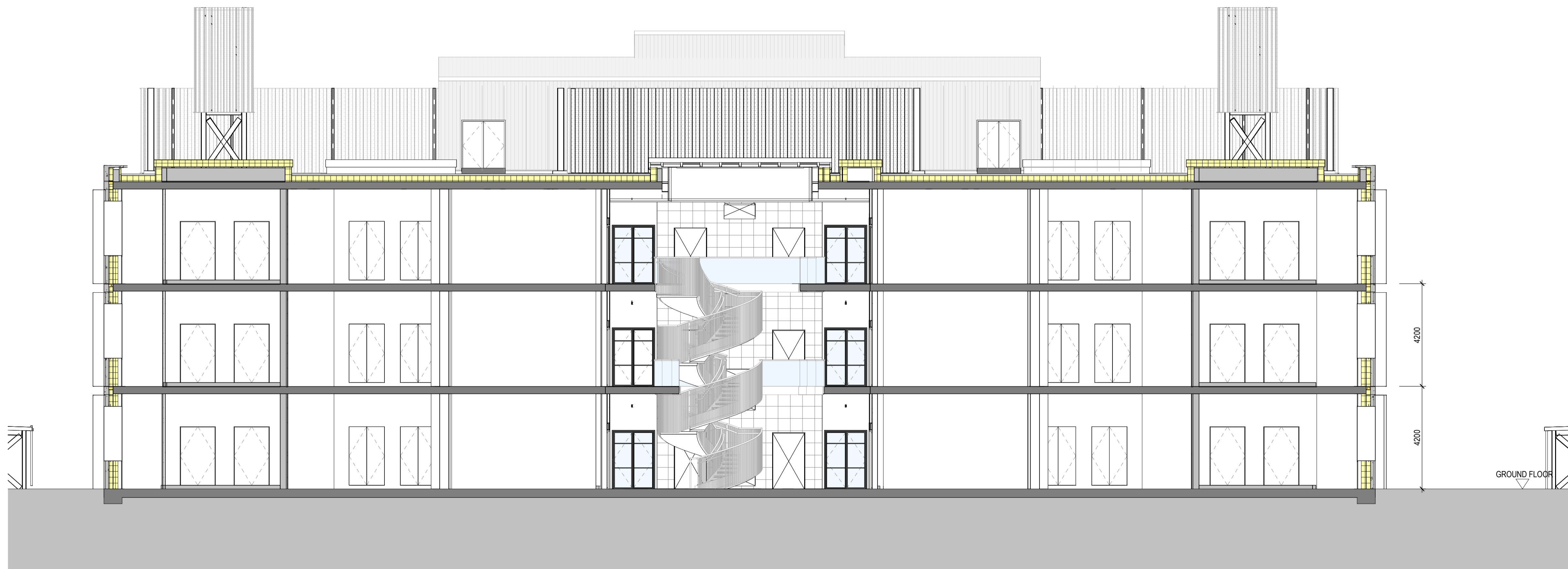
2 PLANNING - PROPOSED SECTION DD - COMMERCIAL BUILDING