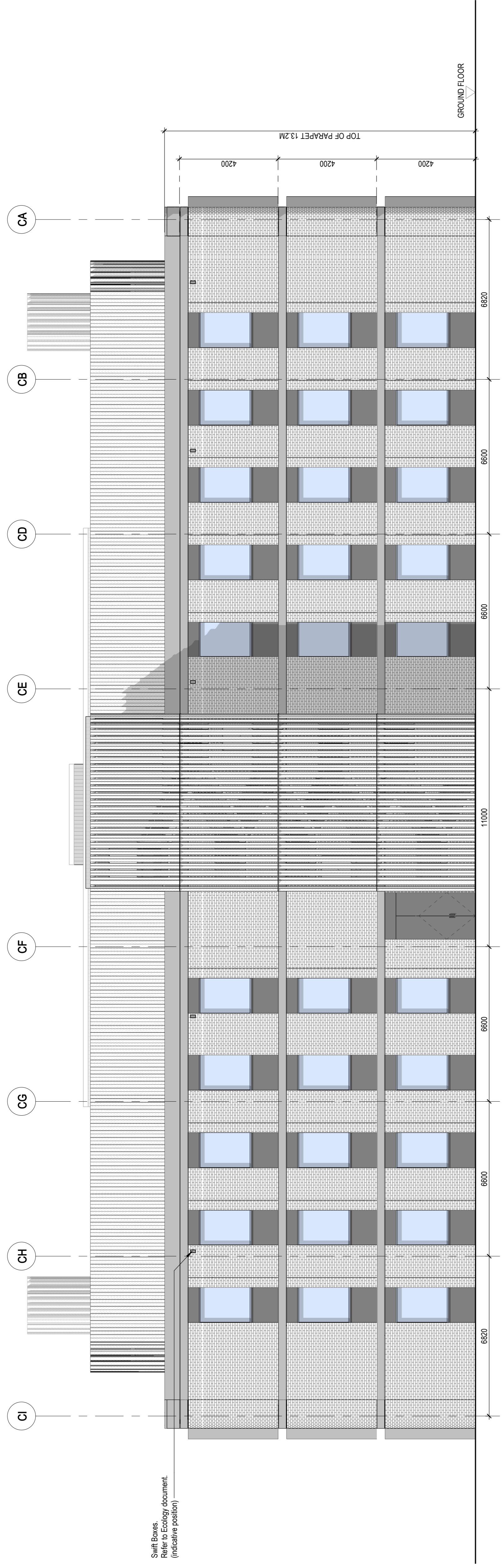
1 PROPOSED NORTH ELEVATION - COMMERCIAL BUILDING