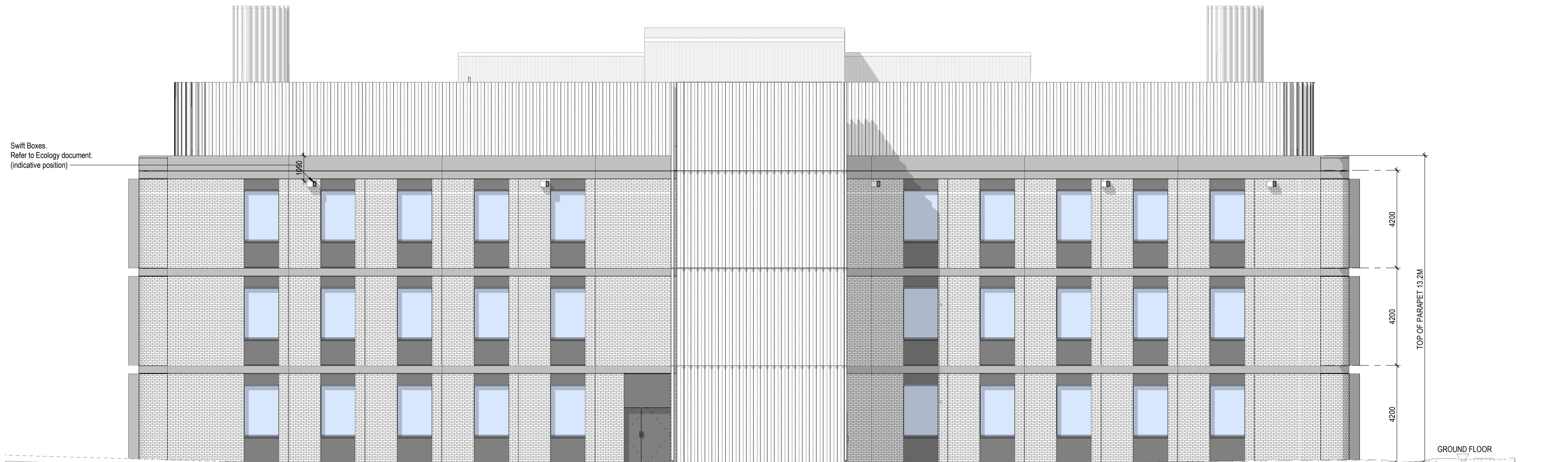
PROPOSED NORTH ELEVATION - COMMERCIAL BUILDING