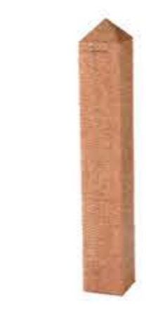
Woodscape timber bollard

Tree codes B = Bare root, C = Container Grown, RB = Root Balled