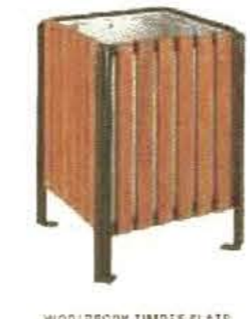
Iroka Woolbrook Litter Bin