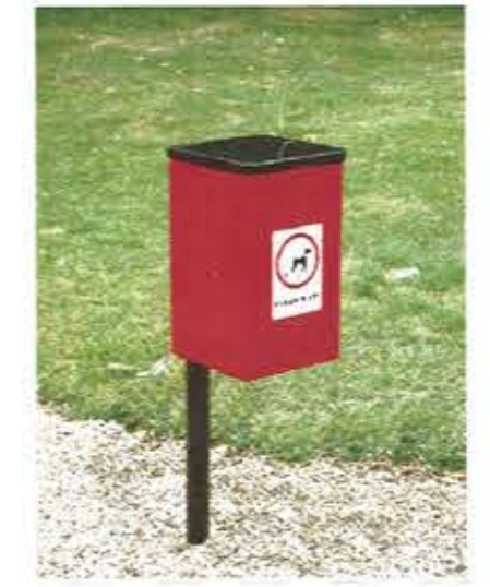
Broxap Dog K-Nine mounted dog waste bin

NOTES Drawing based on David Fountain Designs Ltd. drawing DFD/BIC/L17 Rev L Landscaping details for green route SL24, SL24A, SL24B dated 12th May 2014