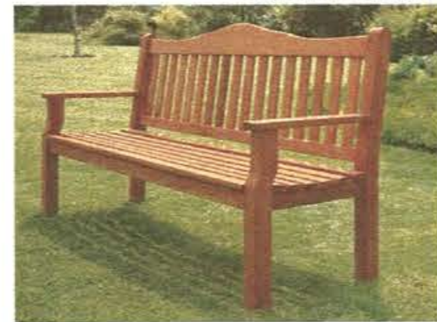
Iroka traditional arched bench with flat arms