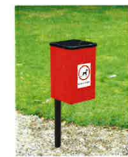
Broxap Dog K-Nine mounted dog waste bin ref BX45 2580 PM