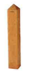
Woodscape timber bollard

Tree codes B = Bare root, C = Container Grown, RB = Root Balled