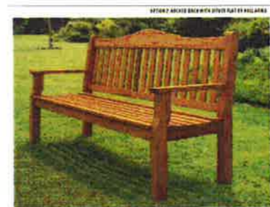
Iroka traditional arched bench with flat arms