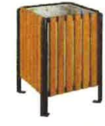
Iroka Woolbrook Litter Bin