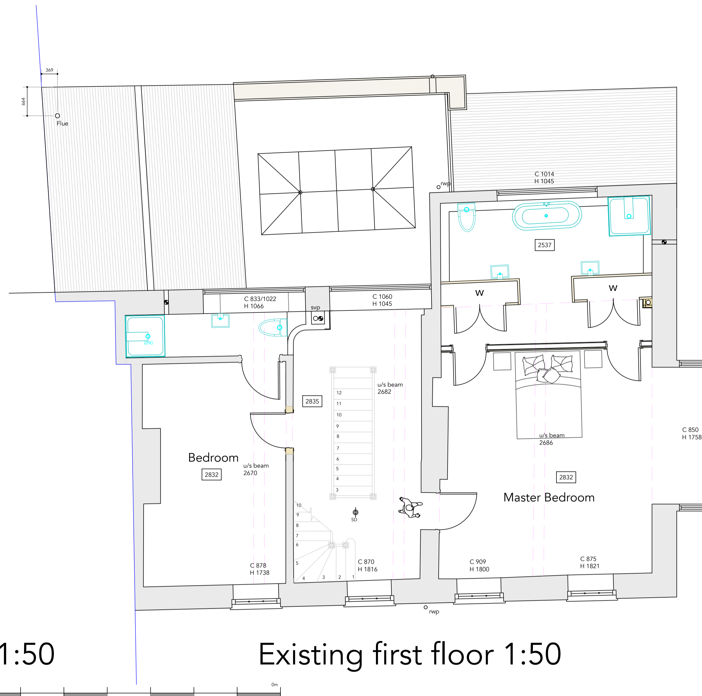
Existing first floor 1:50