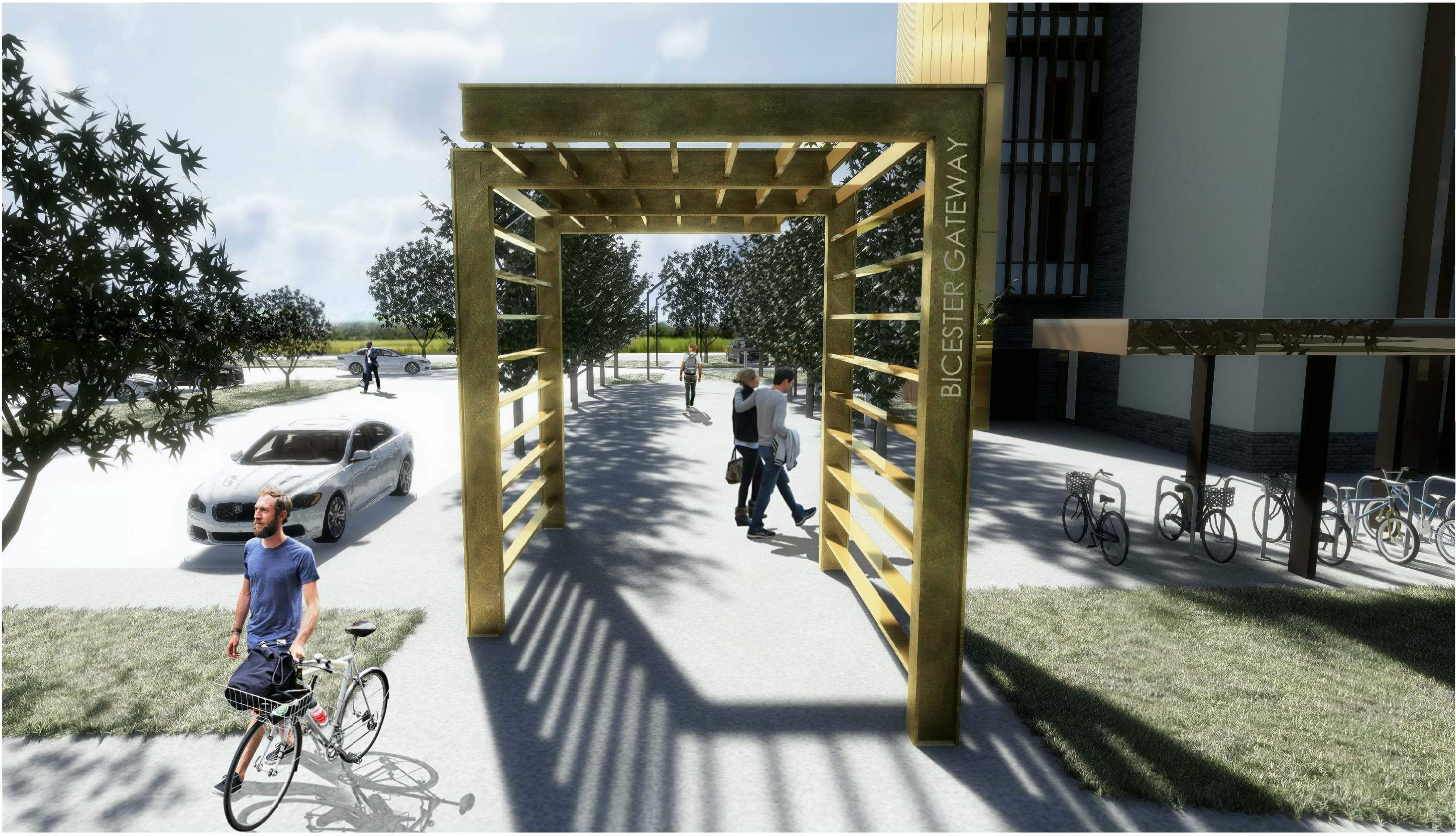
01 PEDESTRIAN BUILDING APPROACH - A41