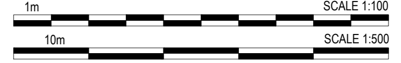
Existing Ground Floor Plan (4 of 4) Scale 1:100 @ A0