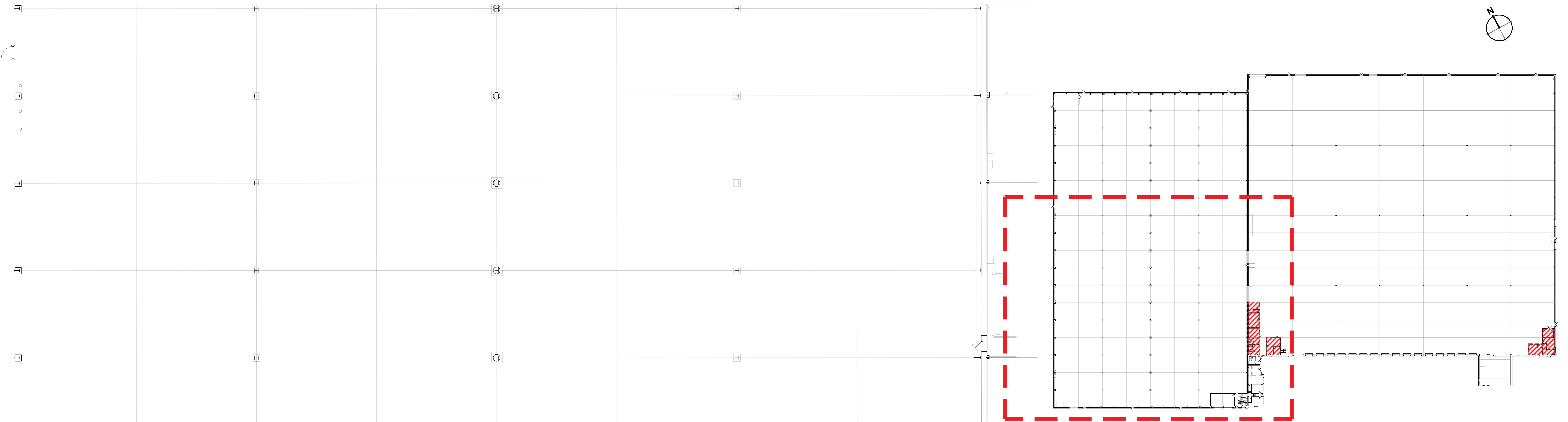
Key Plan Scale 1:500 @ A0