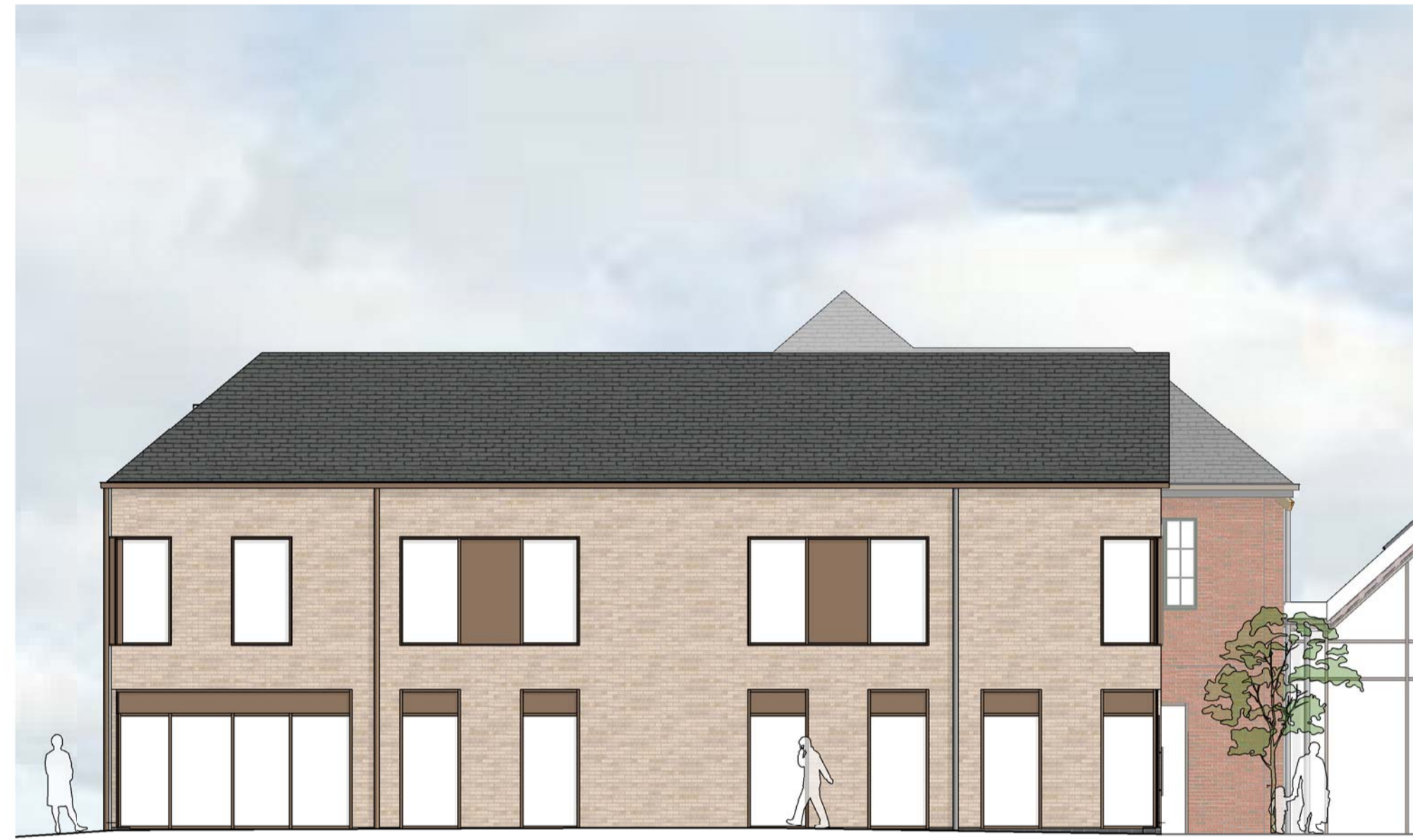
Building 455 - Proposed North Elevation 1 : 100