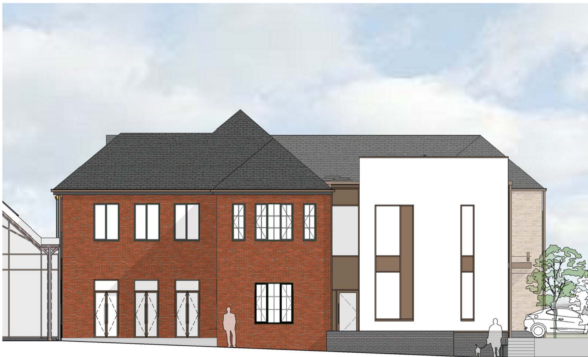
Building 455 - Proposed South Elevation 1 : 100