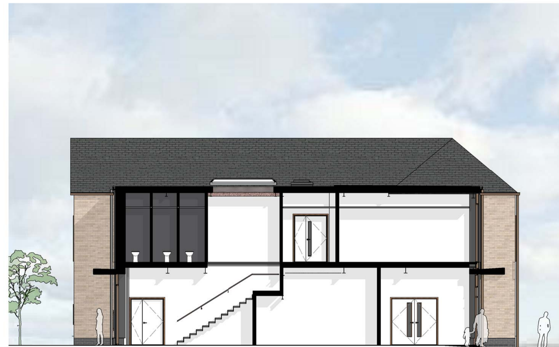
Building 455 - Section BB 1 : 100