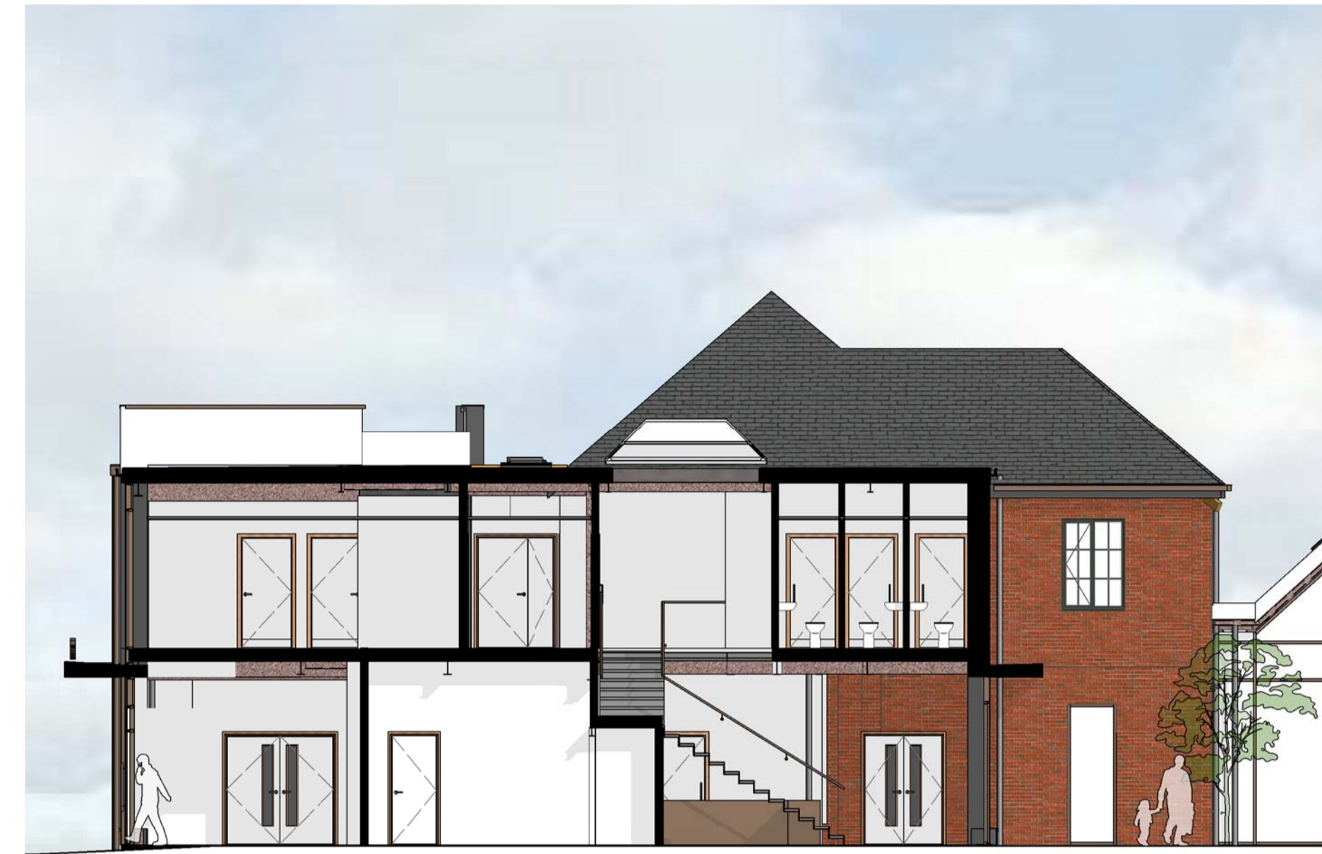
Building 455 - Section AA 1 : 100