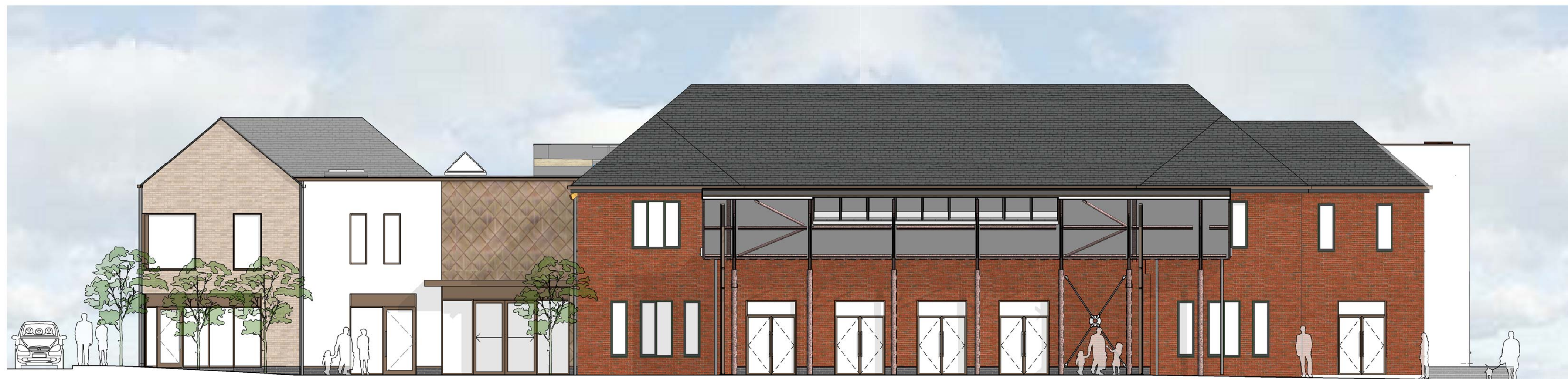
Building 455 - Proposed West Elevation 1 : 100

JOB CODE: CD3216 DRAWING NUMBER: CRD-01-ZZ-DR- A-05035 REVISION: S2-C 4