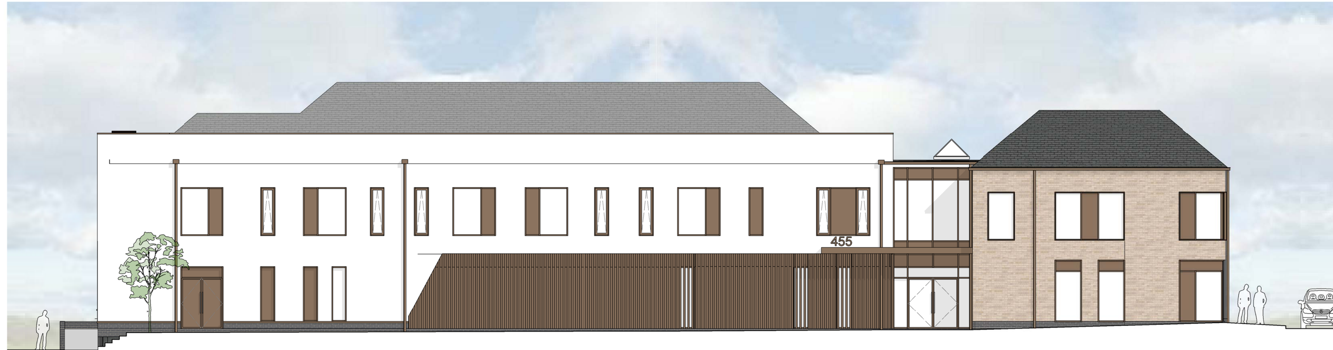
Building 455 - Proposed East Elevation 1 : 100

NOTE: TO BE READ IN CONJUNCTION WITH DESIGN AMENDMENT SCHEDULE FOR DESIGN DEVELOPMENT CHANGES TO APPROVED PLANNING SCHEME. TO BE READ IN CONJUNCTION WITH CORDE APPROVED PLANNING DOCUMENTS - 1100091NMA