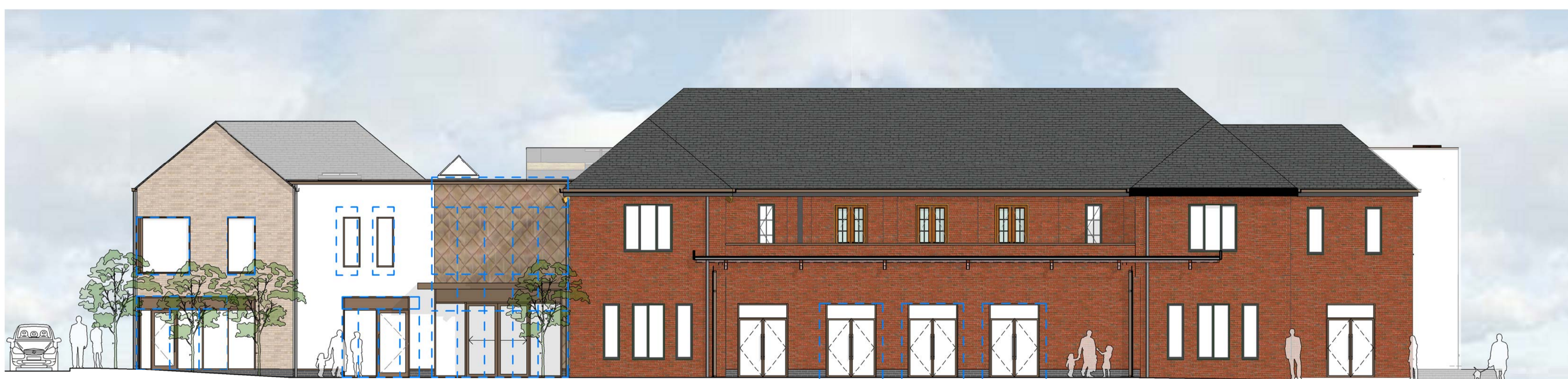
Building 455 - Proposed West Elevation 1 : 100

JOB CODE: CD3216 DRAWING NUMBER: CRD-01-ZZ-DR- A-05030 REVISION: S2-C 4