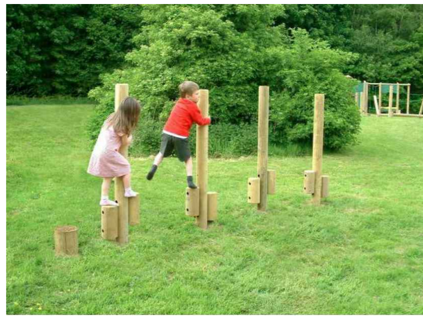
2 - PLAYDALE STRIDING STILTS (PRODUCT CODE STR/4)