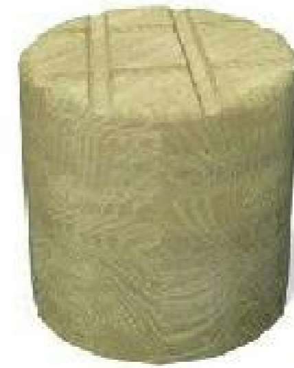
4 - PLAYDALE LOG WALK (PRODUCT CODE AT)