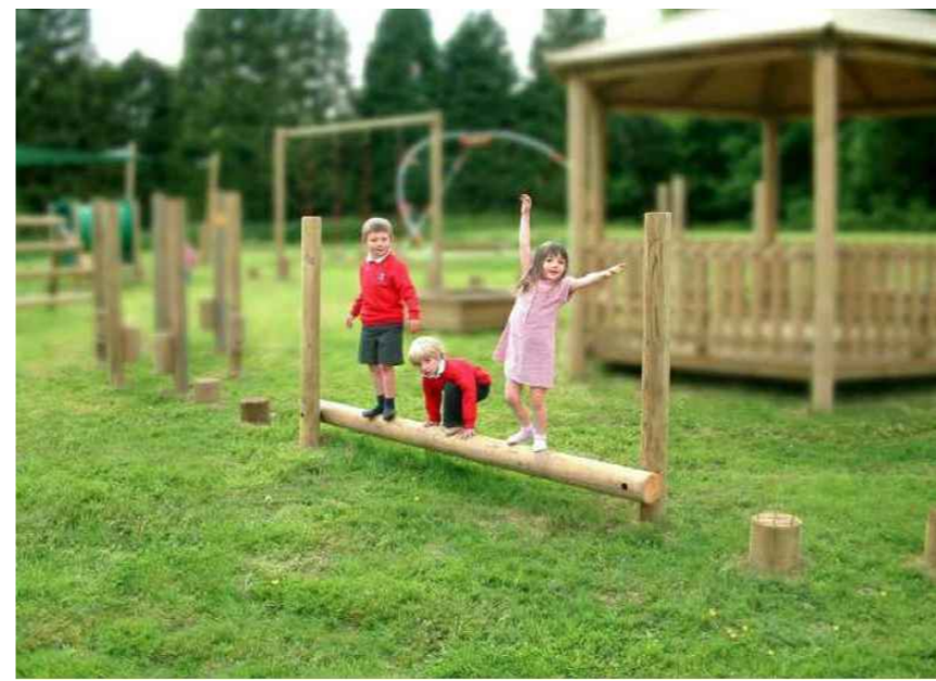
3 - PLAYDALE LOG BEAM (PRODUCT CODE LBM)