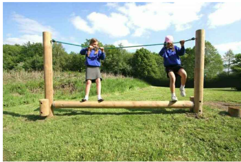
1 - PLAYDALE ROLL 'N' ROPE (PRODUCT CODE RRP)