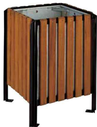
7 - IROKA WOOLBROOK LITTER BIN