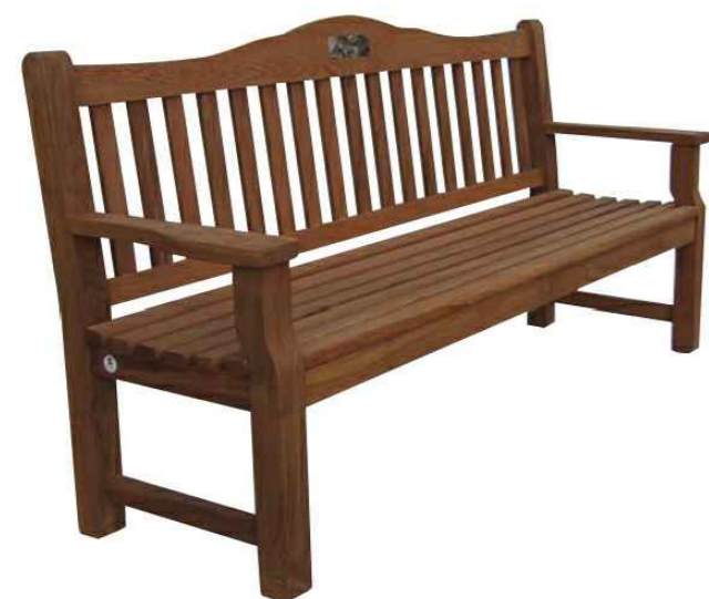
6 -IROKA TRADITIONAL ARCHED BENCH WITH FLAT ARMS