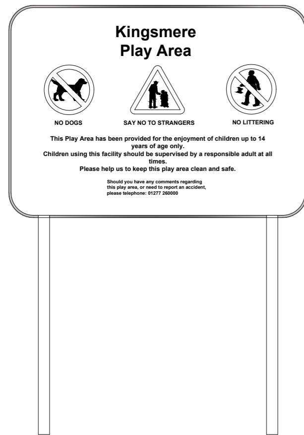
5 - SIGN