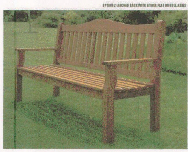
Iroka traditional arched bench with flat arms