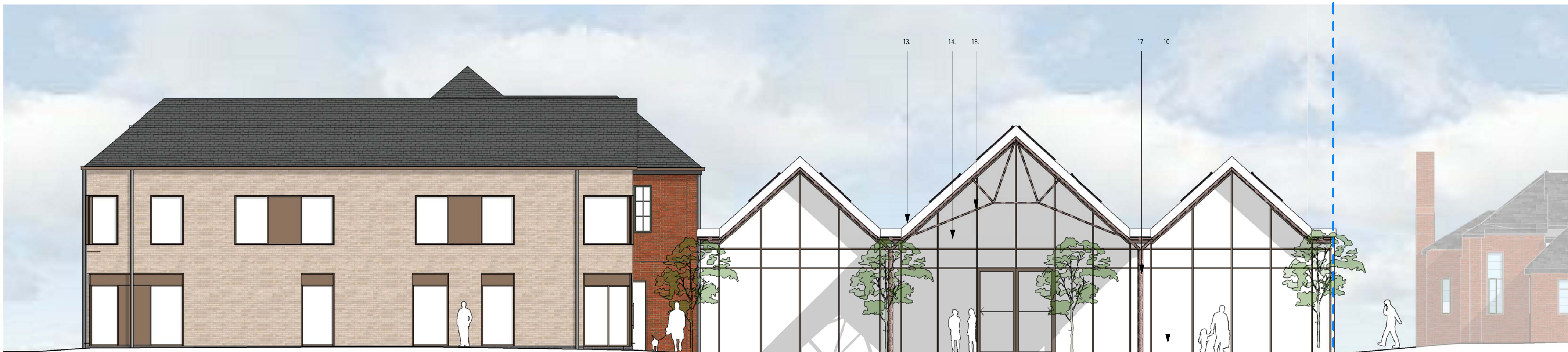
Canopy Link - Proposed Section AA 1 : 100

NOTE: TO BE READ IN CONJUNCTION WITH DESIGN AMENDMENT SCHEDULE FOR DESIGN DEVELOPMENT CHANGES TO APPROVED PLANNING SCHEME. TO BE READ IN CONJUNCTION WITH CORDE APPROVED PLANNING DOCUMENTS - 1700PTMA