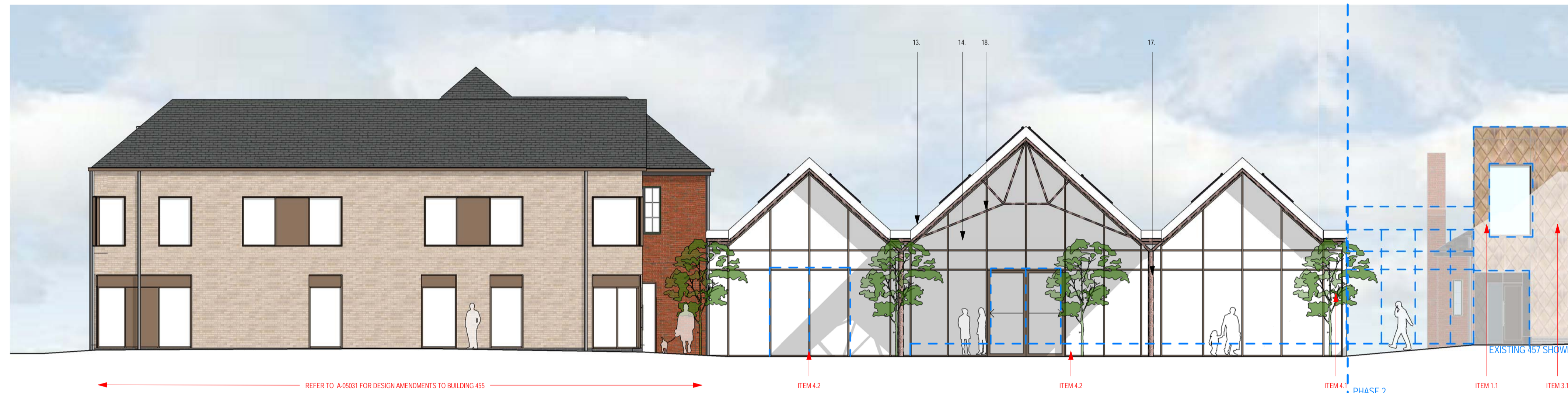
Canopy Link - Proposed North Elevation 1 : 100

NOTE: TO BE READ IN CONJUNCTION WITH DESIGN AMENDMENT SCHEDULE FOR DESIGN DEVELOPMENT CHANGES TO APPROVED PLANNING SCHEME. TO BE READ IN CONJUNCTION WITH CORDE APPROVED PLANNING DOCUMENTS - 17000919A