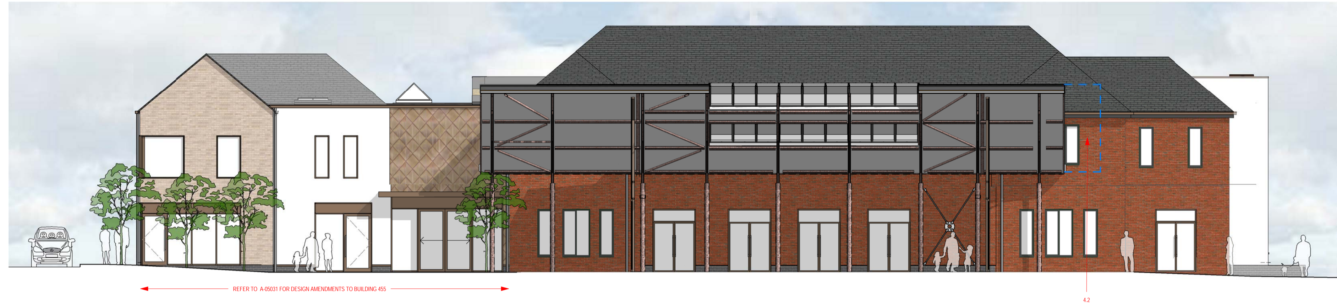
Canopy Link - Proposed Section AA 1 : 100