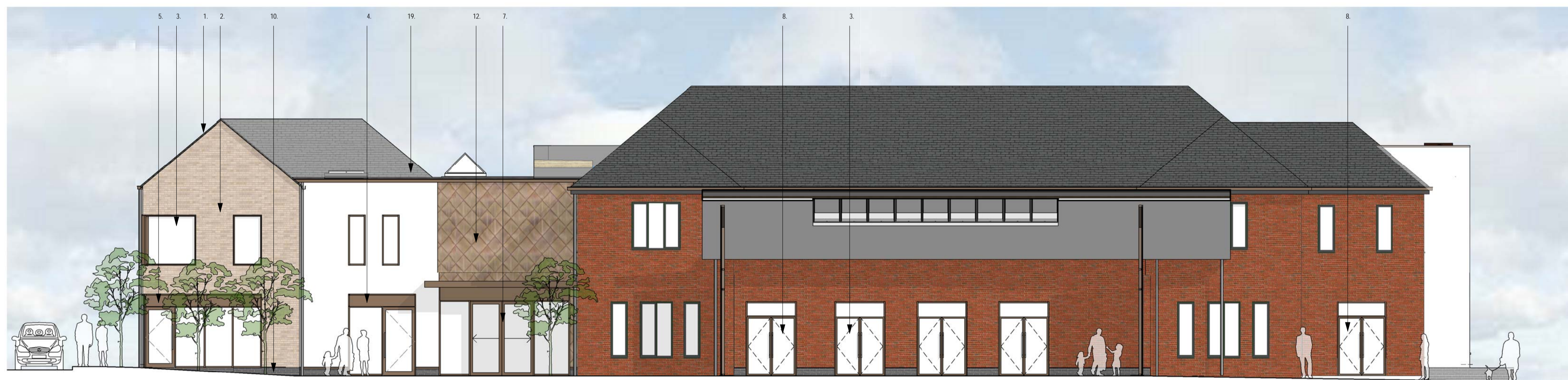
Building 455 - Proposed West Elevation 1 : 100

NOTE: TO BE READ IN CONJUNCTION WITH DESIGN AMENDMENT SCHEDULE FOR DESIGN DEVELOPMENT CHANGES TO APPROVED PLANNING SCHEME. TO BE READ IN CONJUNCTION WITH CORDE APPROVED PLANNING DOCUMENTS - 1100091NMA