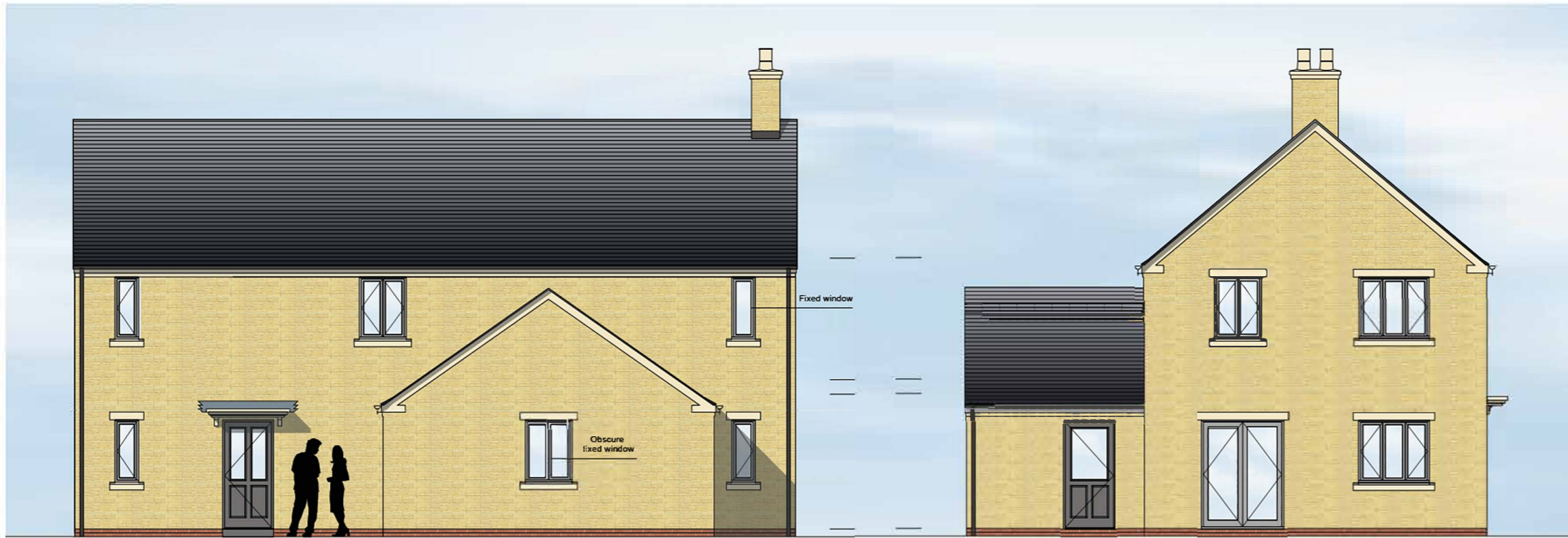
ELEVATION 1 - FRONT

NOTE: ALL BATHROOMS, GARAGE, LANDINGS & ENSUITE WINDOWS TO HAVE OBSCURED GLASS REFER TO EXTERNAL MATERIALS PLAN FOR SPECIFIC MATERIALS AND COLORS.