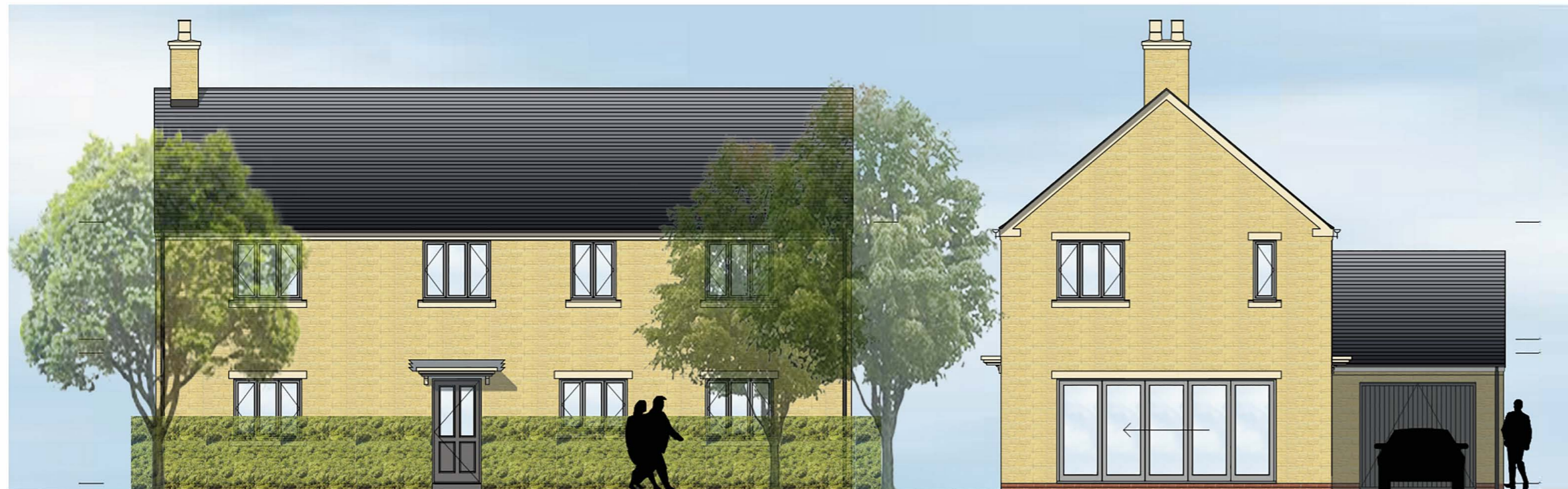
ELEVATION 3 - REAR

Stone: Beckstone Golden Buff - Tumbled Tiles: Rivendale Blue/Black Fibrecement Slate 150mm high Stone Cills and Lintels